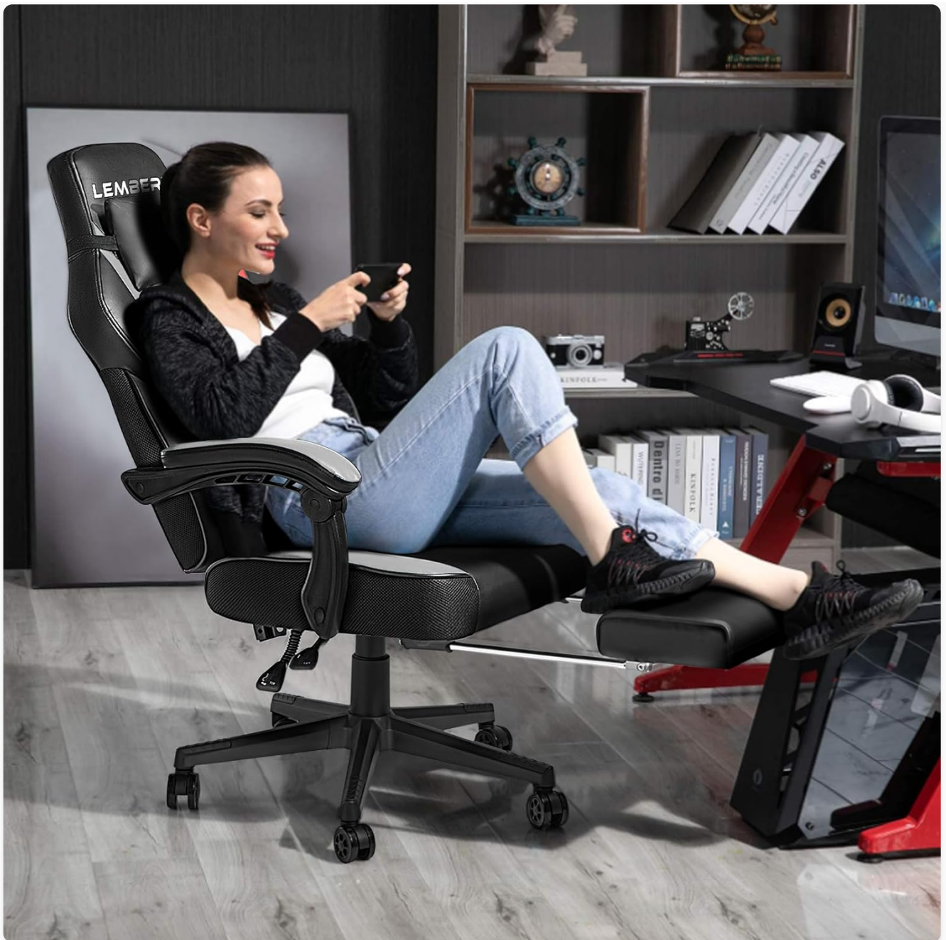
Figure 5: A user demonstrating the extended footrest for relaxation.

Your browser does not support the video tag.