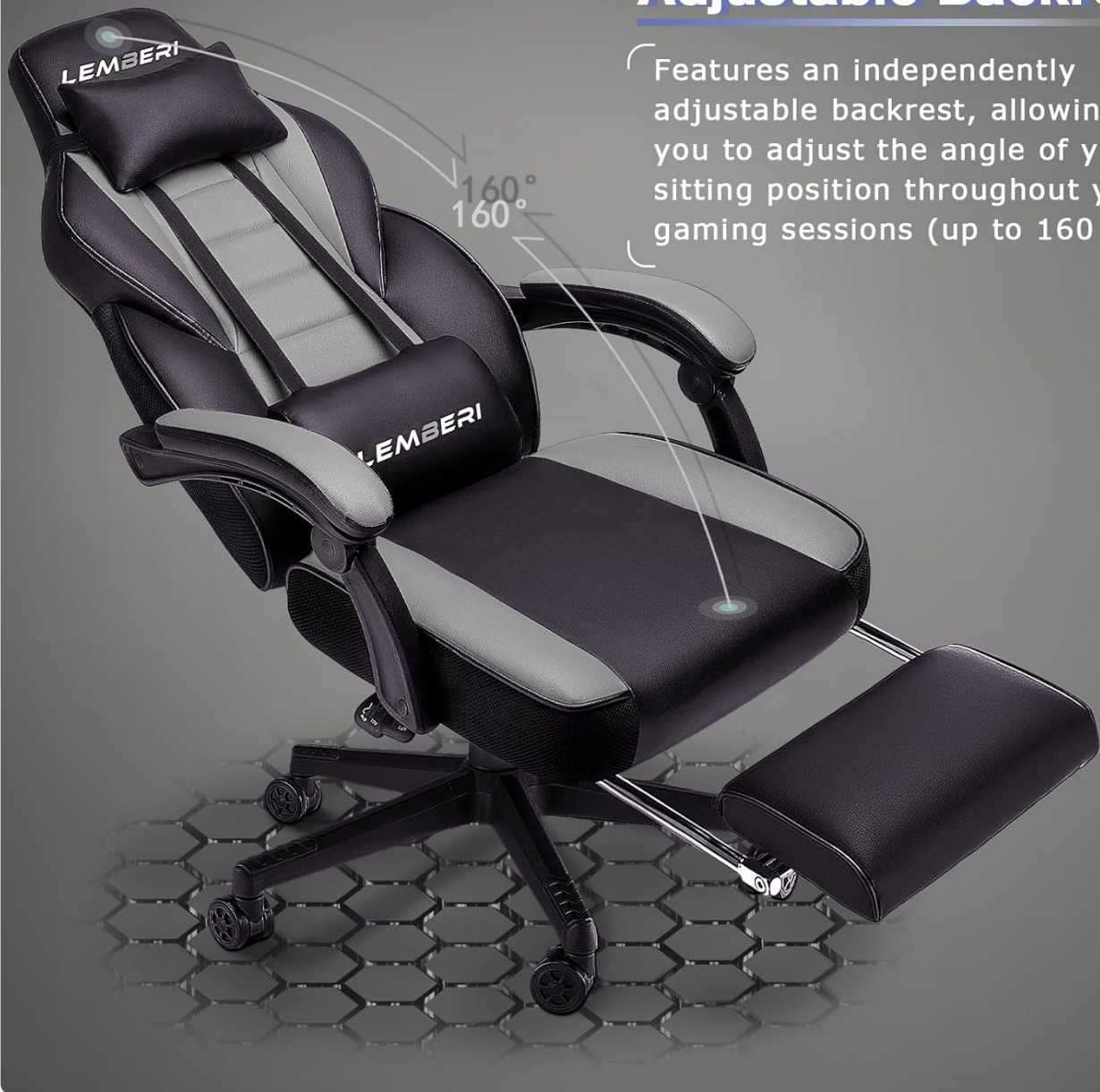
Figure 2: Detailed dimensions of the LEMBERI Gaming Chair.

Features an independently adjustable backrest, allowing you to adjust the angle of your sitting position throughout your gaming sessions (up to 160°)