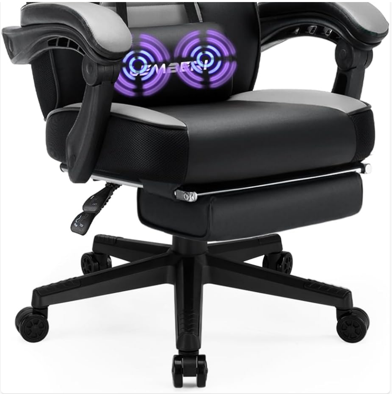
Figure 1: LEMBERI Gaming Chair (Grey model shown)