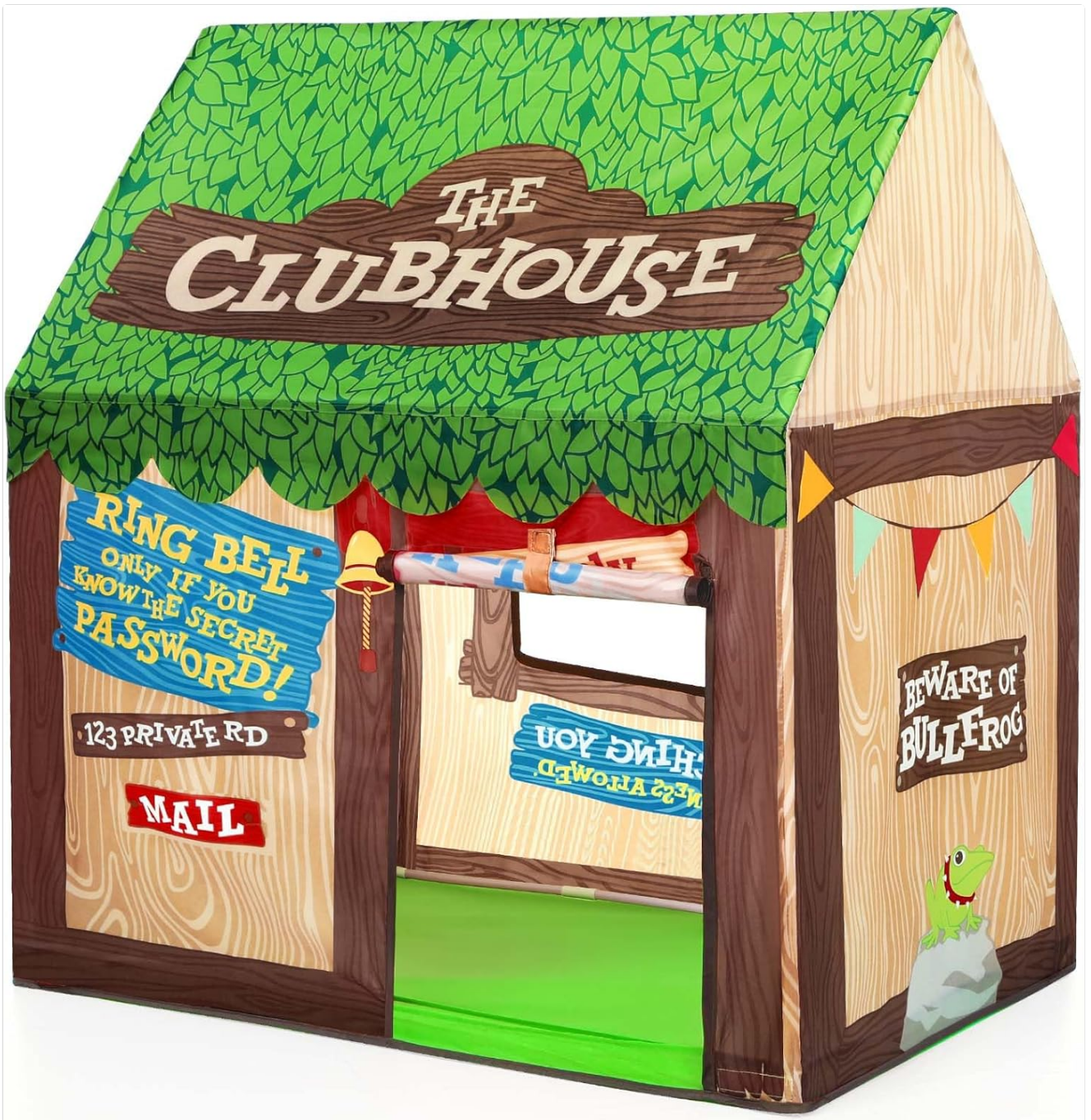
Image: Main view of the assembled SweHouse Kids Clubhouse Tent, showing its design and features.