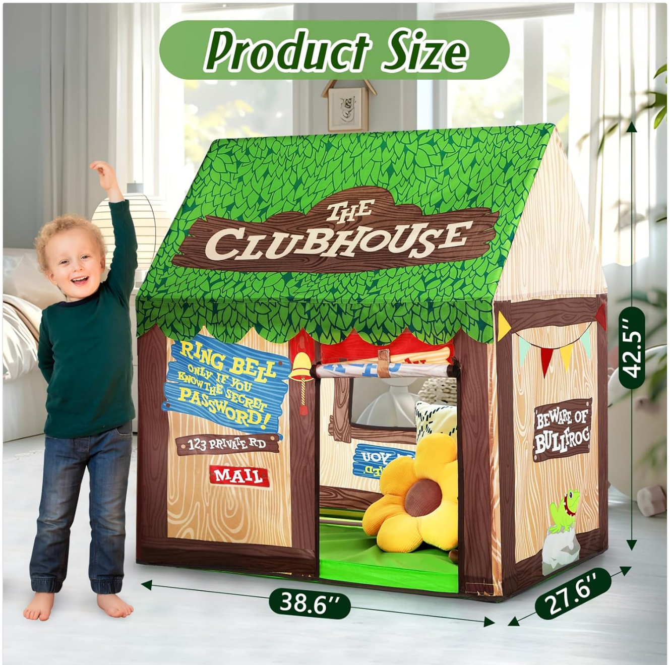
Image: The assembled tent with its dimensions (38.6" L x 27.6" W x 42.5" H) shown, providing a visual reference for its size.