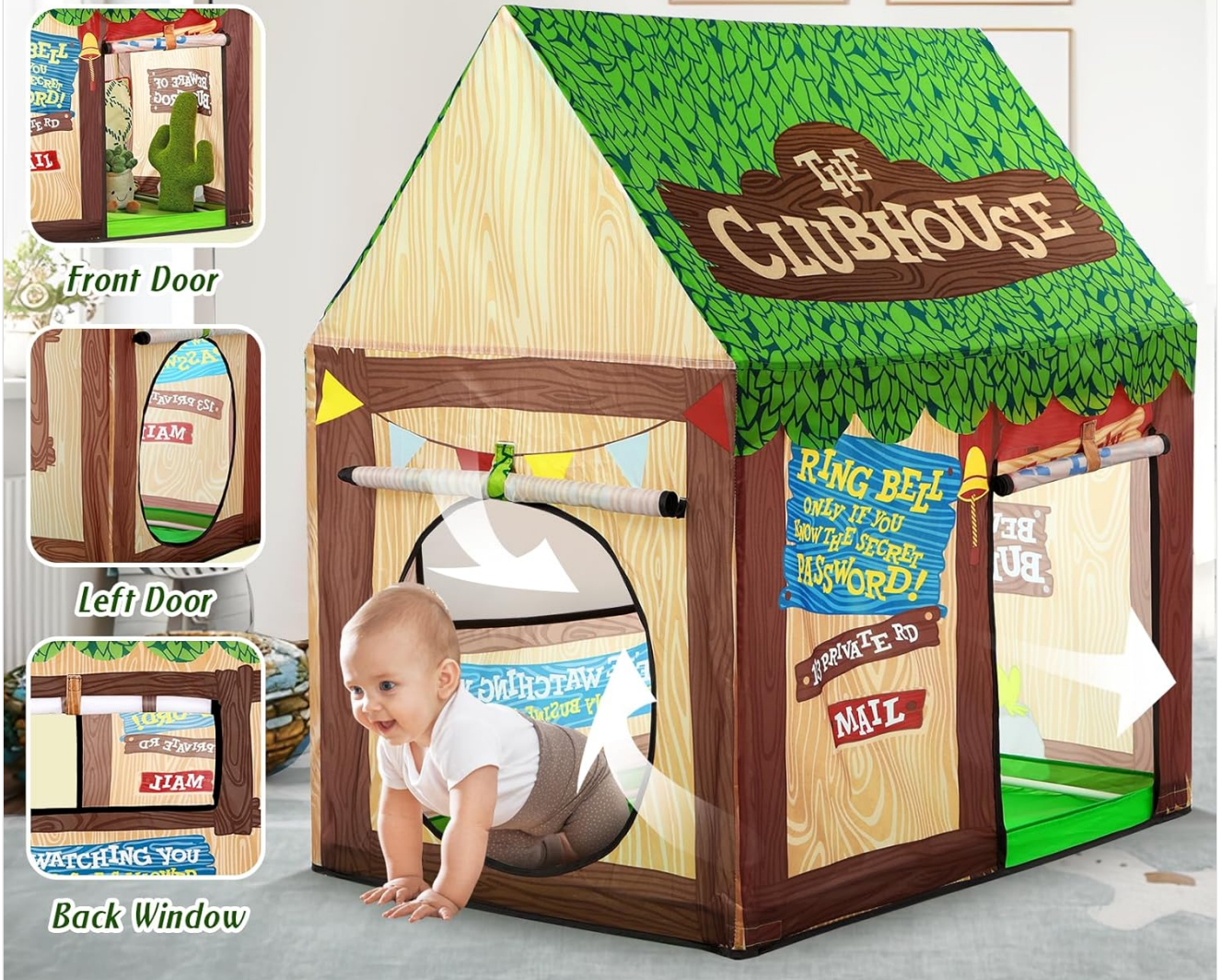
Image: The tent highlighting its ventilated design with a front entry and side windows, ensuring comfort during play.

Front Entry and Side Windows for Airy Comfort