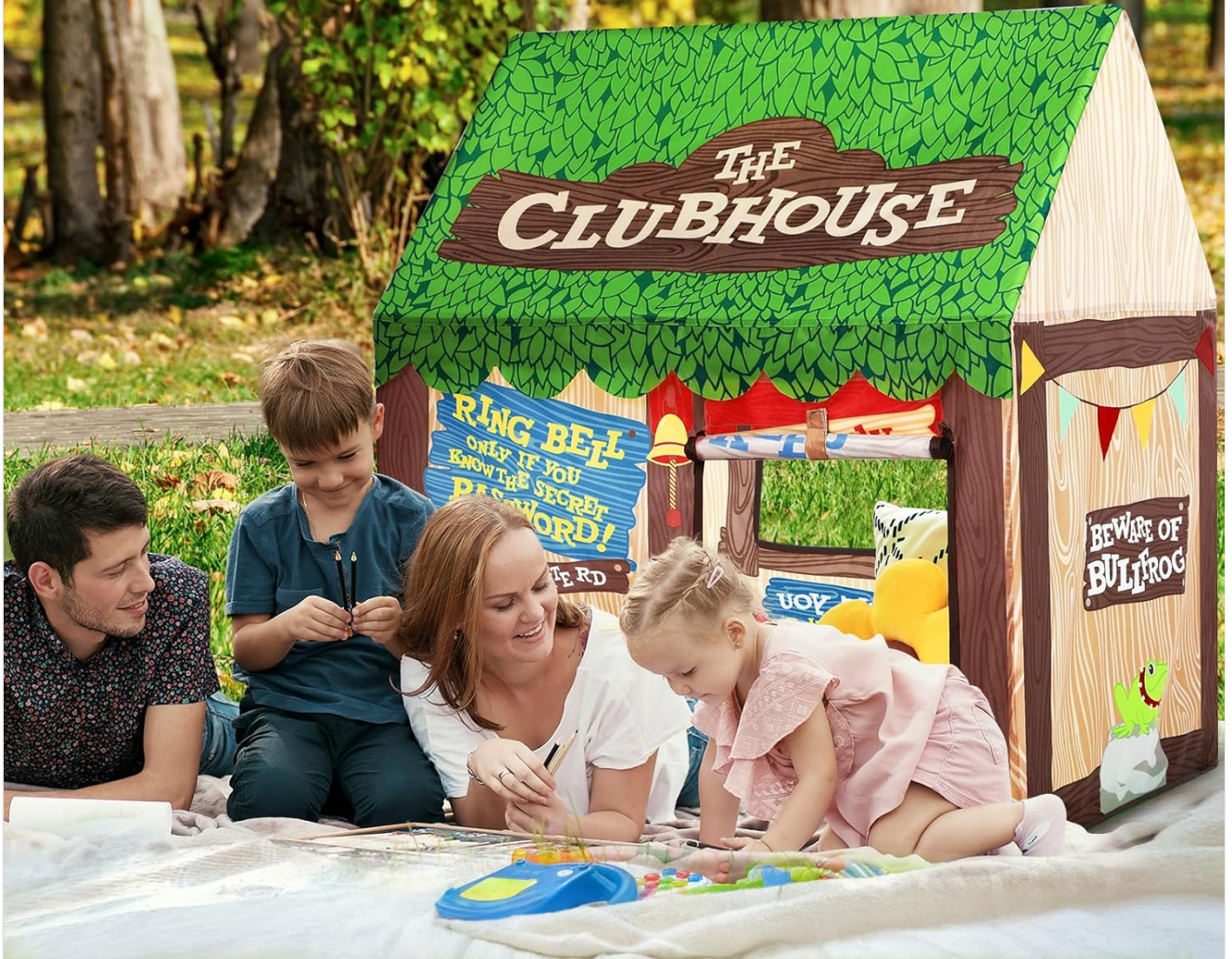
Image: A family enjoying the tent outdoors, demonstrating its suitability for family activities in a natural setting.