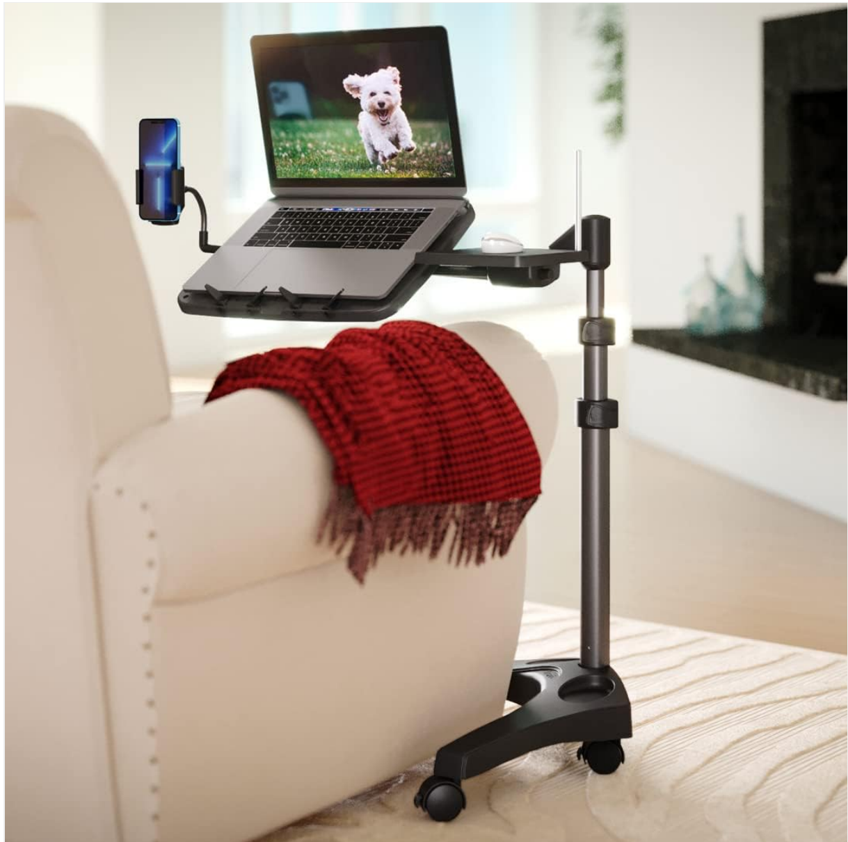
Image: Fully assembled LEVO G2 V16 Laptop Stand positioned next to a recliner.