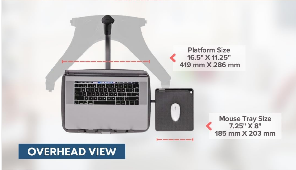
Image: A diagram illustrating key dimensions and specifications of the LEVO G2 V16 Laptop Workstation Stand.