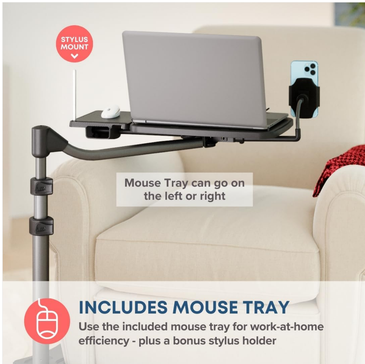
Image: Close-up view of the workstation desktop, highlighting the mouse tray and phone holder attachment points.