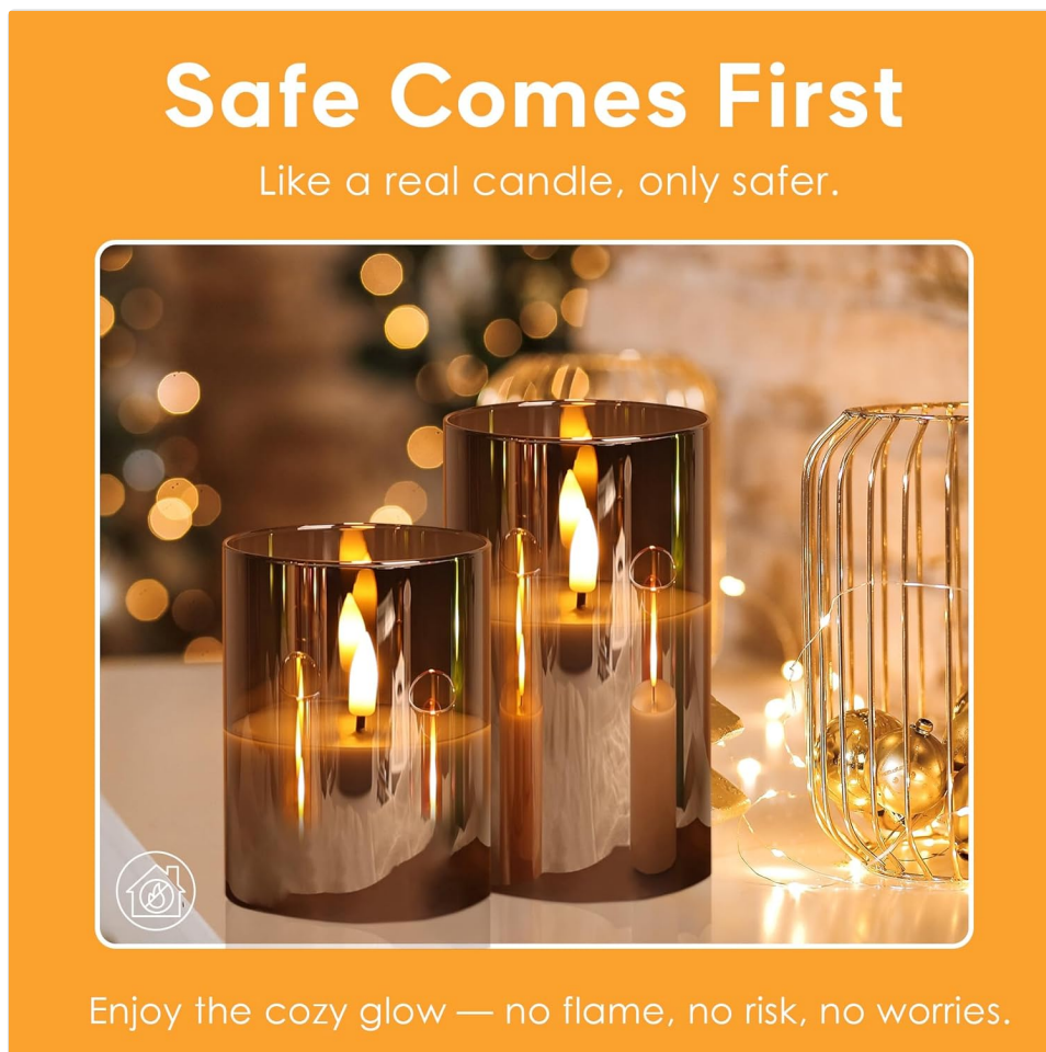
Image 6: Illustration of the safety benefits of flameless candles in a home environment.