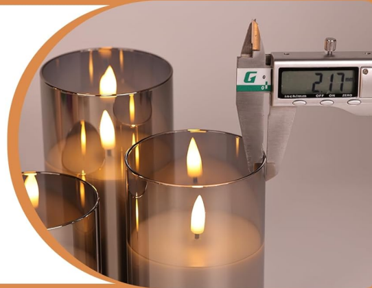
Image 5: Details on the quality materials, including hand-poured wax and heavy-grade glass, which benefit from proper maintenance.

Crafted from heavy-grade glass for a brilliant glow