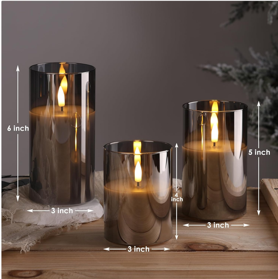
Image 1: Dimensions of the three flameless candles. The candles have a 3-inch diameter and heights of 4, 5, and 6 inches respectively.