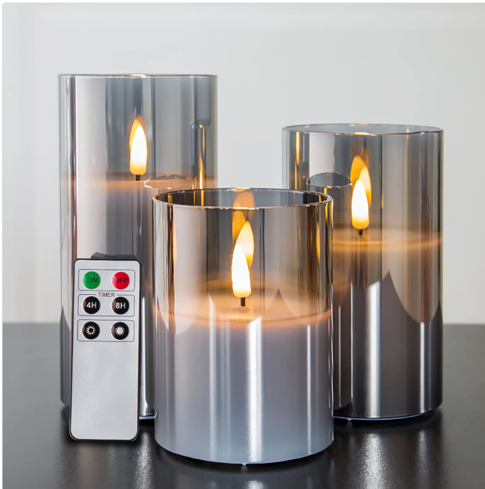
Image 3: The set of three smoke grey flameless candles and their remote control.