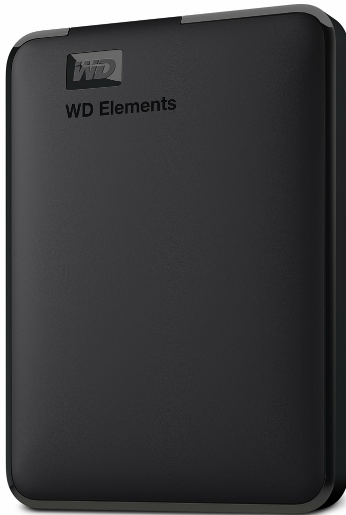
Figure 1: Western Digital WD Elements 5TB Portable External Hard Drive