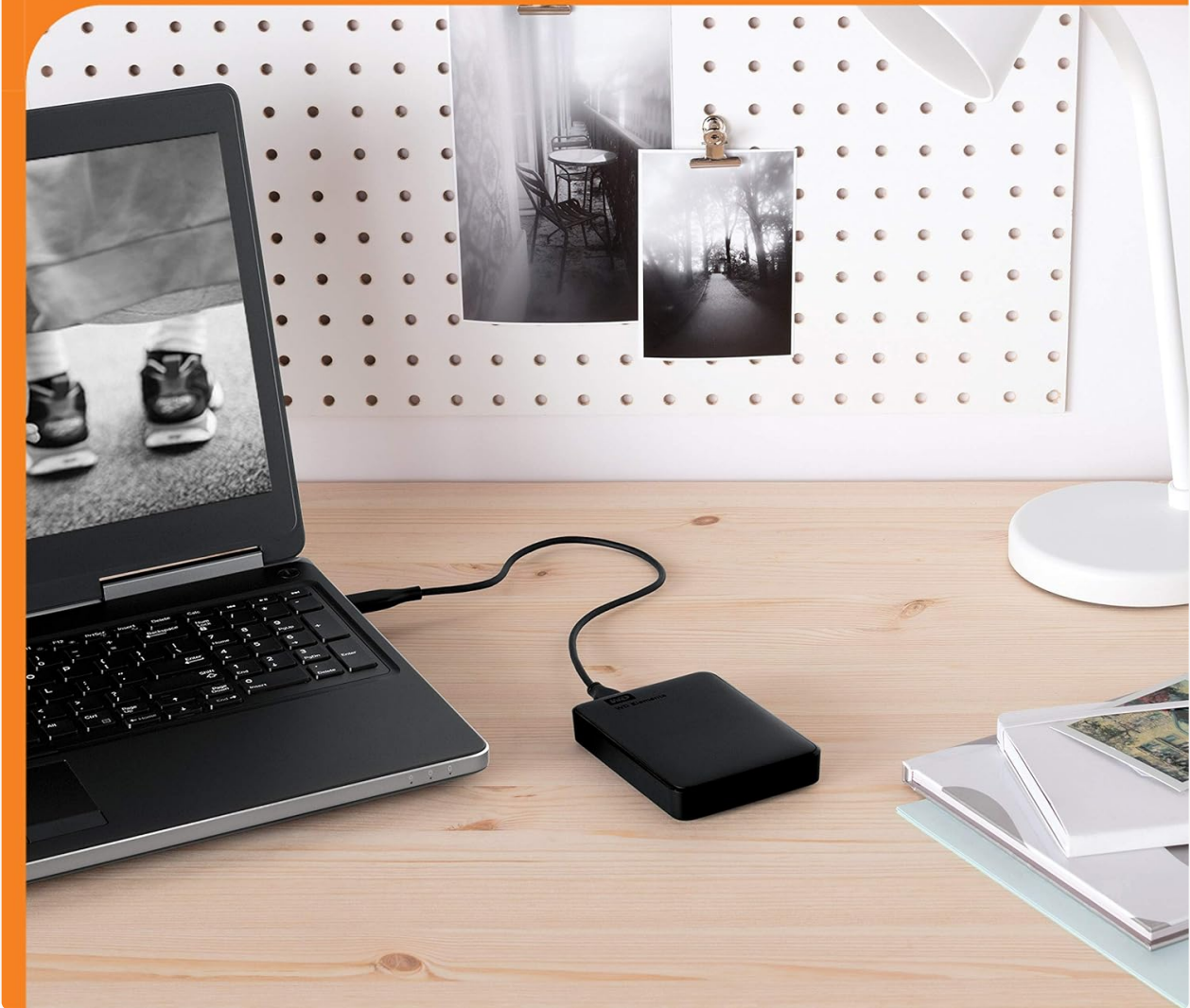
Figure 7: The WD Elements drive is built for durability and reliability, backed by a 2-year limited warranty.