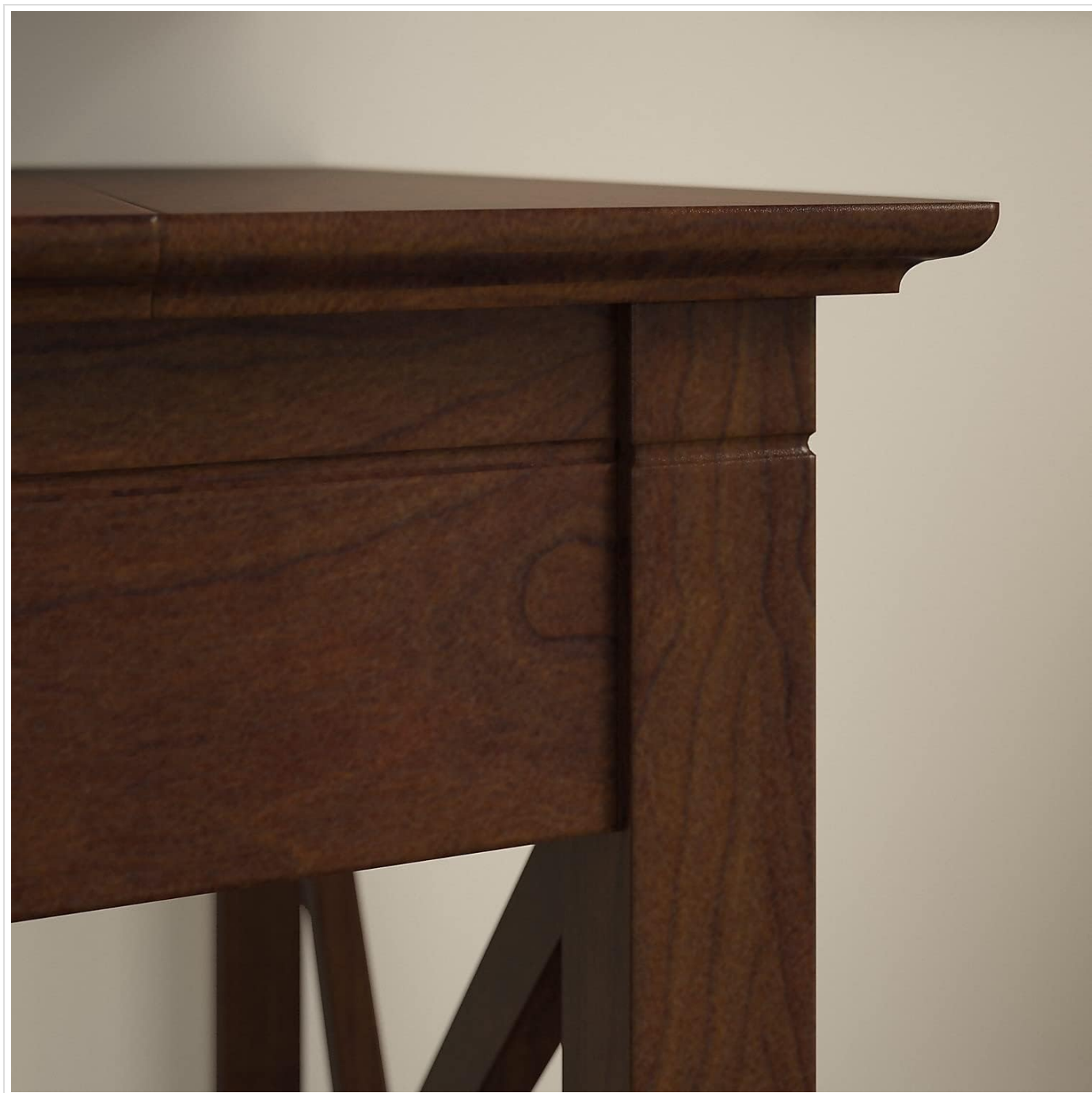
Figure 6.2: View of the desk's finished edge.