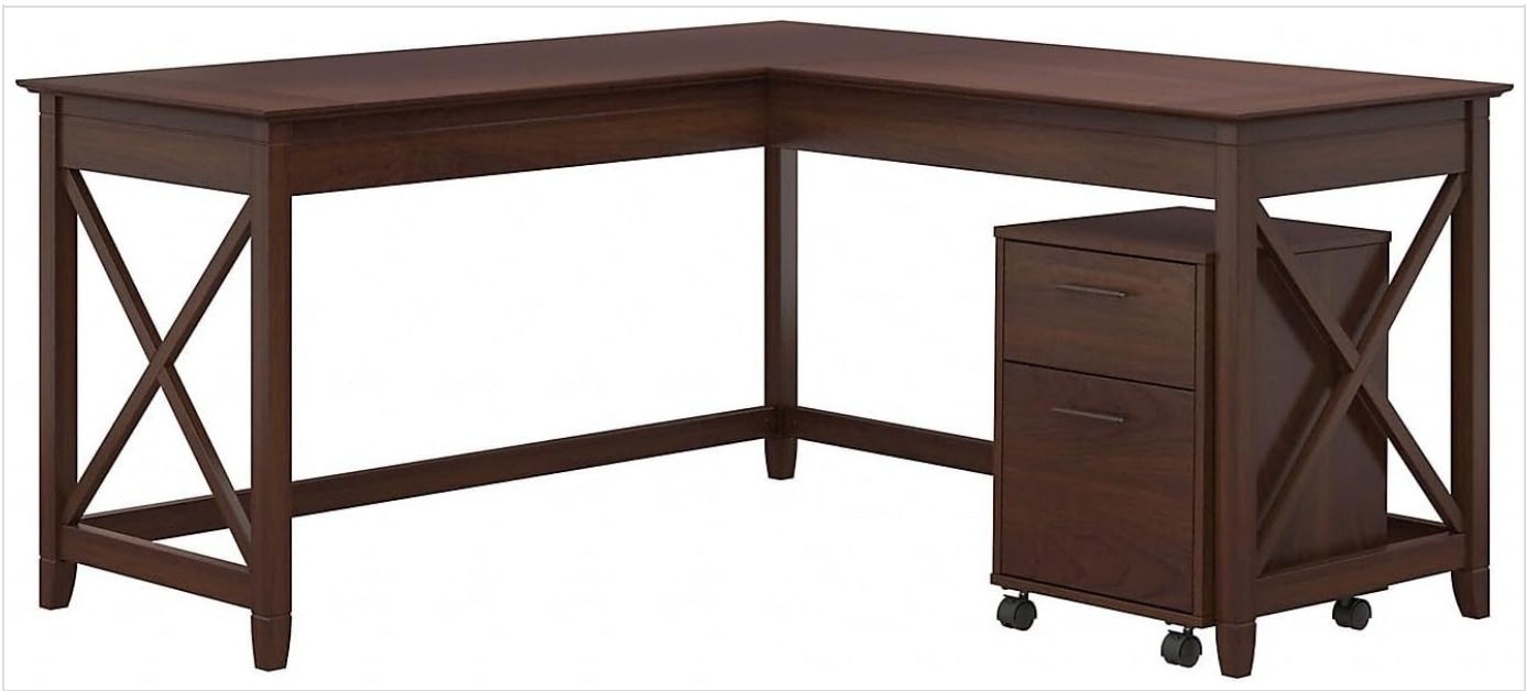
Figure 4.2: Assembled view of the L Shaped Desk and Mobile File Cabinet.