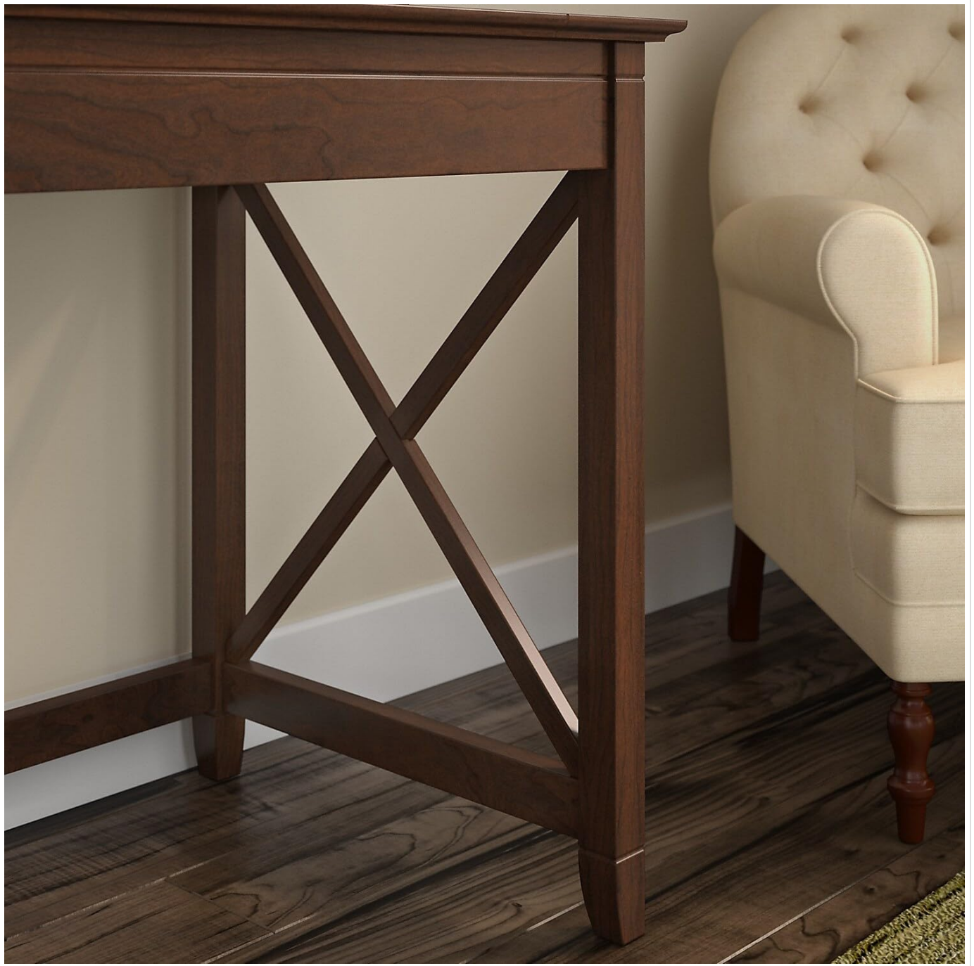
Figure 6.1: Detail of the sturdy X-pattern leg design.