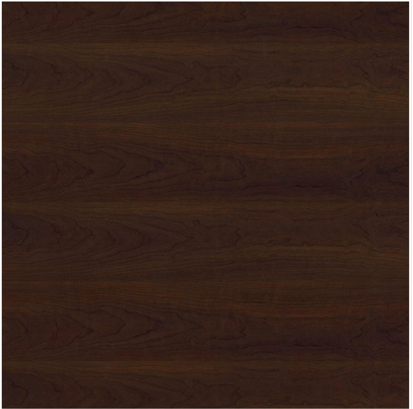
Figure 7.1: The Bing Cherry finish, requiring gentle care.