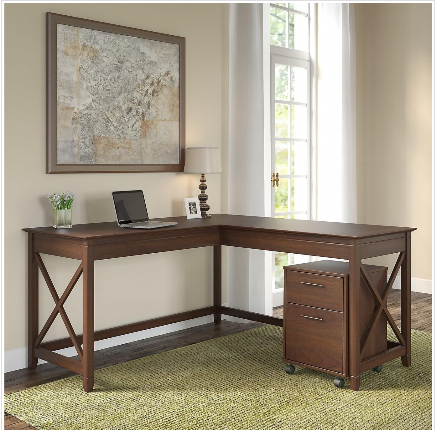
Figure 5.1: The desk and cabinet integrated into a home office environment.