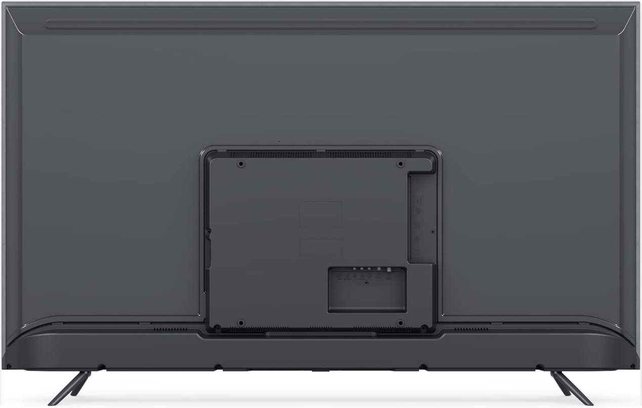
Image: Rear view of the Xiaomi MI TV 4S 55-inch, illustrating the stand mounting locations and various input ports.