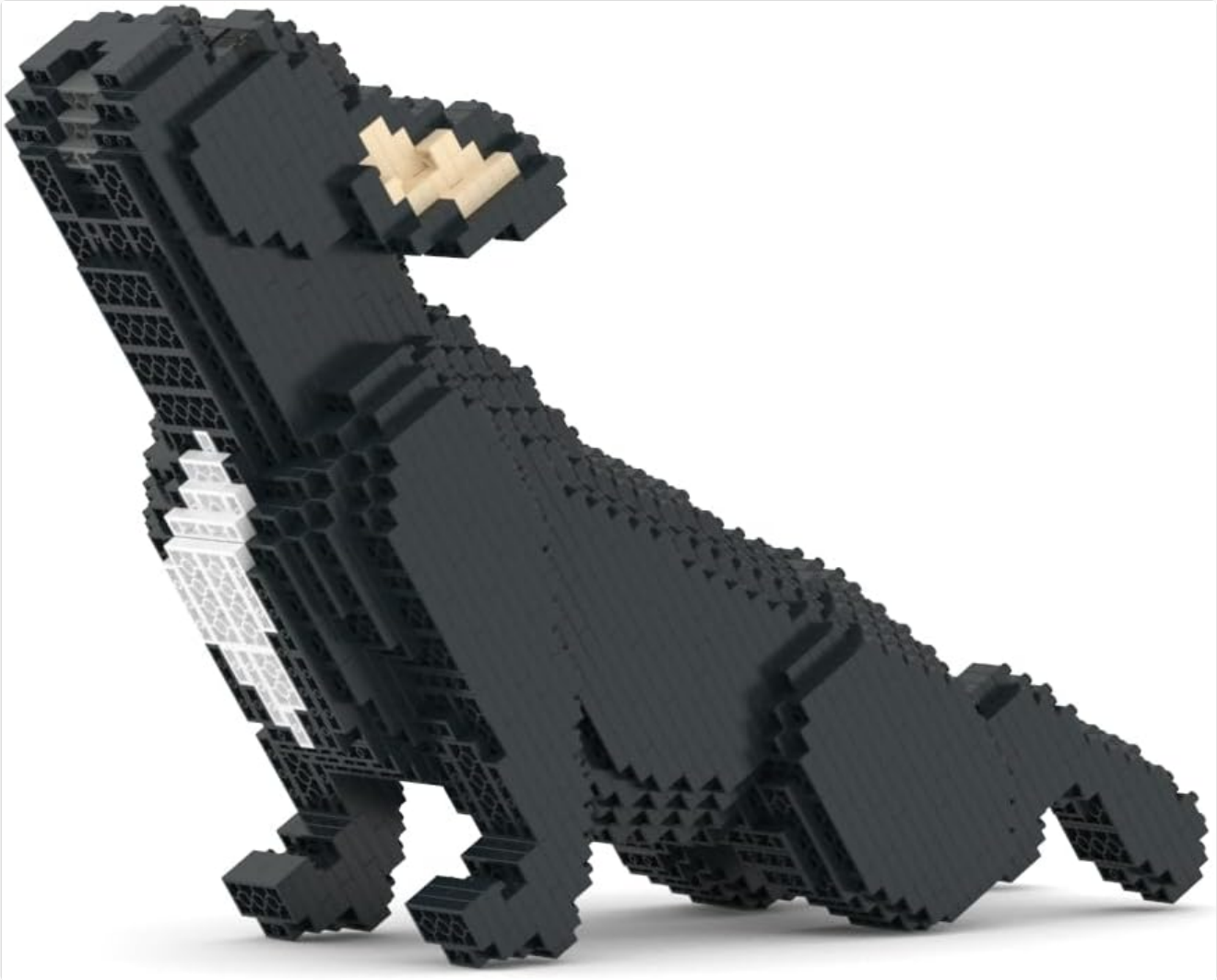
Image: The completed JEKCA French Bulldog 05S-M03 sculpture, showcasing its detailed brick construction and pose.