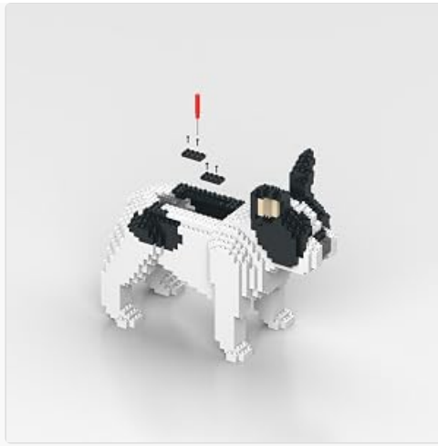
Image: A detailed three-step illustration of how to connect JEKCA bricks using the interlocking pins and driver tool.