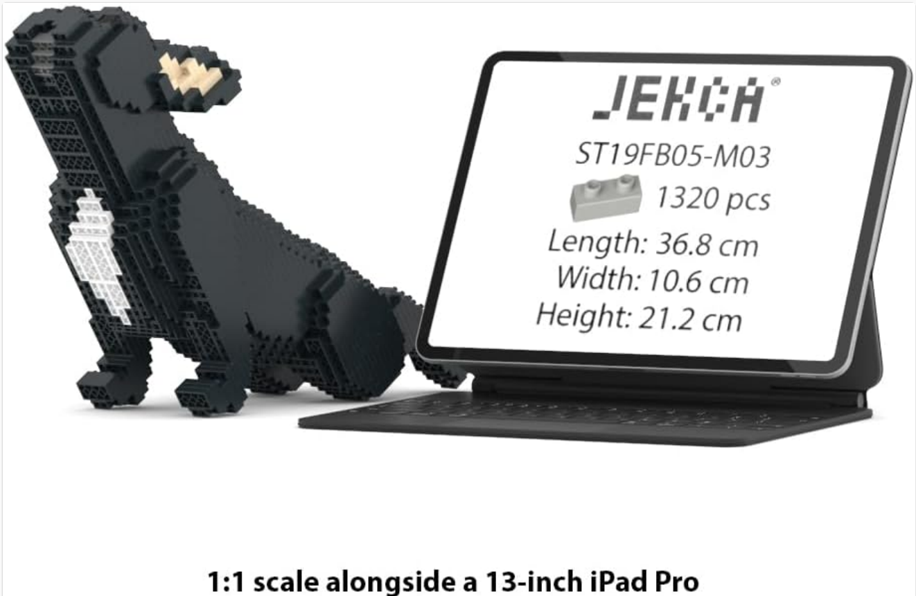
Image: The JEKCA French Bulldog sculpture shown alongside a 13-inch iPad Pro for scale, with key dimensions and piece count displayed.