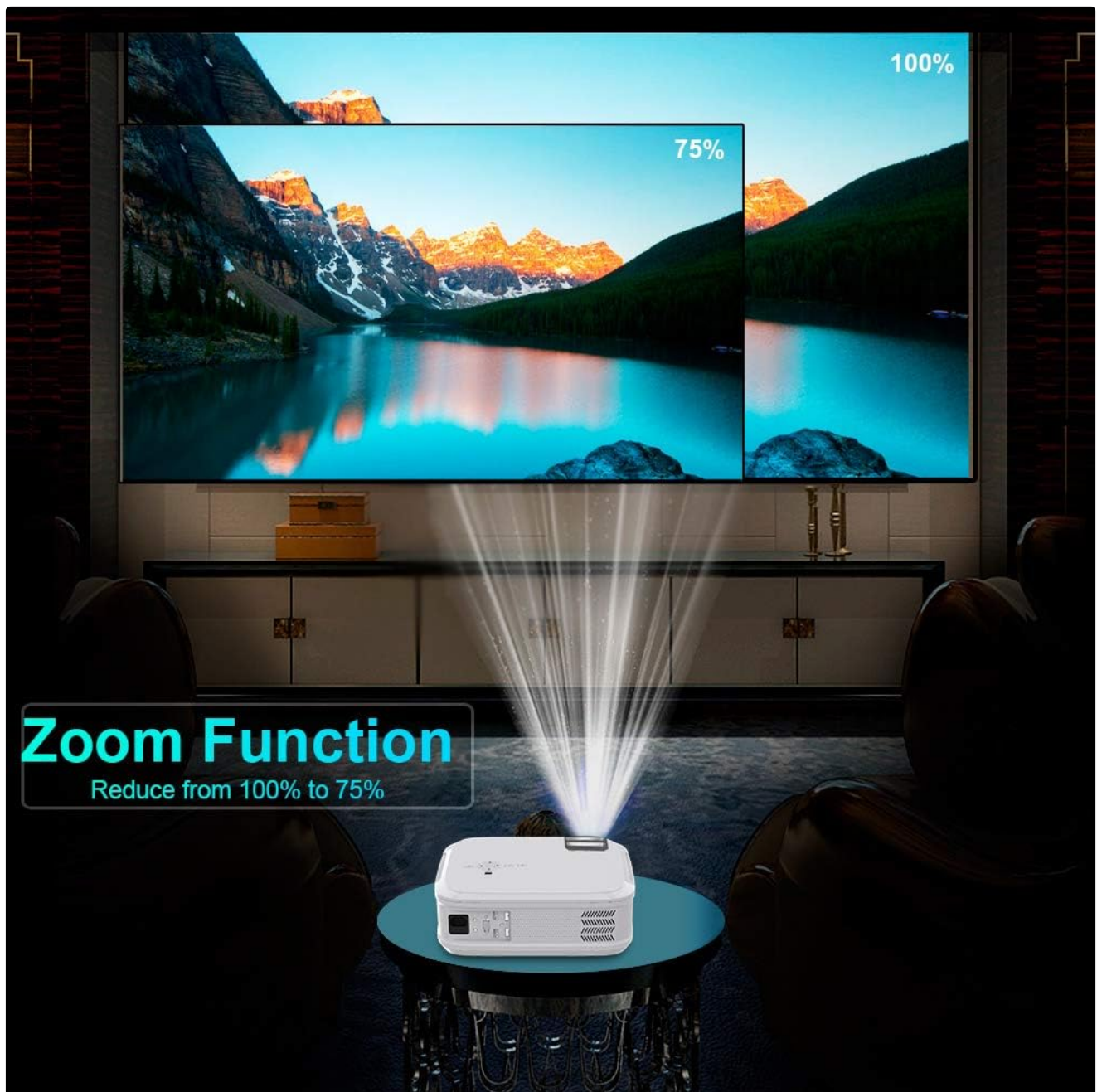
Image: Front view of the WiMiUS P21 Projector, showing the lens and control panel.