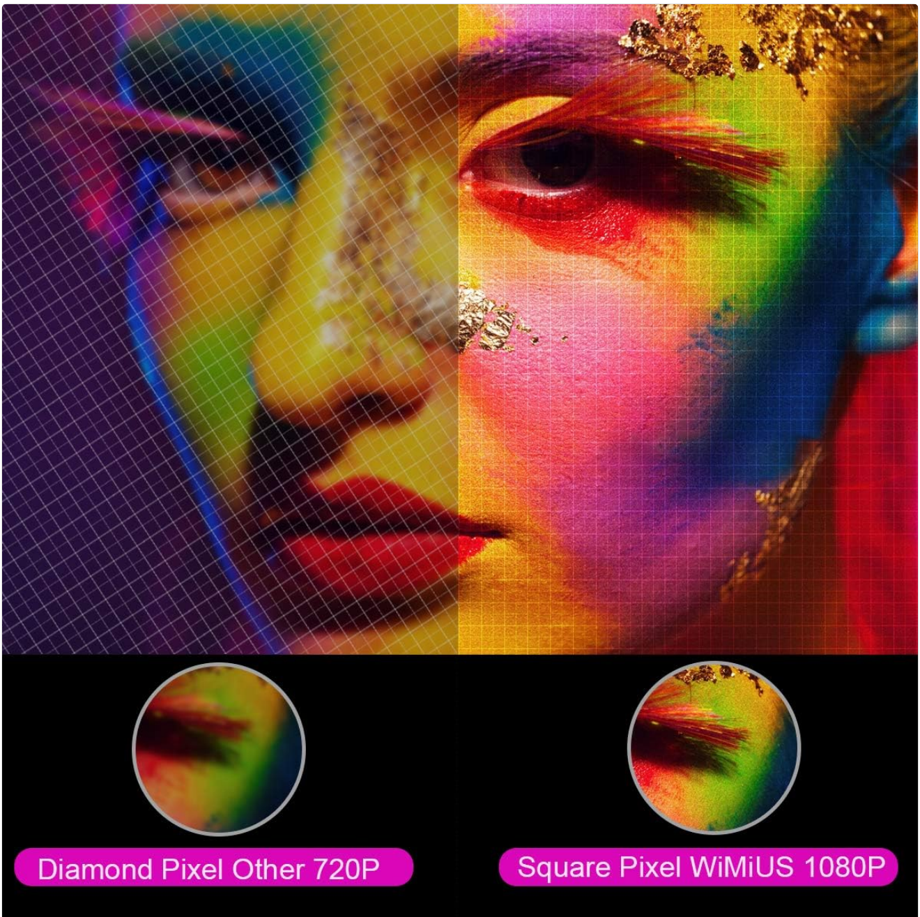
Image: A magnified view comparing the pixel structure of a 720P projector (diamond pixel) versus the WiMiUS 1080P projector (square pixel), demonstrating higher resolution.