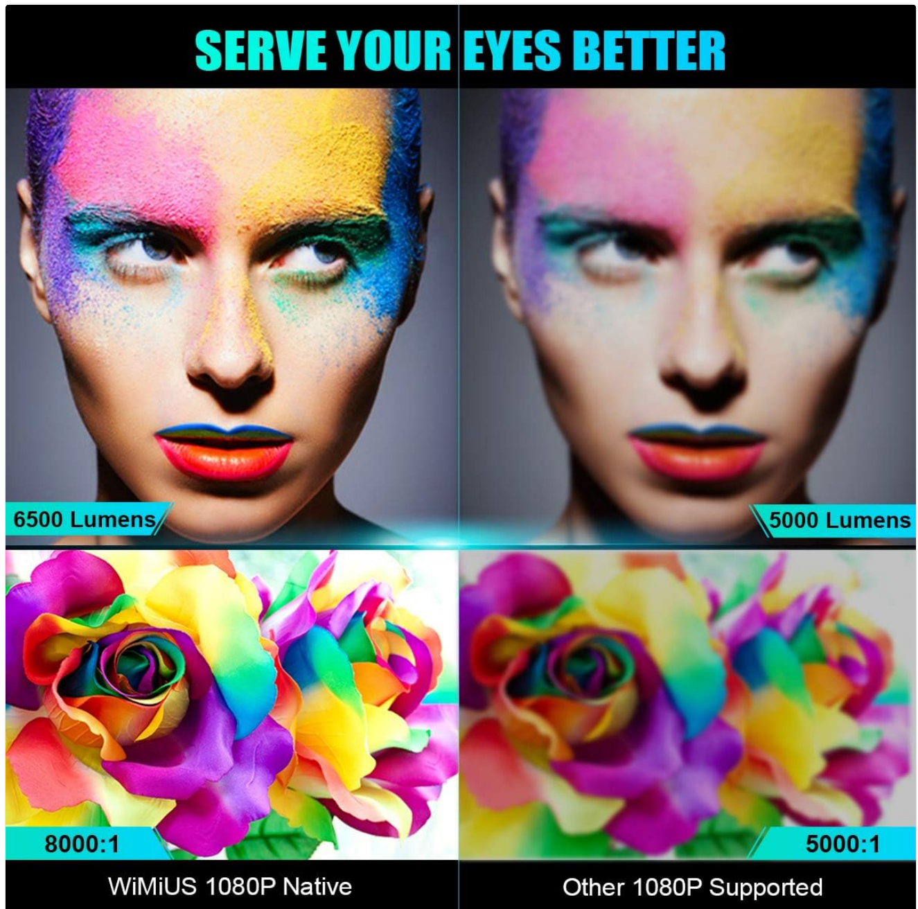
Image: Visual comparison illustrating the difference between 6500 lumens with 8000:1 contrast and lower specifications, highlighting improved clarity and color saturation.