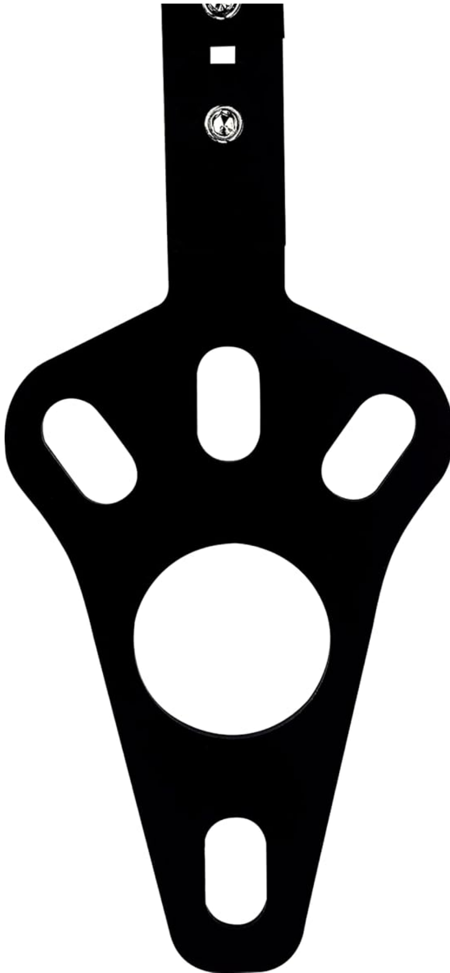
Figure 1: The RYDEEN JB01 Jeep Spare Tire Backup Camera Bracket. This sturdy metal bracket is designed to securely hold a backup camera behind the spare tire of a Jeep.