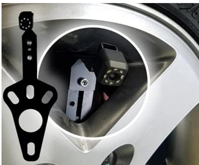
Figure 7: Another close-up of the JB01 bracket with a RYDEEN MINy backup camera attached, highlighting the secure fastening points and the camera's orientation.