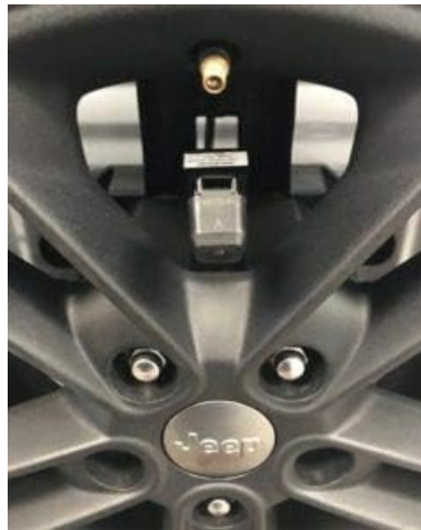
Figure 3: The backup camera, mounted on the JB01 bracket, positioned within the spokes of a Jeep spare tire wheel. This placement allows for a clear view behind the vehicle.