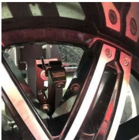
Figure 6: A detailed perspective of the camera and bracket assembly, showing its integration within the wheel structure. The bracket's design allows for precise camera positioning.