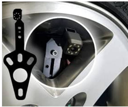
Figure 2: A close-up view of the JB01 bracket with a compatible RYDEEN MINy backup camera attached. The camera is secured to the upper portion of the bracket using screws.