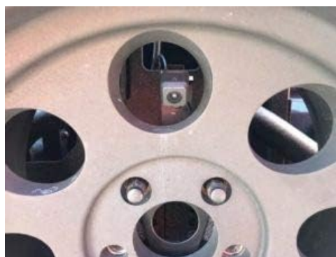
Figure 5: A view from inside the spare tire wheel, illustrating how the backup camera is securely mounted to the JB01 bracket and positioned to look out through a wheel spoke.