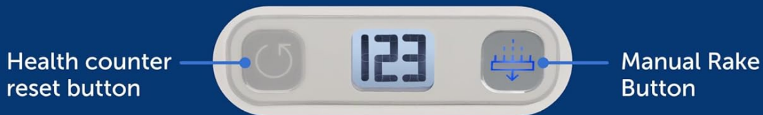
Image: A detailed view of the litter box's control panel, highlighting the health counter LCD display, reset button, and manual rake button.