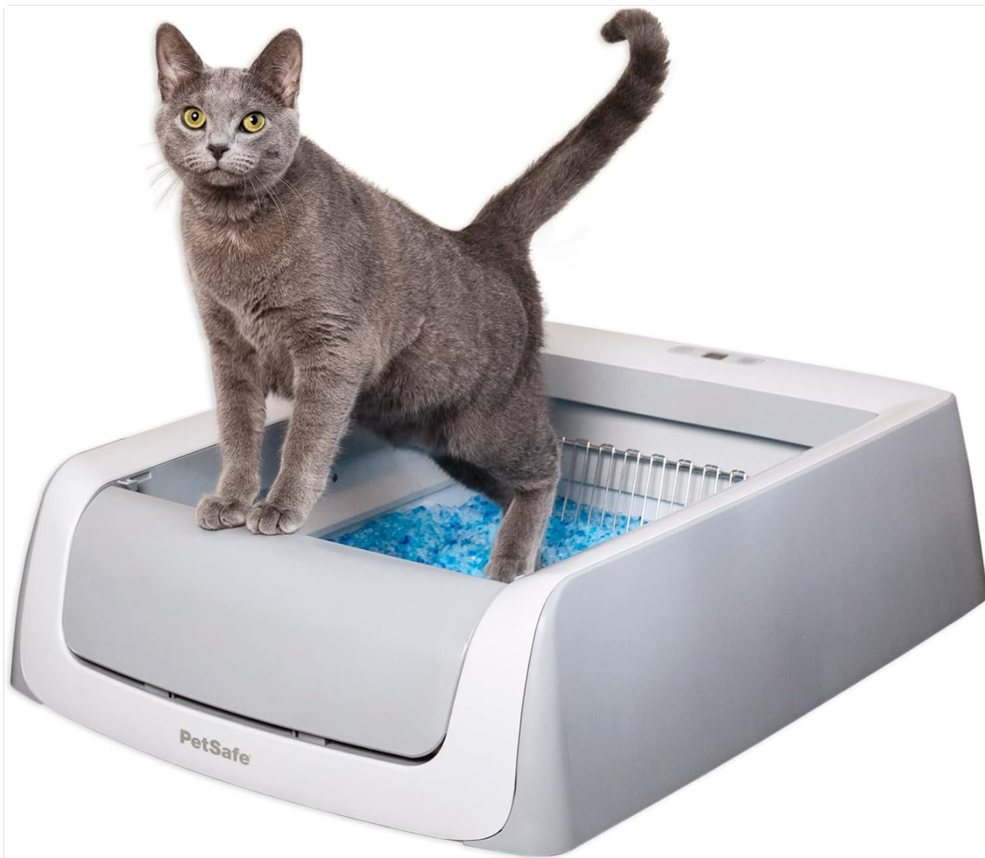
Image: The PetSafe ScoopFree Crystal Pro Self-Cleaning Cat Litter Box, showing its open design and crystal litter, with a cat demonstrating its use.