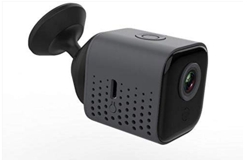
Image: Close-up of the DENT Mini WiFi Camera showing the microSD card slot on the side.

Insert a microSD card (up to 128GB, not included) into the TF socket for local storage. Ensure the camera is powered off before inserting or removing the card.