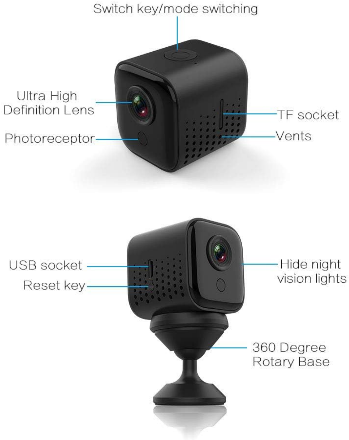
Image: Front and back views of the DENT Mini WiFi Camera with labels pointing to its key features like the lens, switch key, TF socket, USB socket, reset key, night vision lights, and 360-degree rotary base.