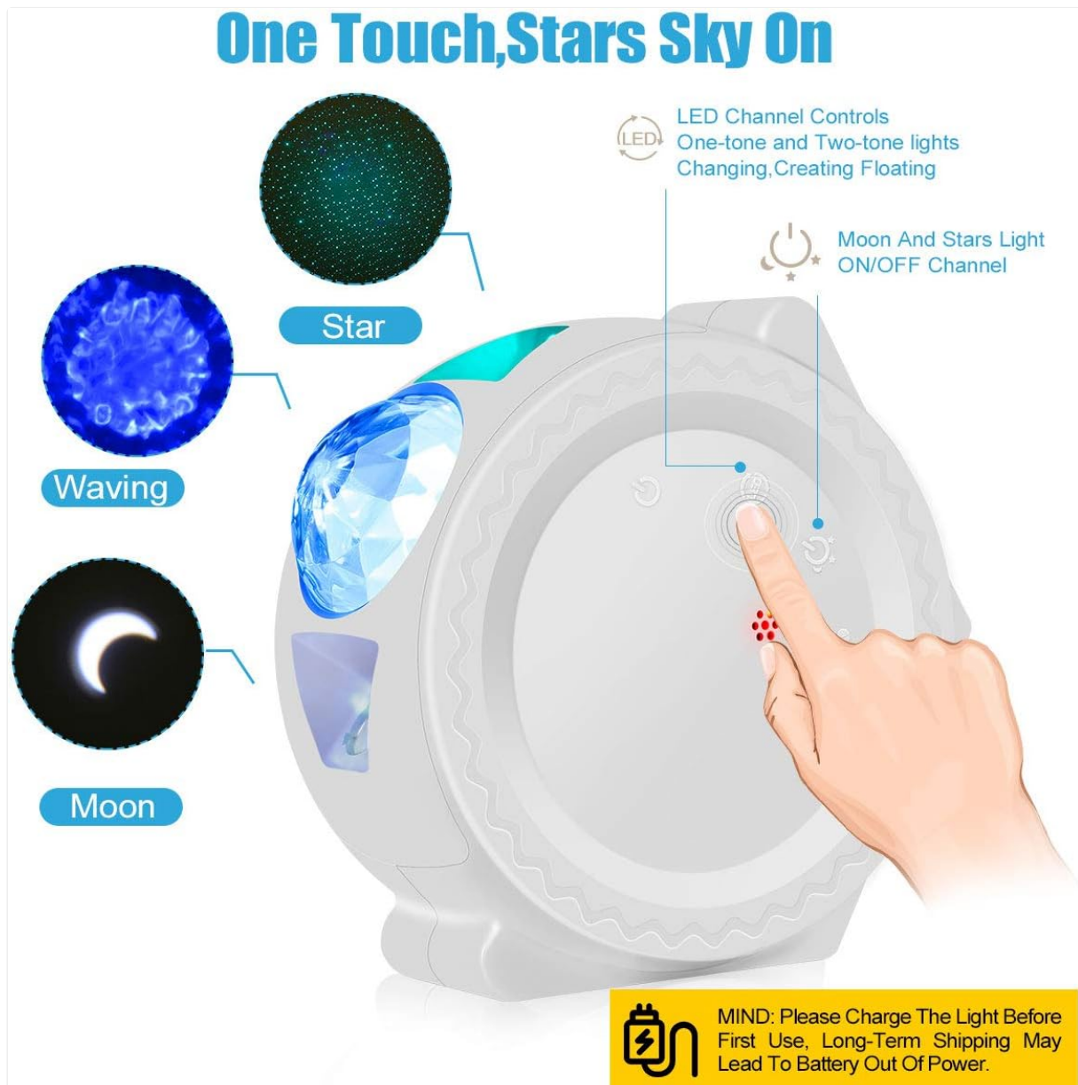
Image: The projector's top surface showing the four touch-sensitive buttons for controlling stars, waving light, moon projection, and LED color channels.

The projector features four touch-sensitive buttons on its surface. Gently press these buttons with your thumb to control various functions.