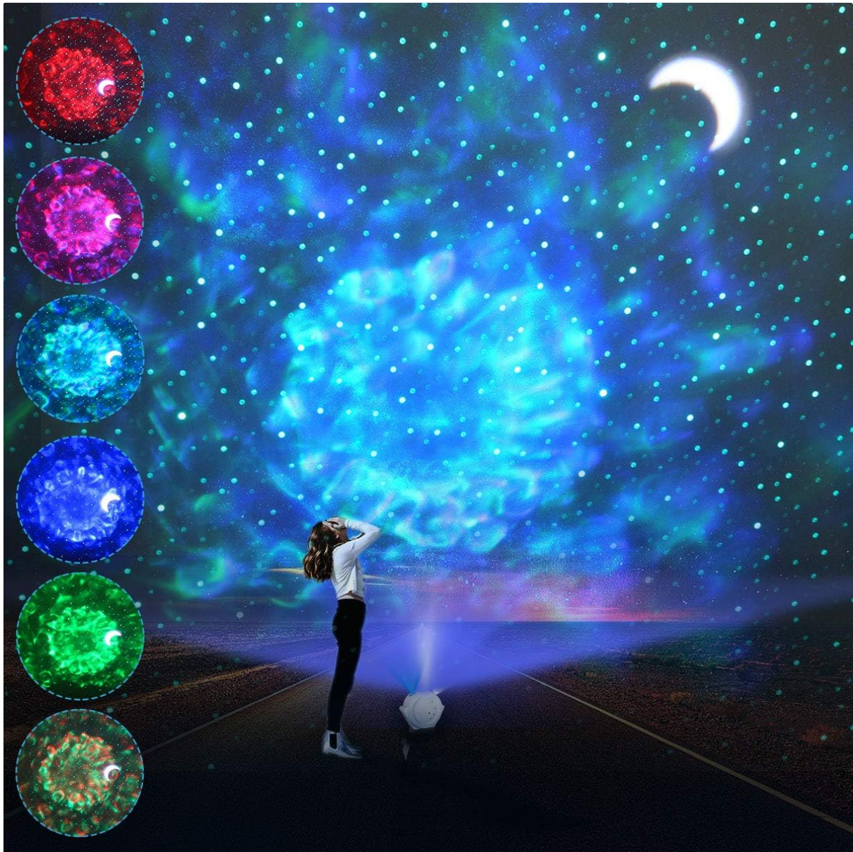
Image: A visual representation of the projector's different color outputs, including red, pink, cyan, blue, green, and a multi-color blend, with a person observing the projection.