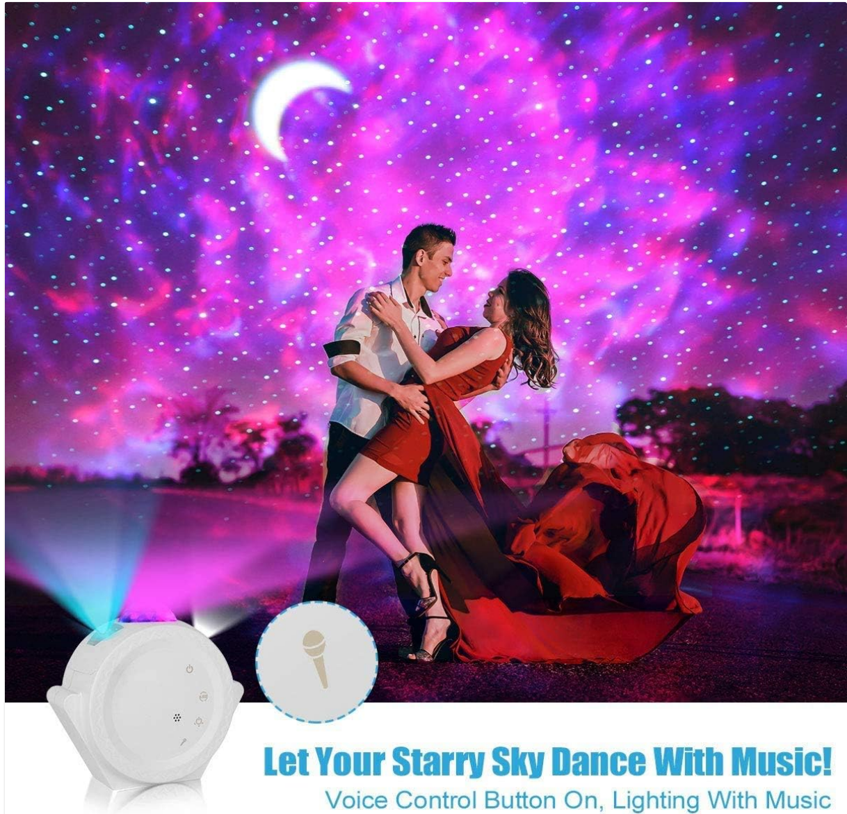
Image: A couple dancing in a room illuminated by the projector's lights, with a microphone icon indicating the voice control feature.

Activate the voice control function to make the light projections react to sound. When this mode is on, the light will initially turn off and then flicker in sync with rhythmic sounds such as music or clapping. Ensure the sound source is not too far from the projector for optimal response.