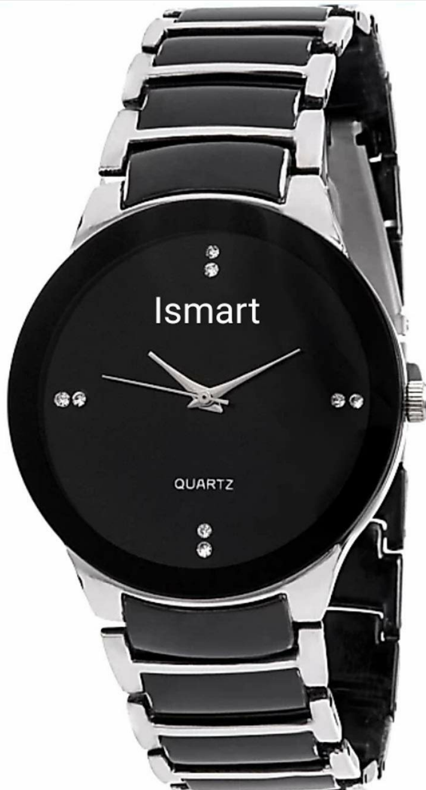
Image 1.1: Front view of the Ismart Black Dial Stainless Steel Strap Watch. The watch features a black dial with silver hands and hour markers, encased in a silver-tone stainless steel case, and paired with a matching stainless steel strap.