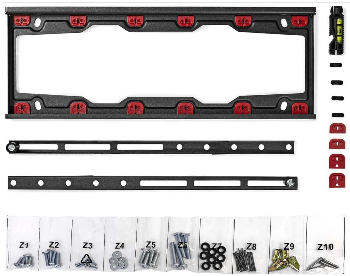
Image: All components of the NEDIS Fixed TV Wall Mount, including the main wall plate, two vertical TV brackets, a small spirit level, and bags of screws, washers, and drywall anchors.