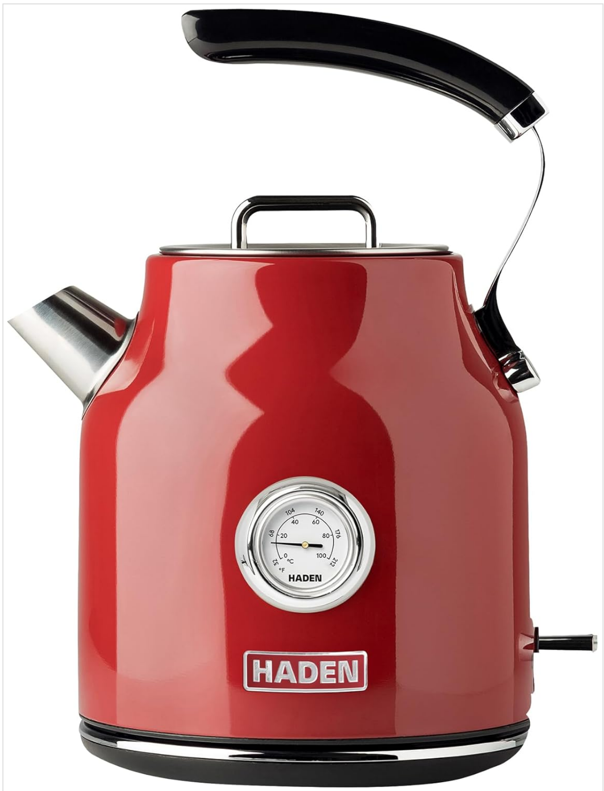
Figure 1: HADEN Dorset Electric Kettle, Rectory Red

The HADEN Dorset Electric Kettle is designed for rapid water boiling, featuring a 1.7-liter capacity, 360-degree base, and automatic safety shut-off functions. Its durable stainless steel construction ensures longevity and reliable performance.