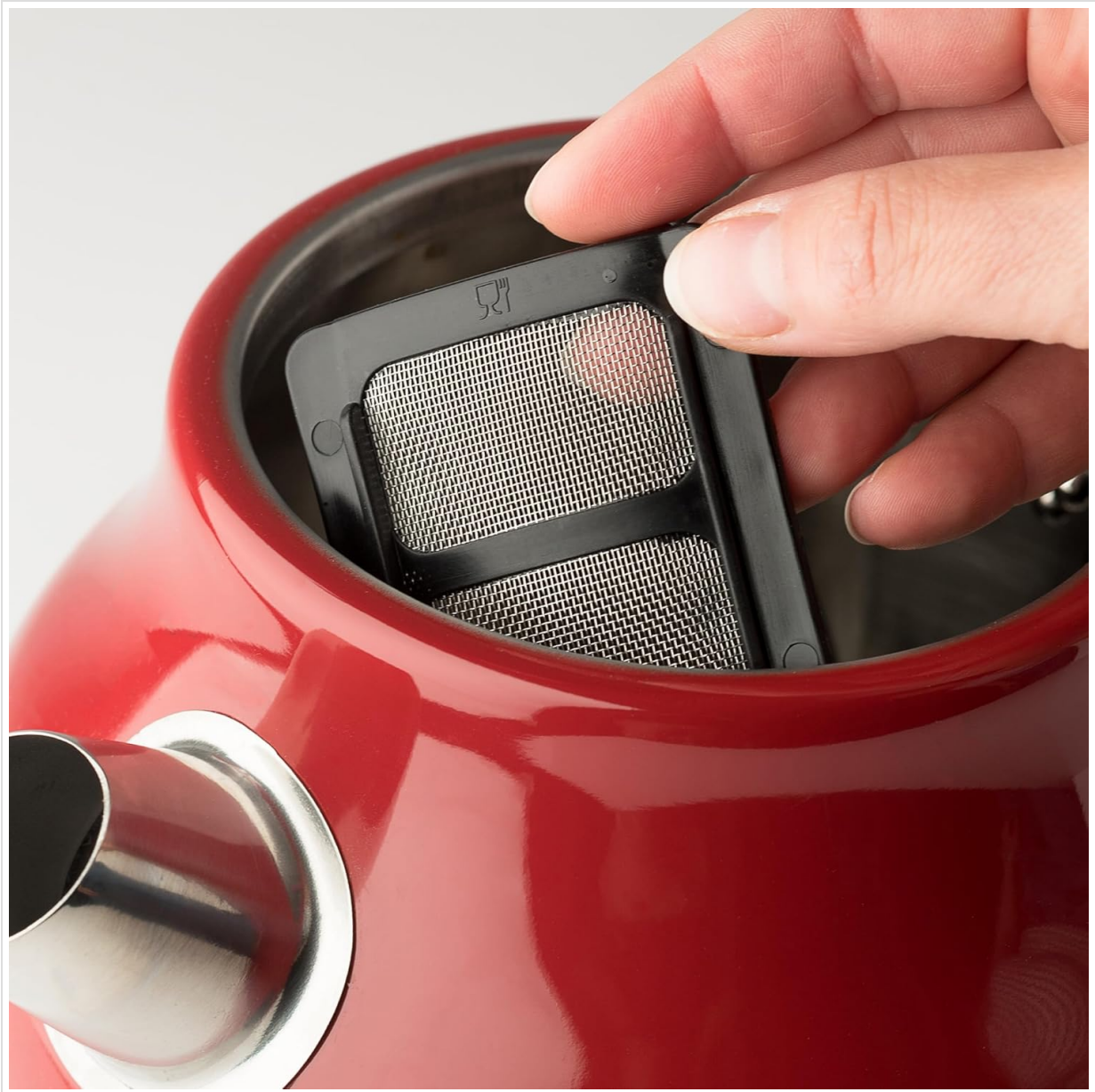
Figure 4: Removing the removable filter for cleaning