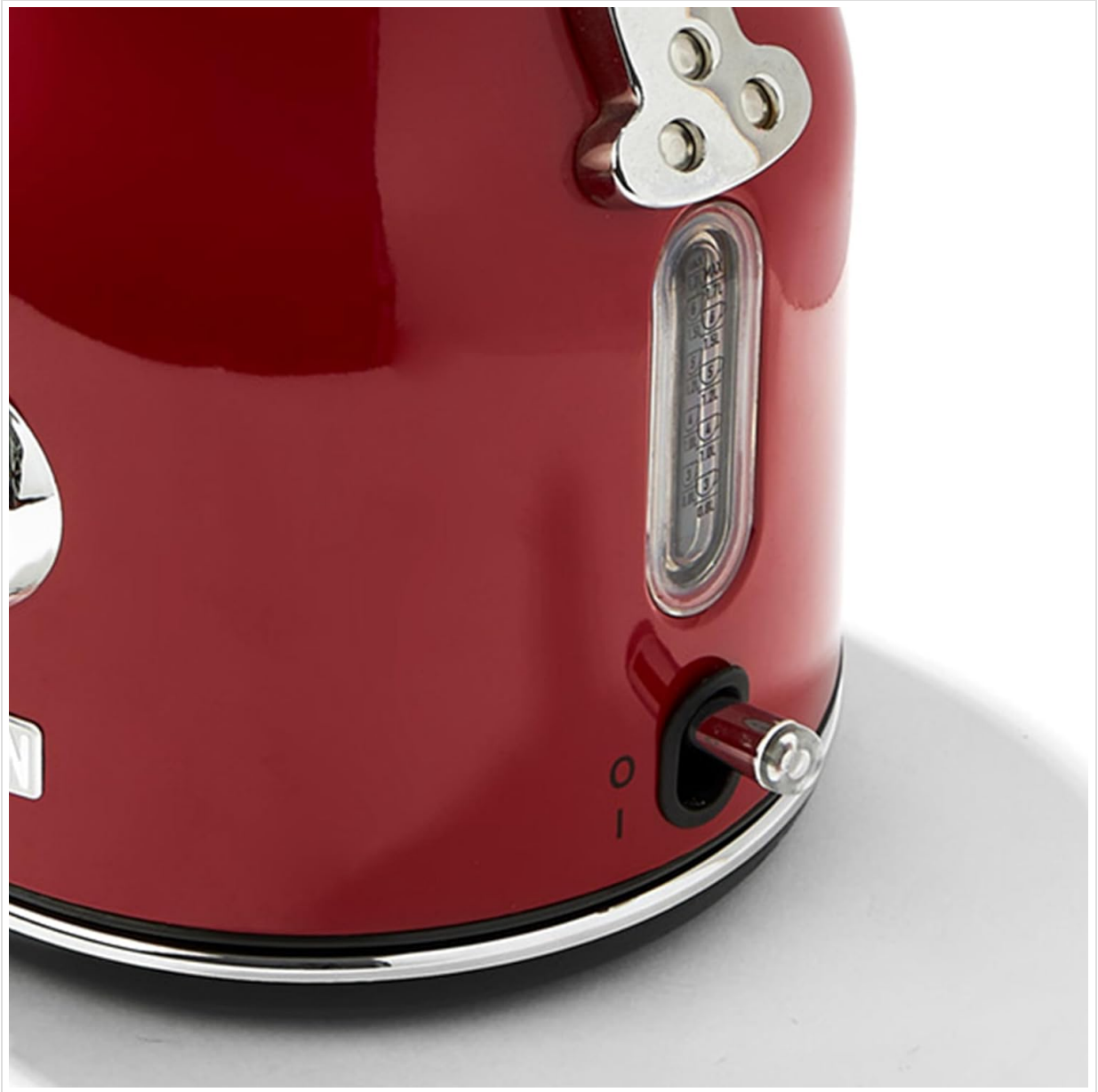
Figure 3: On/Off switch and water level indicator

Your browser does not support the video tag.