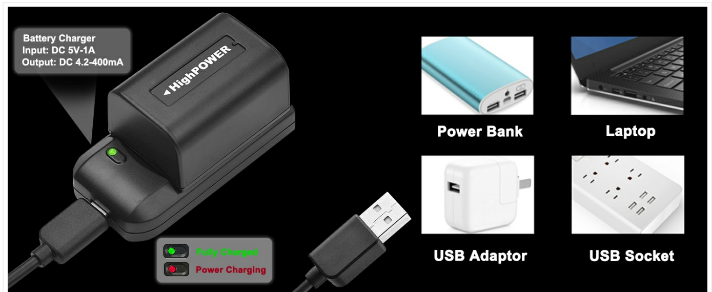
Image: Examples of compatible USB power sources including power banks, laptops, USB adapters, and USB wall sockets.

Image: The charger displaying its red (charging) and green (fully charged) indicator lights.