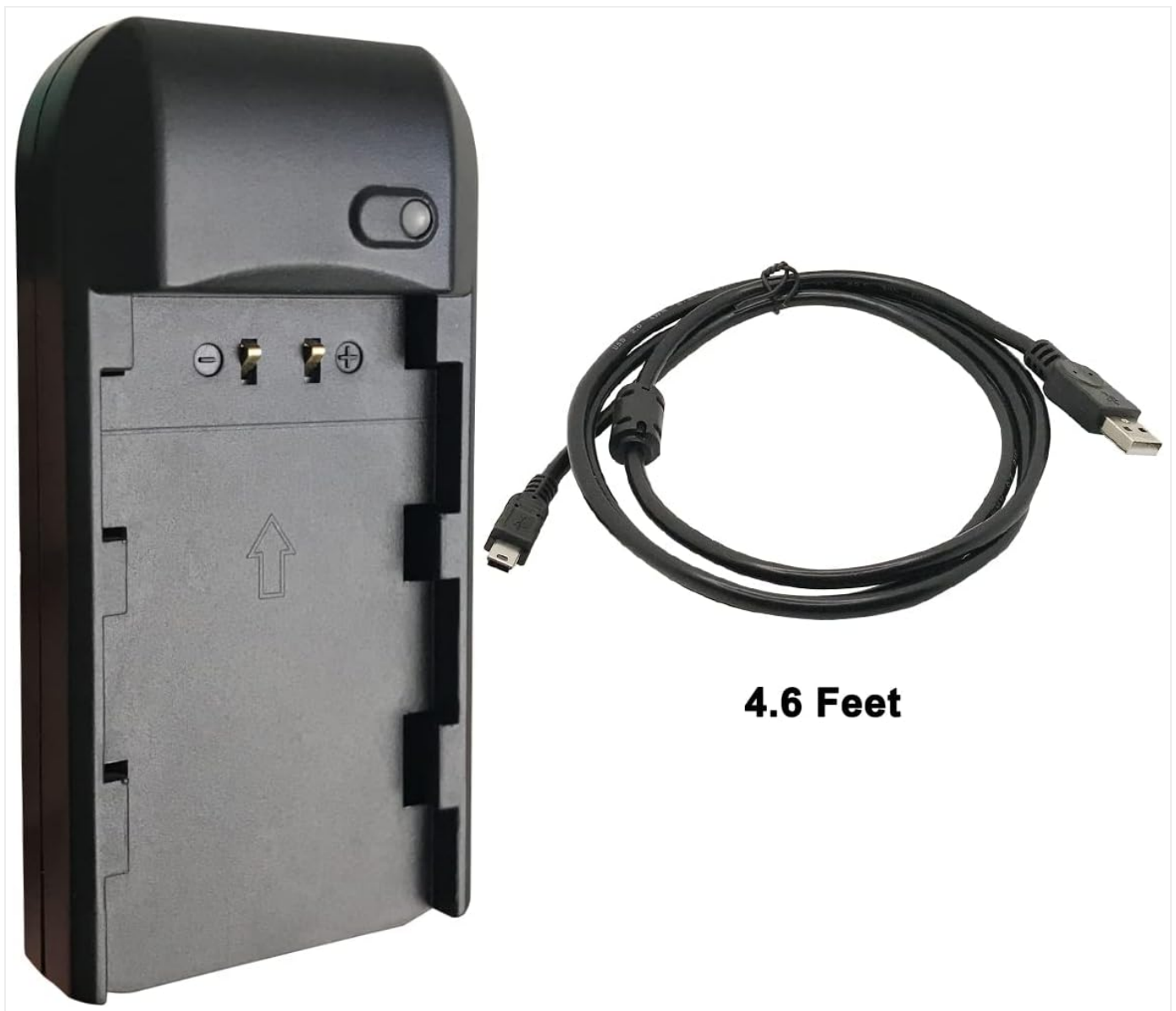
Image: The battery charger and the included USB cable.