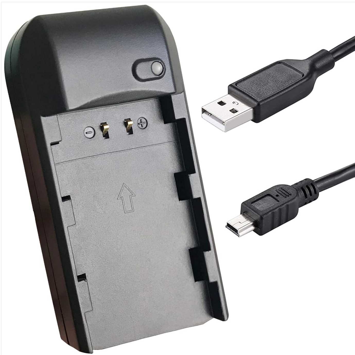
Image: The CofunKool NP-FV5 Battery Charger shown with its accompanying USB cable.