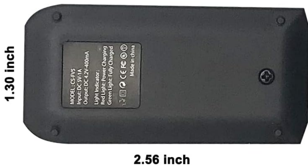
Image: Diagram showing the dimensions of the battery charger.