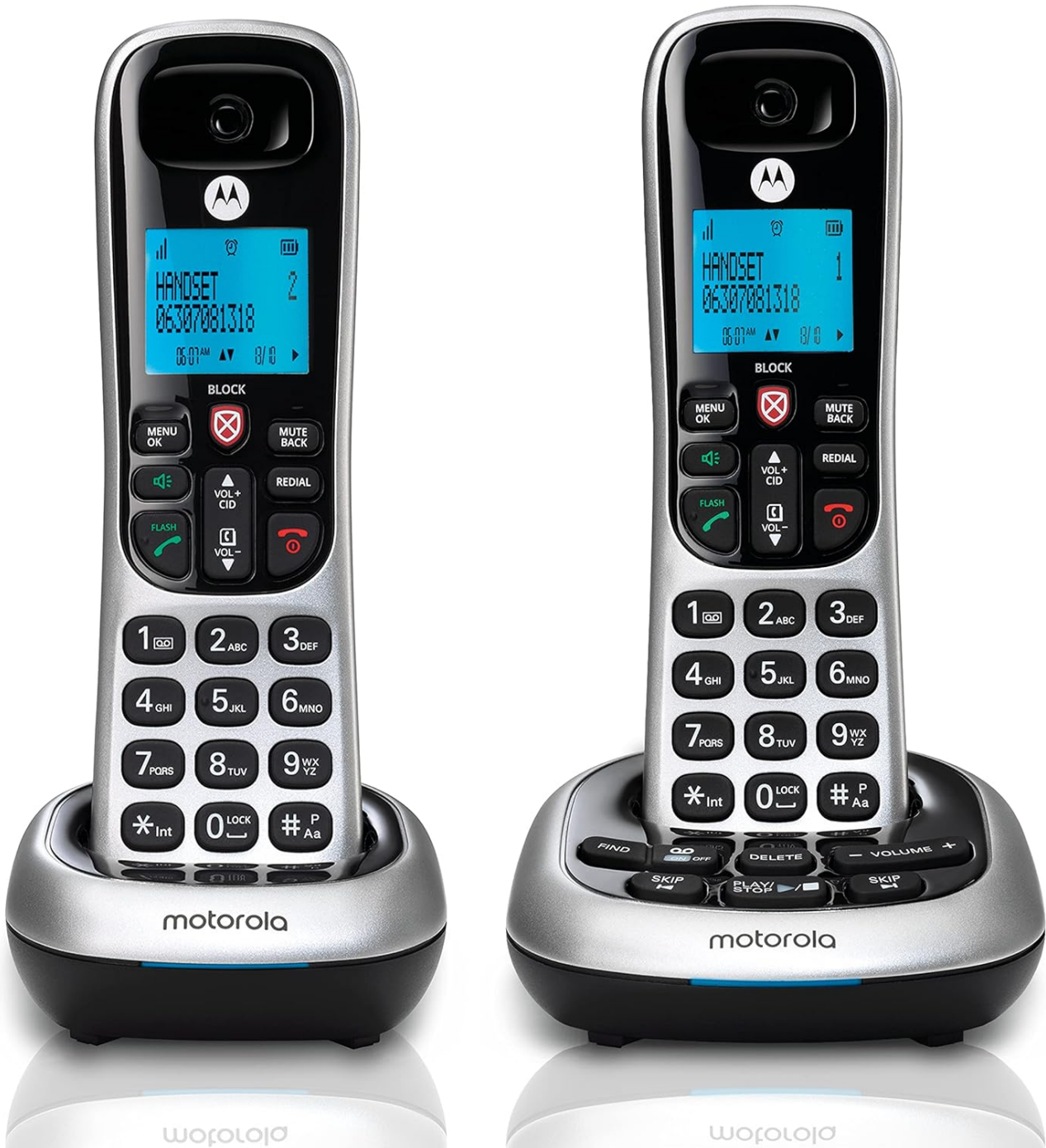
The Motorola CD4012 digital cordless telephone system, featuring two handsets for extended coverage.