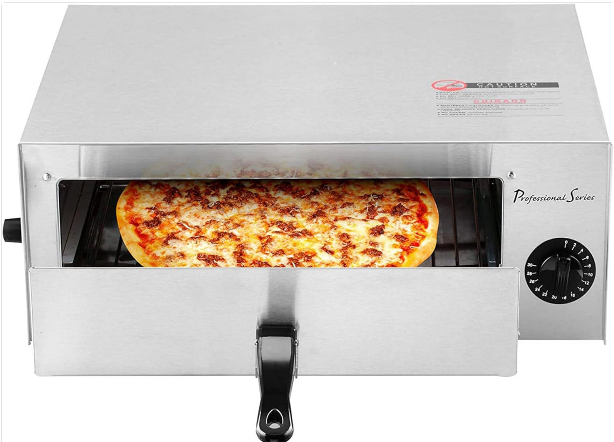
A perfectly baked pizza visible through the oven's opening with the door closed.