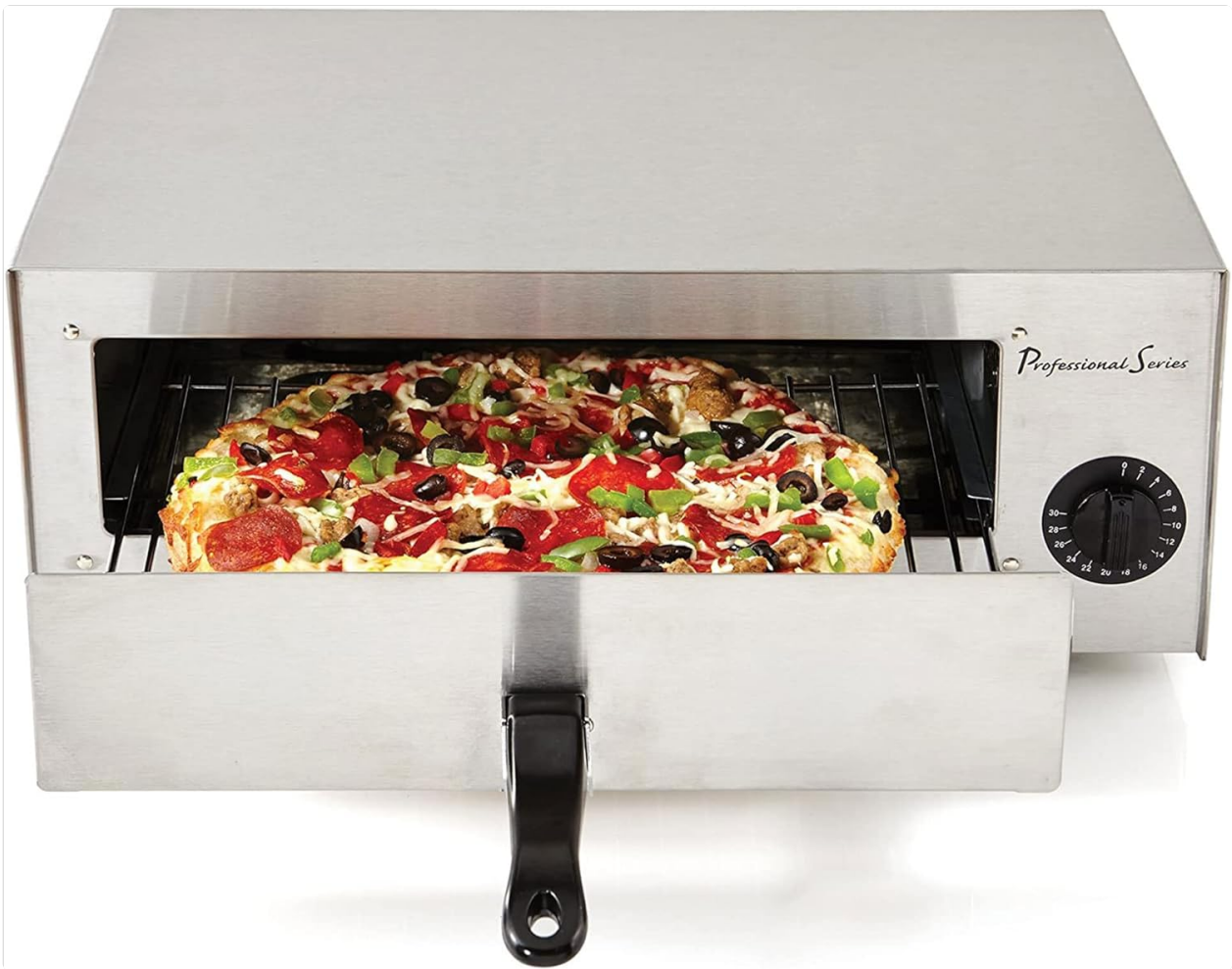
A pizza with various toppings being inserted into the oven on its pull-out rack.