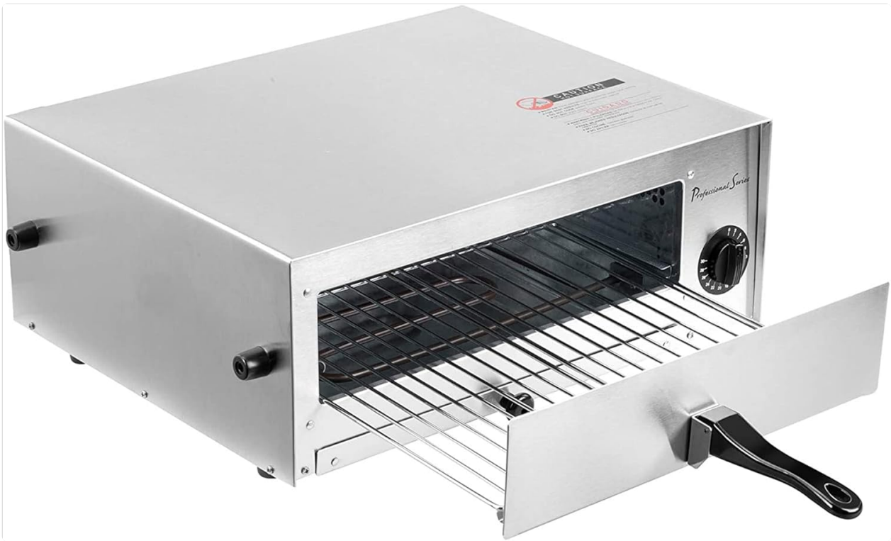
The Professional Series Pizza Oven, showcasing its stainless steel exterior and pull-out cooking tray.