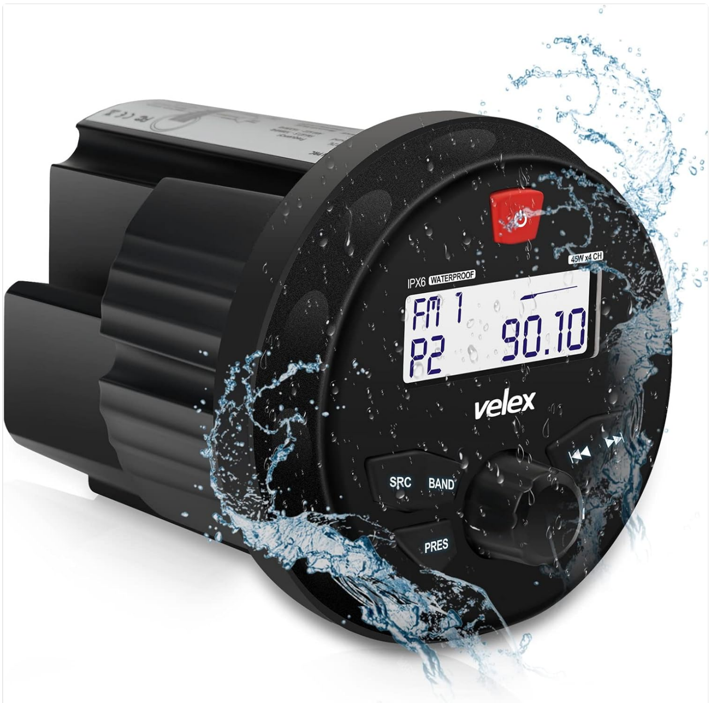
Figure 1: Velex Marine Stereo System (Model VX163)