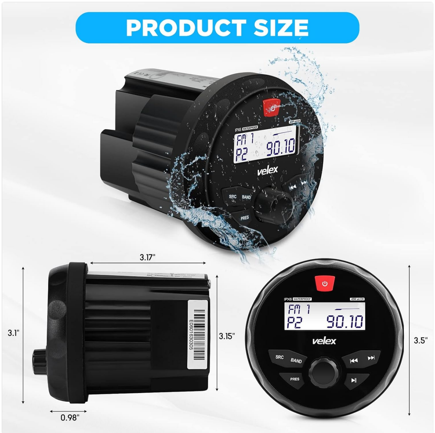
Figure 2: Product Dimensions for Installation (3.15" diameter)