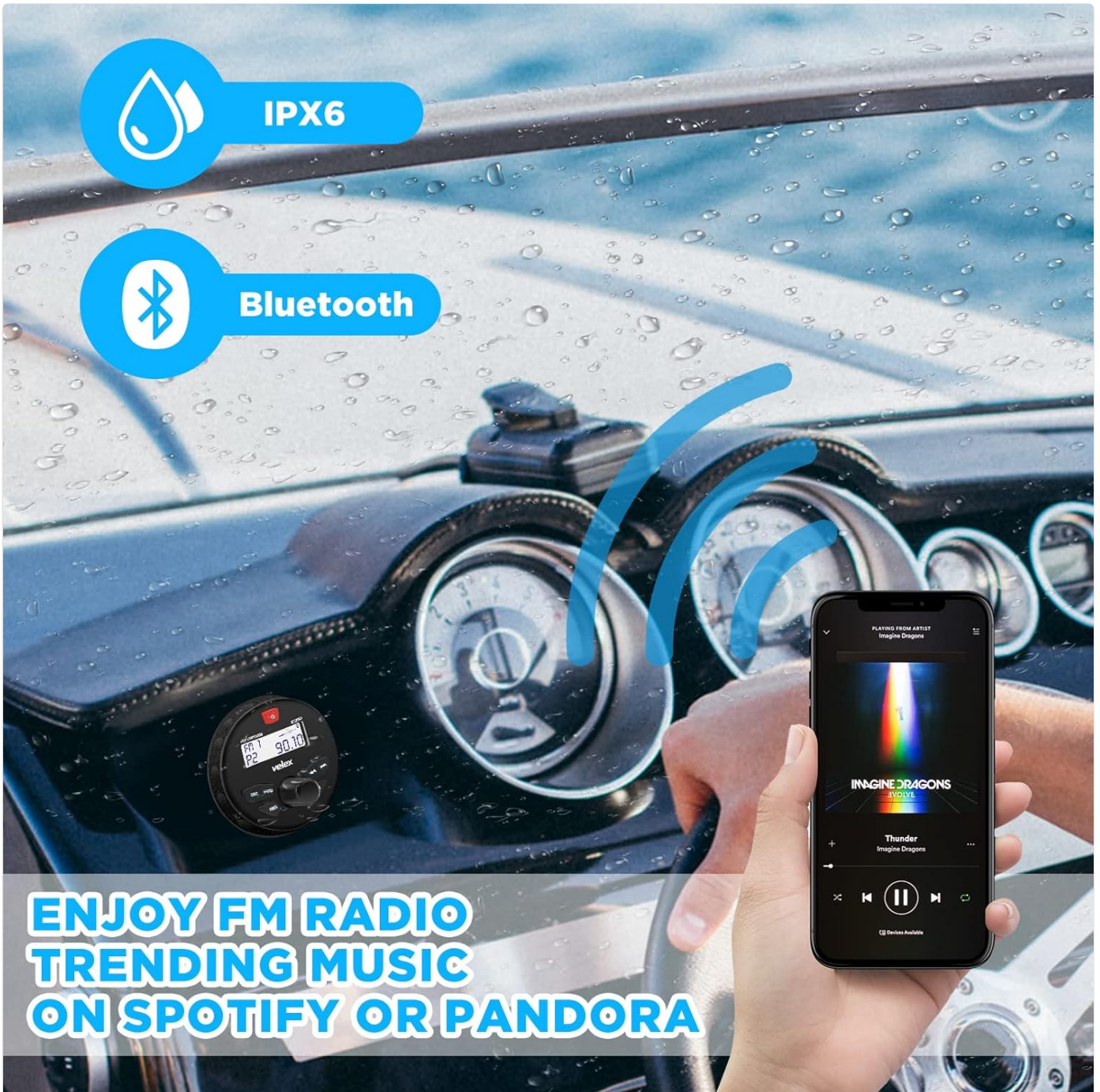
Figure 4: Bluetooth Connectivity and IPX6 Rating