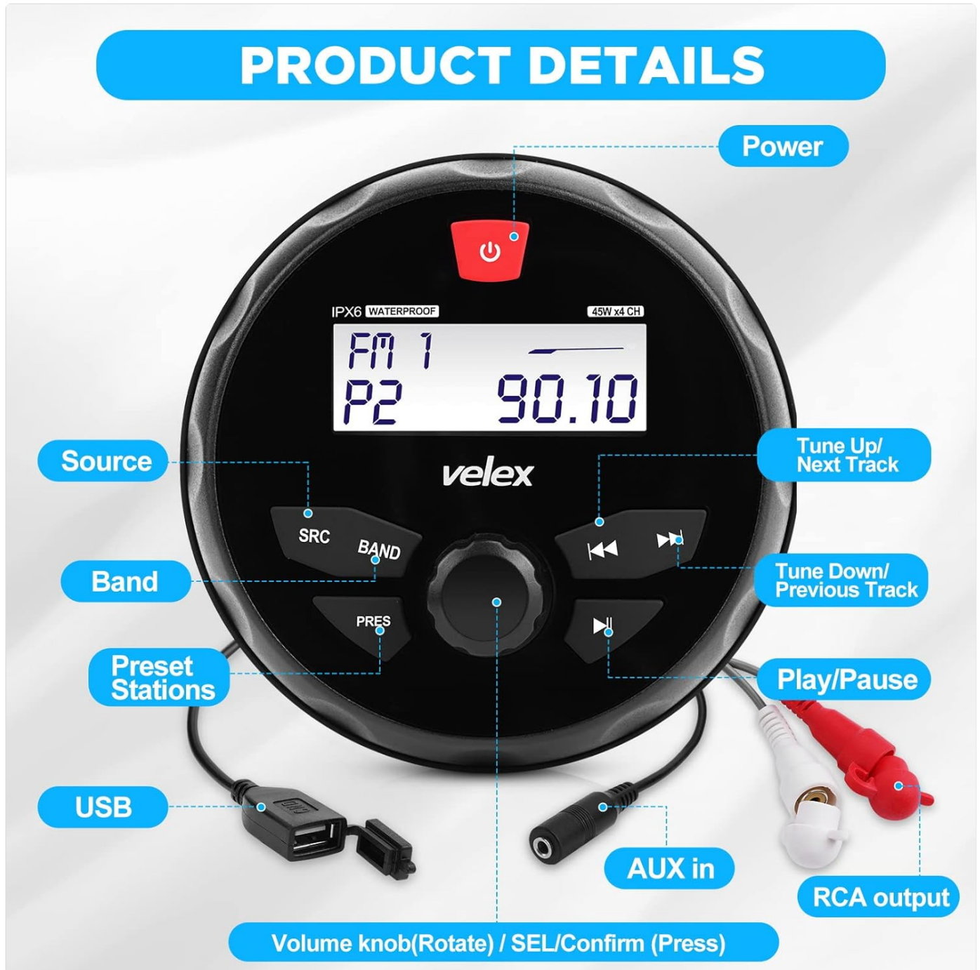
Figure 3: Front Panel Controls and Rear Connections

Familiarize yourself with the controls for optimal use of your marine stereo.