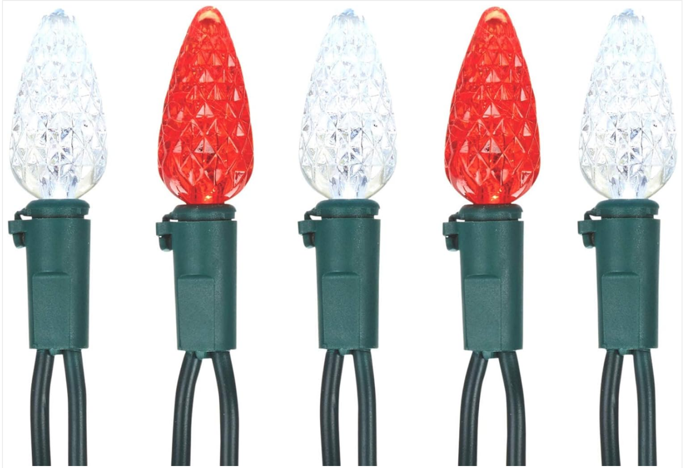
Image: Close-up of NOMA C6 LED bulbs. This detailed view highlights the diamond-cut faceted design of the red and pure white bulbs, which are easily replaceable.

If a bulb burns out, it can be replaced. Unplug the light string. Carefully twist the faulty bulb counter-clockwise to remove it from its socket. Insert a new spare bulb (provided) by twisting it clockwise until secure. Ensure the replacement bulb is of the same type and wattage.