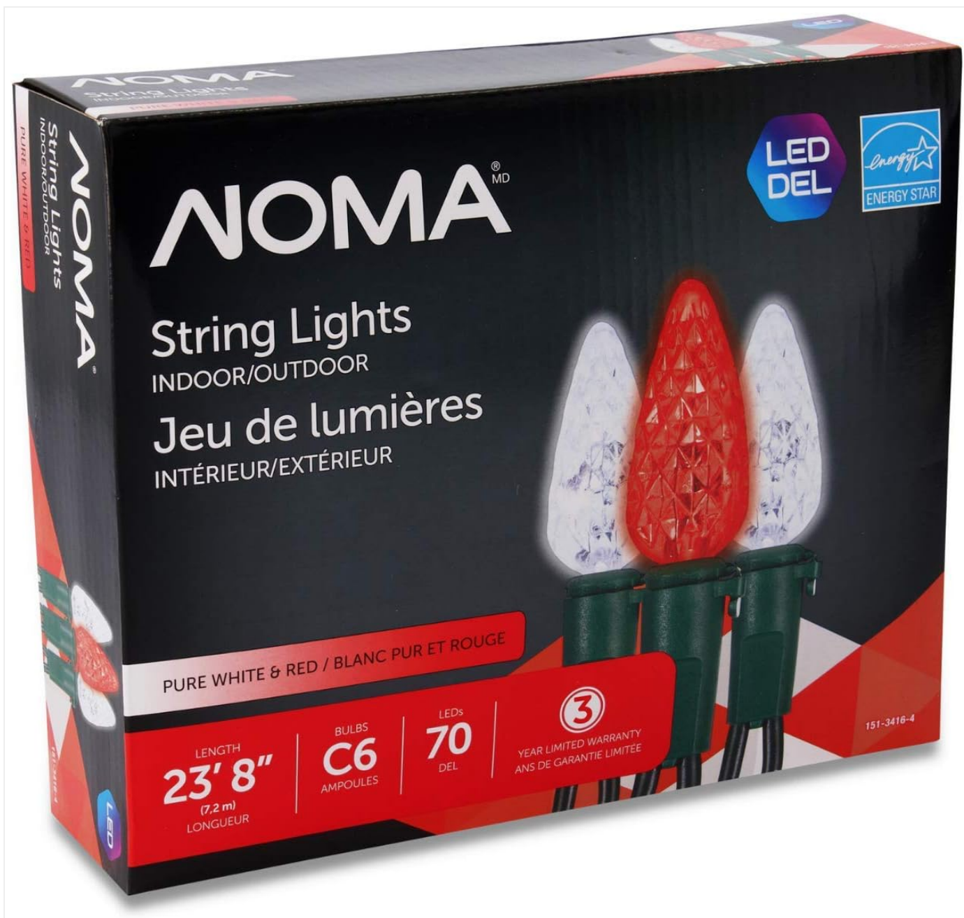
Image: NOMA C6 LED Christmas Lights packaging. The box displays key features such as 70 LED bulbs, 23.8 ft length, and a 3-year limited warranty, indicating the product's specifications and reliability.