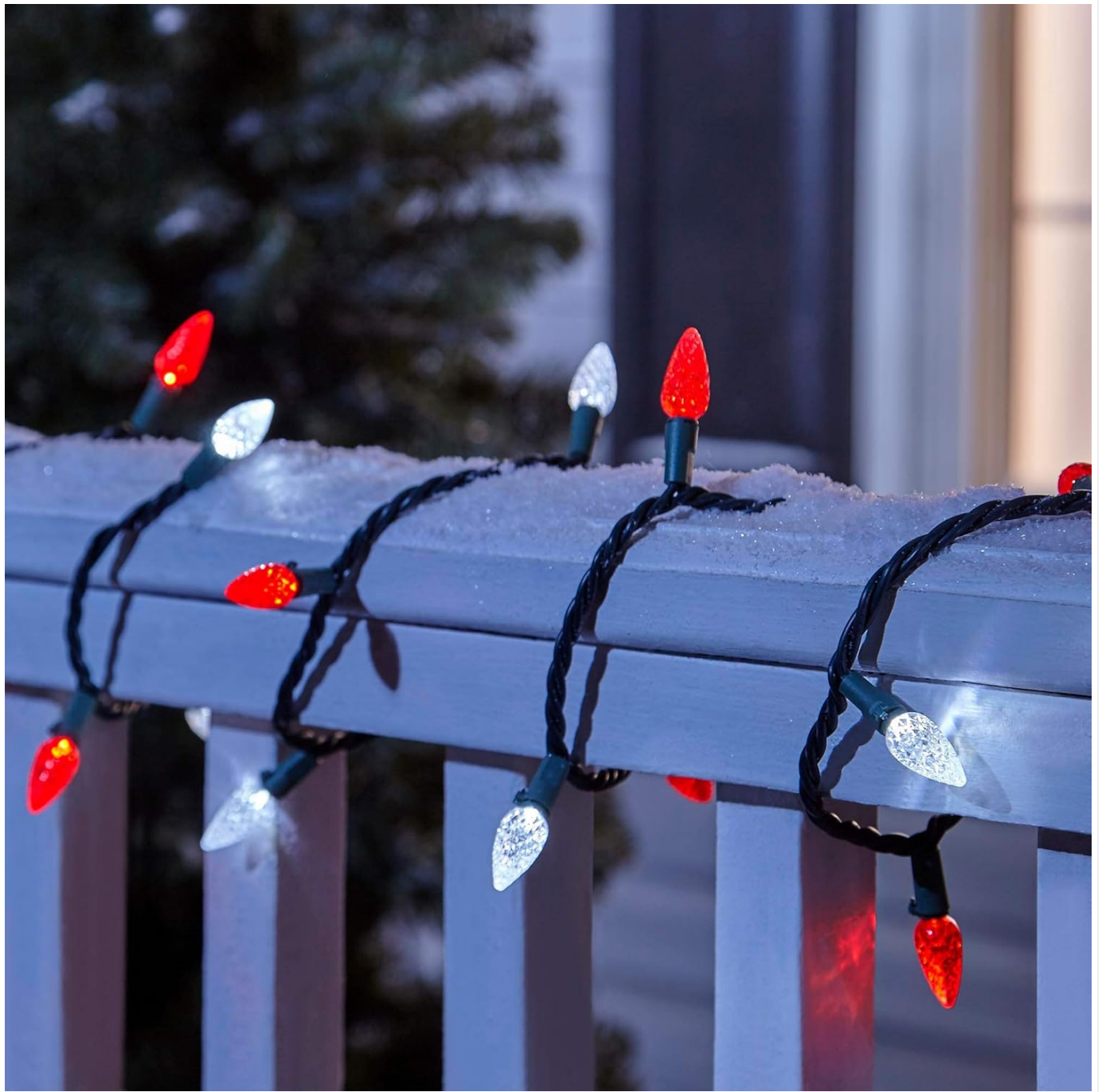
Image: NOMA C6 LED Christmas Lights installed on an outdoor railing. The red and pure white bulbs are visible, demonstrating their suitability for outdoor decoration.