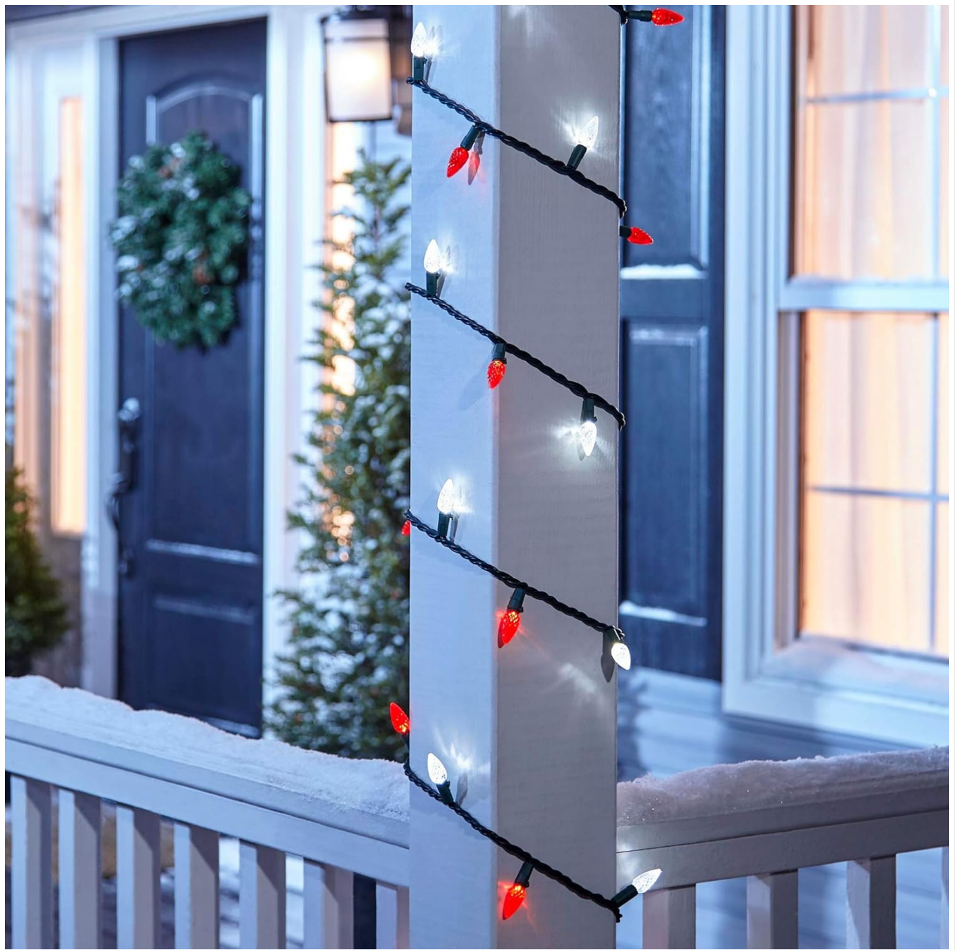
Image: NOMA C6 LED Christmas Lights wrapped around a porch pillar. This illustrates a common outdoor installation method, enhancing the festive appearance of a home's exterior.