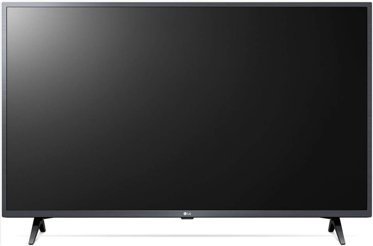
Figure 2.1: Front view of the TV with the stand attached.