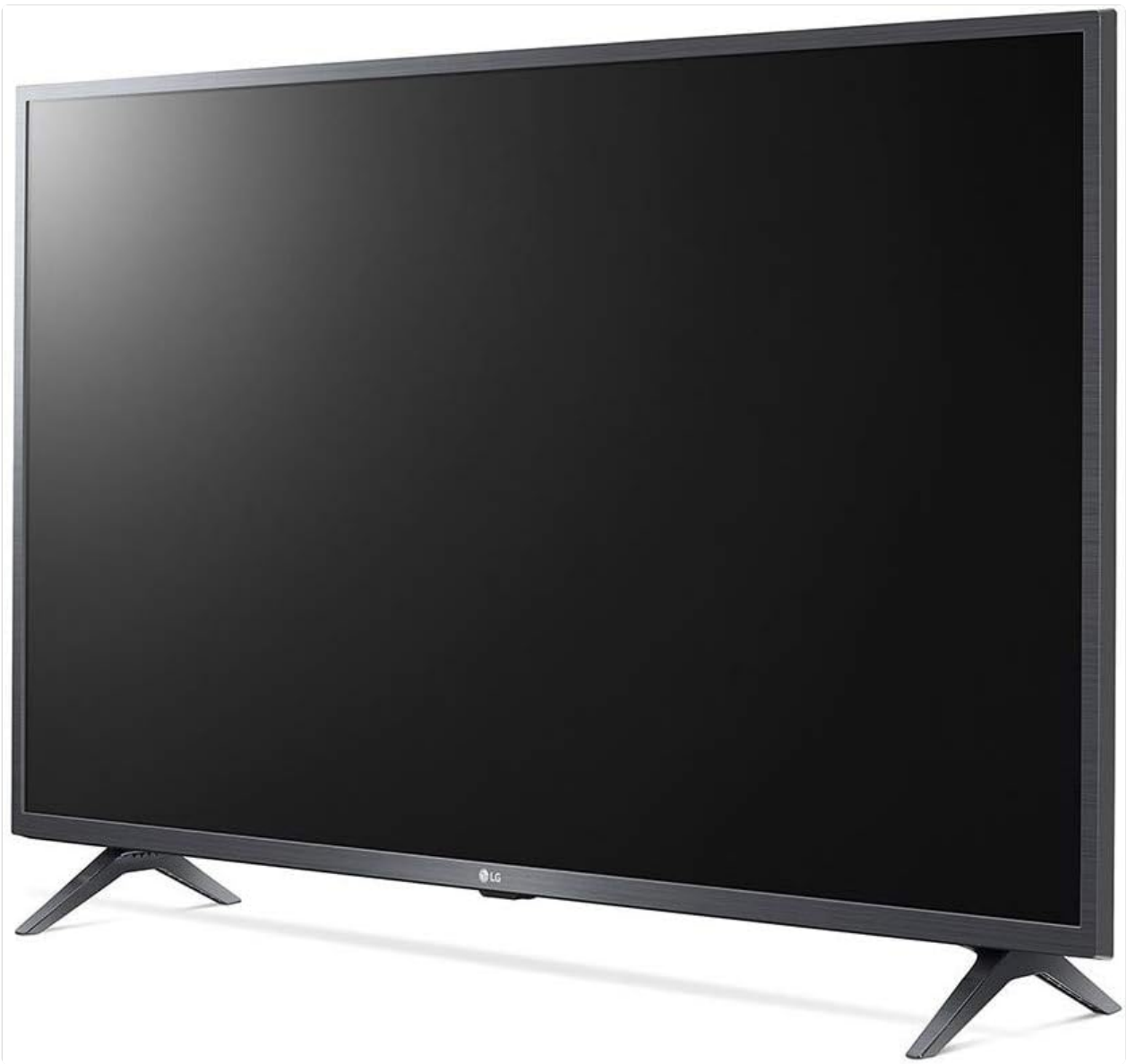
Figure 1.1: Front view of the LG 43LM6300PSB Smart TV.