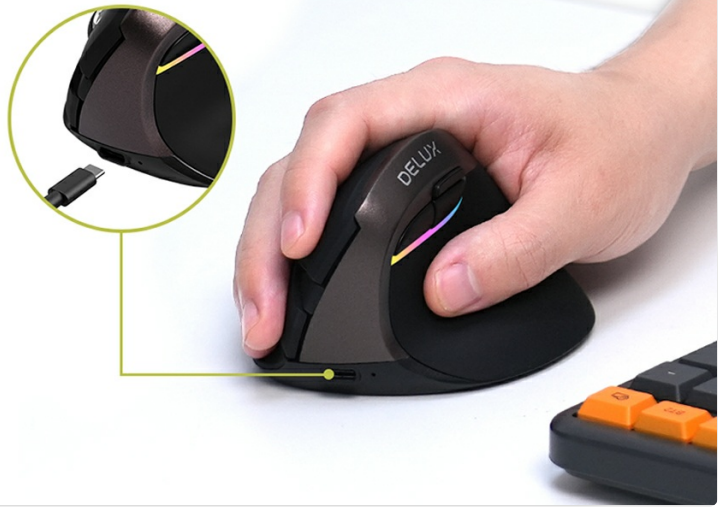
Image: 1000mAh rechargeable battery and USB-C charging.