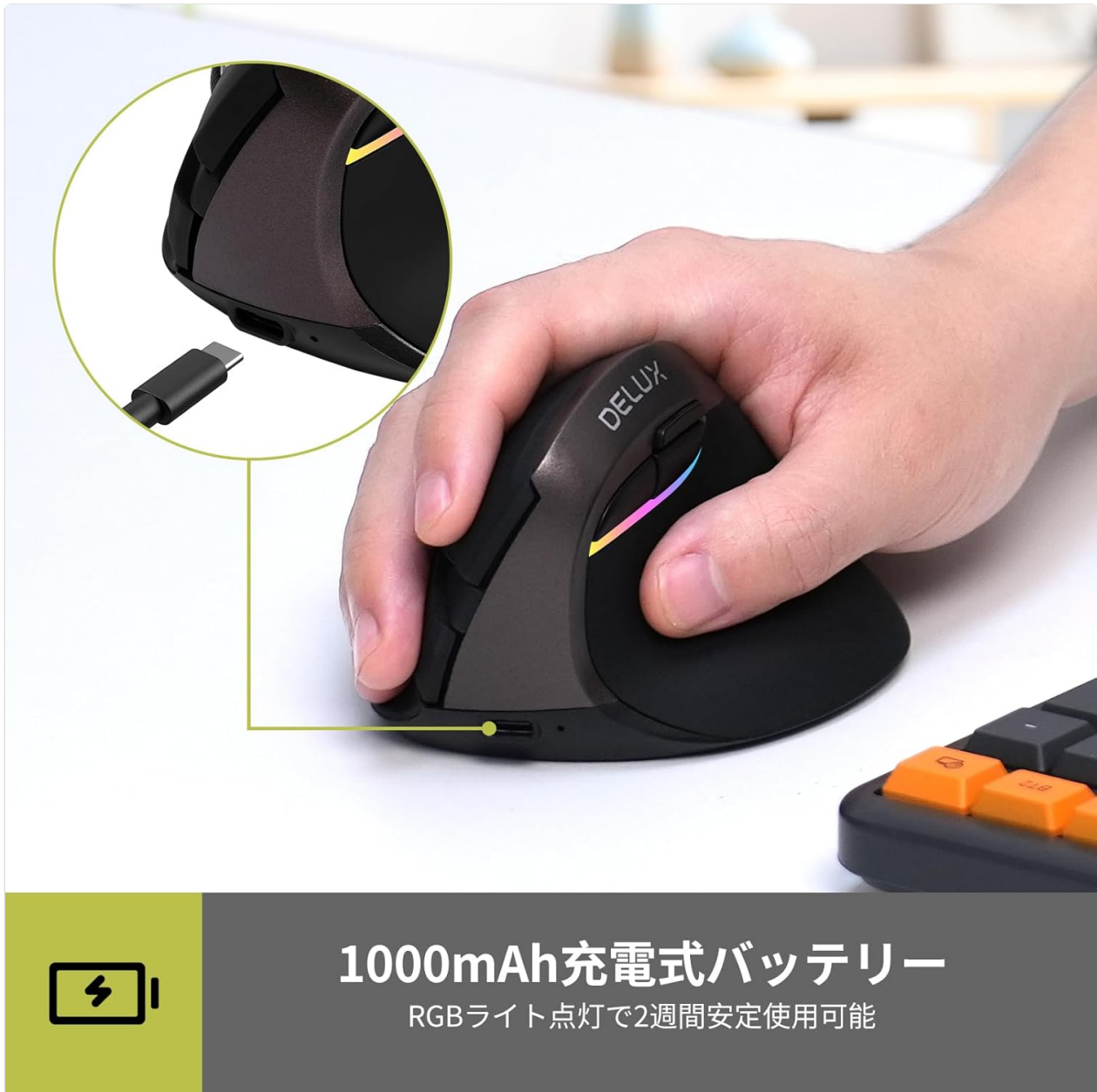
Image: USB-C charging port.