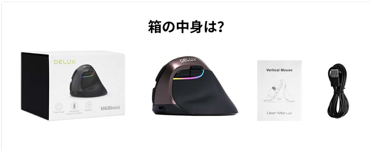
Image: Contents of the DELUX M618MINI retail box.