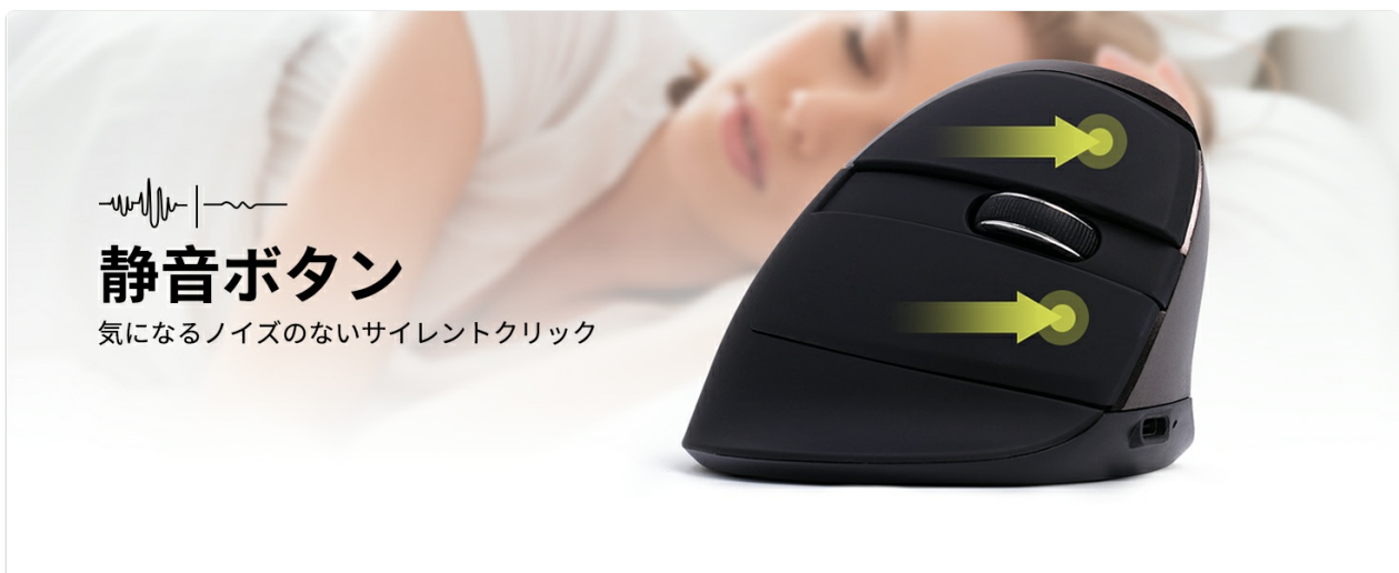
Image: Silent buttons for quiet operation.