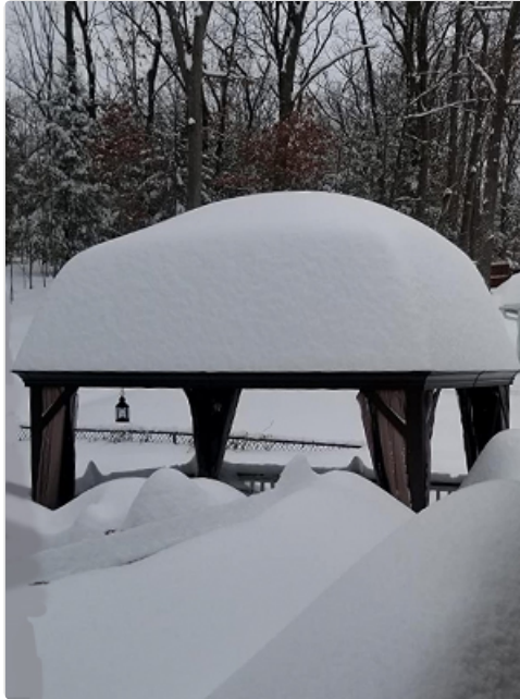
The gazebo's hardtop roof is designed to withstand significant snow loads, as shown in this winter scene.