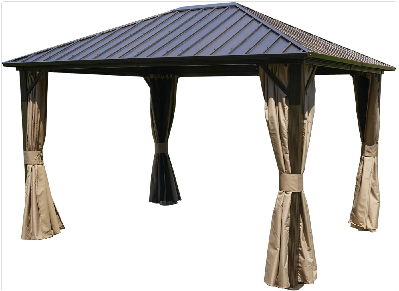
The gazebo with privacy curtains tied back, allowing for an open-air experience.