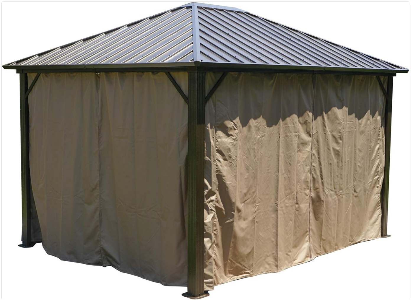
The gazebo with privacy curtains fully closed, offering seclusion and protection from elements.