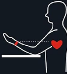
Correct posture for measuring blood pressure in