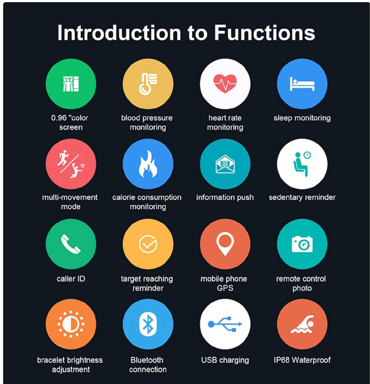
Image: An infographic displaying the various functions of the HAMMER ID128 Smart Fitness Band, such as heart rate monitoring, sleep tracking, and notification alerts.

The ID128 features a 0.96-inch color screen and touch control for navigation.