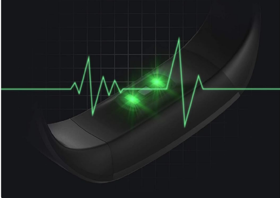
Image: The HAMMER ID128 Smart Fitness Band actively monitoring heart rate, with a visual representation of heart rate data.

You can set the monitoring manually or automatically as you wish. Automatic monitoring will monitor the change of your heart rate and the resting heart rate throughout the whole process of exercise and analyze your sports status. You can check the dynamic heart rate curve of the whole day on the APP so that to monitor your sport exercise in a more scientific way.