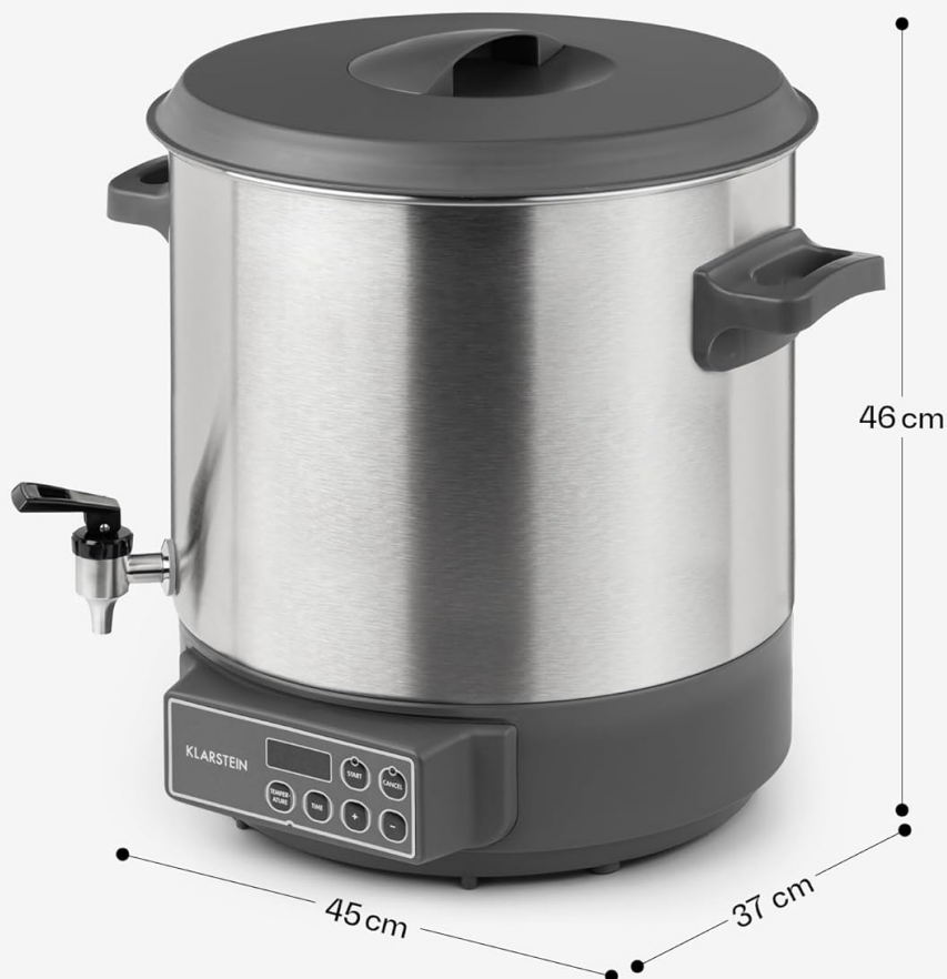
Image 5: Diagram illustrating the dimensions of the KLARSTEIN Lady Marmalade Pasteurizer, showing a height of 46 cm, width of 45 cm (likely including handles), and depth of 37 cm.