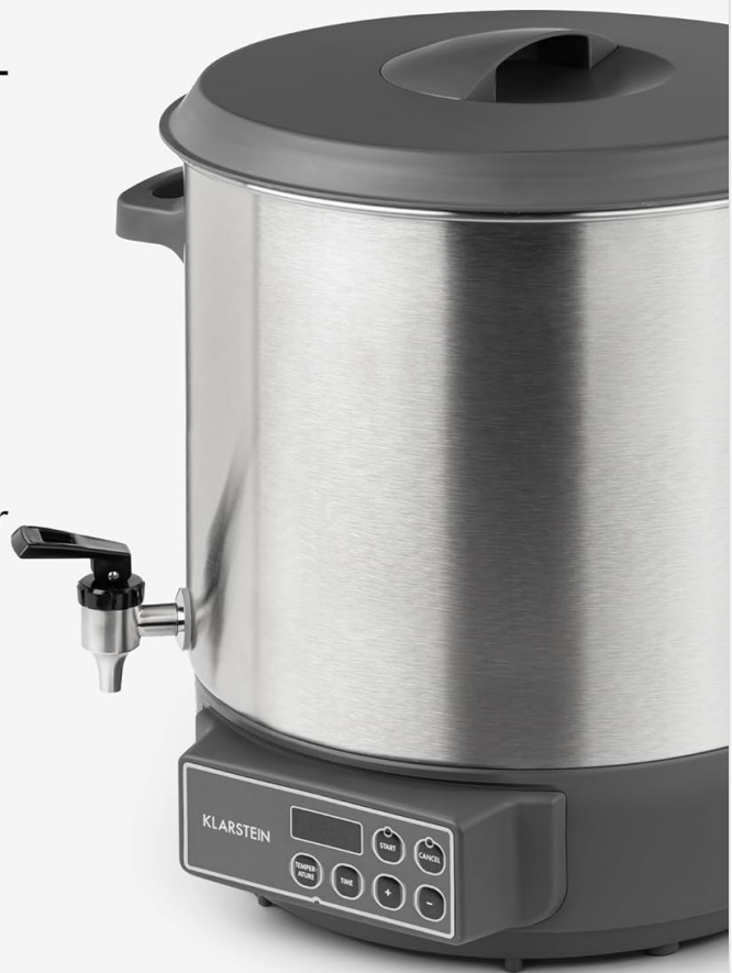
Image 1: Overview of the KLARSTEIN Lady Marmalade Pasteurizer, showing its stainless steel body, lid, and service tap. The handles and control knobs are made of heat-resistant material.