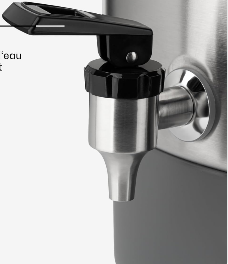
Image 4: Close-up of the hygienic stainless steel service tap with a Cool-Touch handle, designed for easy and splash-free dispensing of hot beverages.