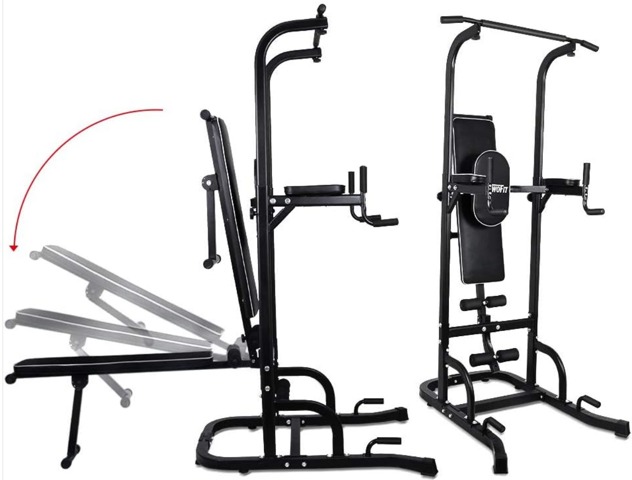
Image: The detachable and adjustable bench, illustrating its versatility and storage capability.

Detachable & Adjustable bench with 4 height options to accommodate different workout intensities and make it easy to store