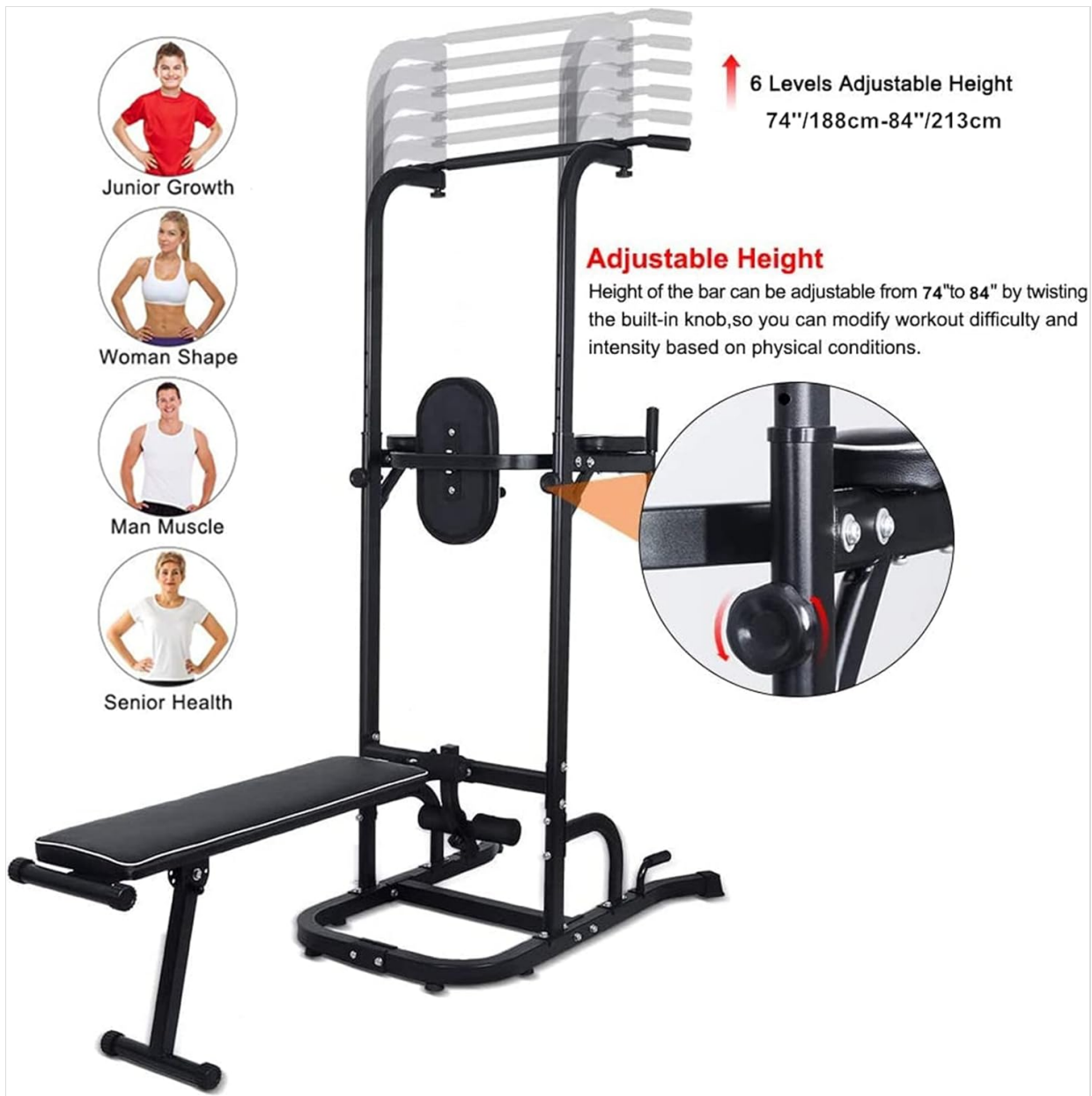
Image: Illustration of the adjustable height mechanism for the pull-up bar, showing the range and adjustment knob.