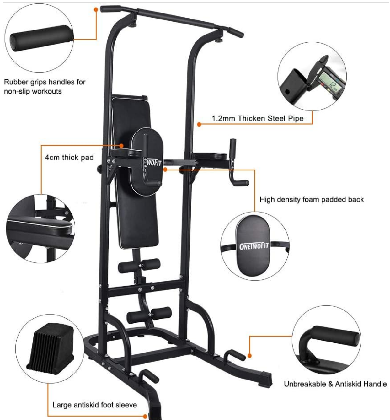
Image: Key components of the ONETWOFIT Power Tower, highlighting construction materials and design features.