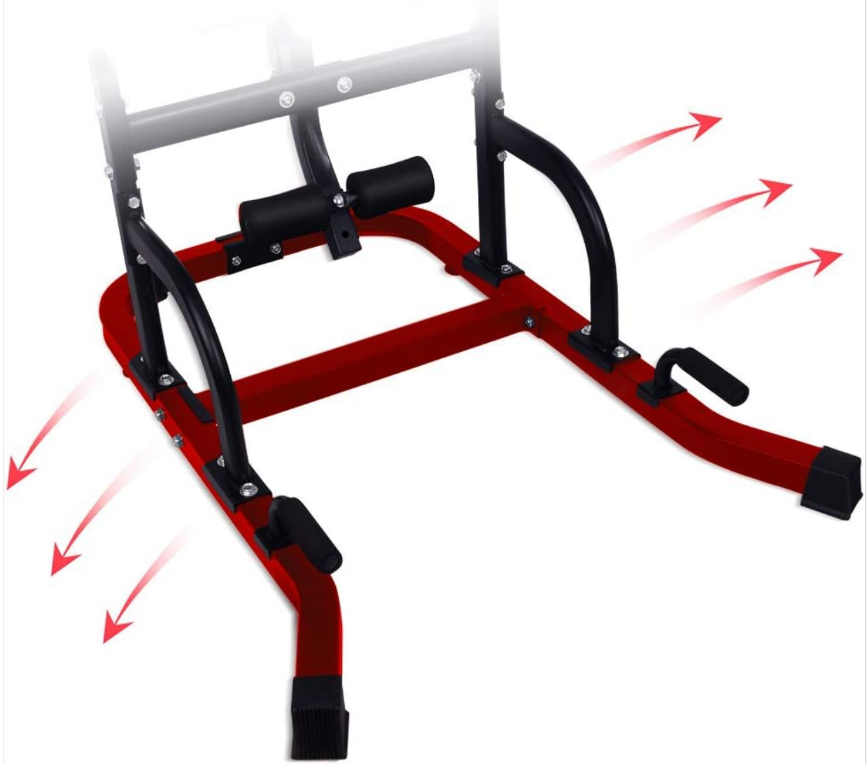
Image: The U-shaped anti-eversion frame base, designed for enhanced stability and safety.

Extra wide base with skid resistant feet, safe and stable