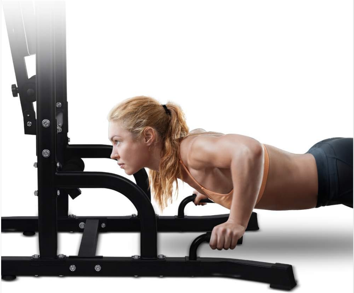
Image: The power tower's multi-height adjustment, accommodating various user heights and fitness levels.

Ergonomically designed handle, non-slip, more comfortable to use, avoiding incorrect posture results in hurting the wrist