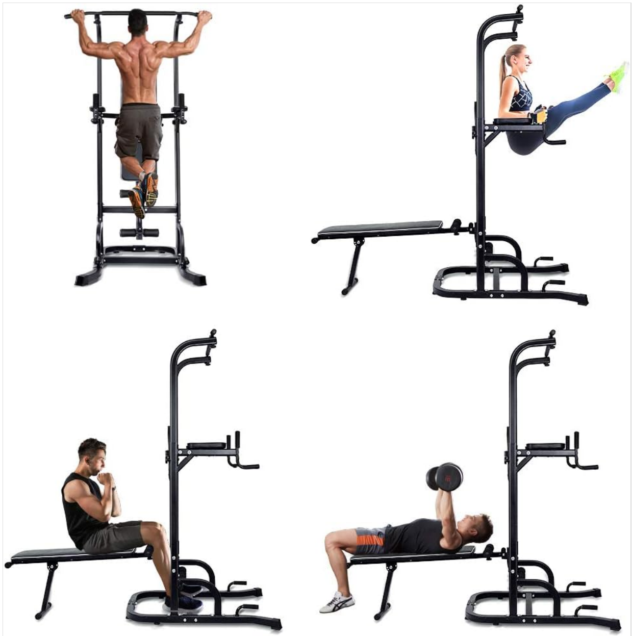
Image: Various exercises performed on the ONETWOFIT Power Tower, showcasing its multi-functional design.