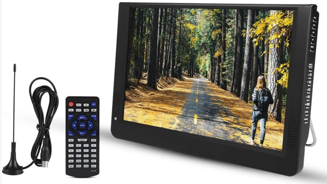
Image: The portable TV, remote control, and antenna, demonstrating the convenience of remote operation in different settings.