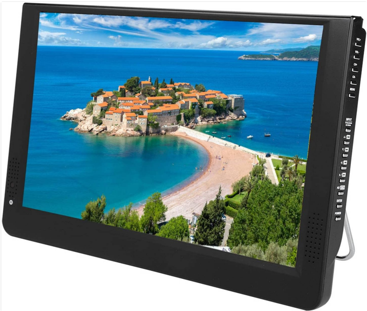
Image: The Wendry 12-inch Portable Digital TV showcasing its display with a scenic image.