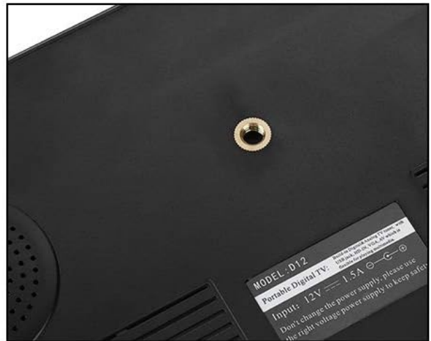
Image: The rear of the portable TV, showing the integrated foldable stand and product labeling including the model number D12.