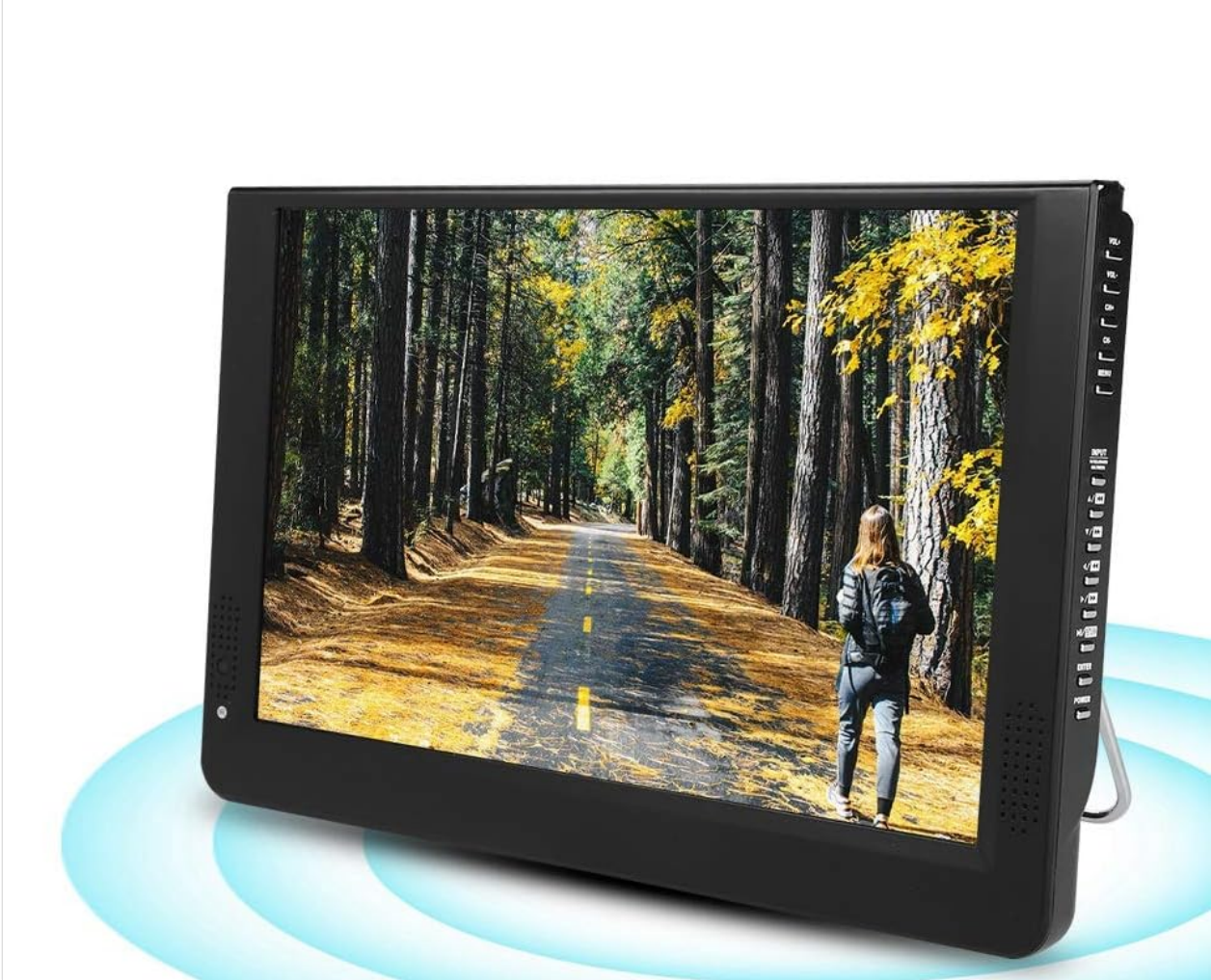
Image: The portable TV with an active display, illustrating its high-sensitivity tuner for stable signal reception.

A high sensitivity tuner strengthens signal receiving ability to make TV playing smoother and more stable.