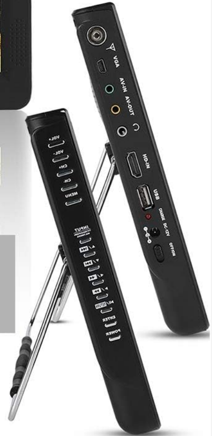
Image: A detailed view of the side panel of the portable TV, highlighting the multiple external source connection ports.

The car digital TV supports AV in/out, SD/MMC card, USB port, VGA, HDMI, headset plug.