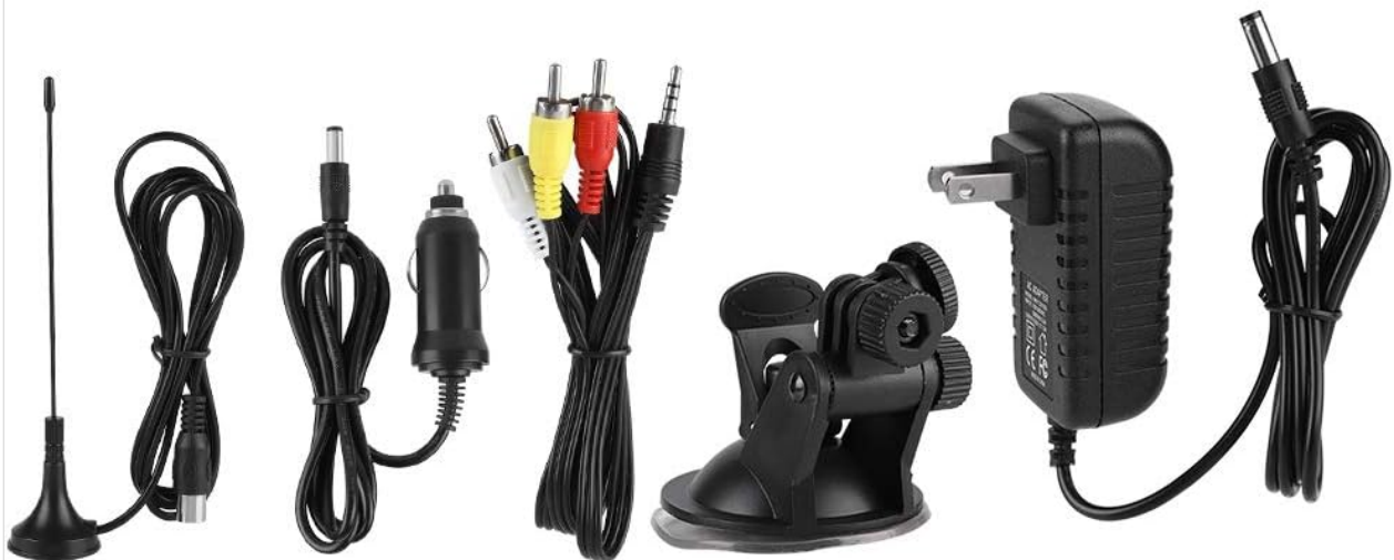
Image: All included accessories for the Wendry Portable Digital TV, including the TV unit, remote control, antenna, power adapters, and mounting accessories.