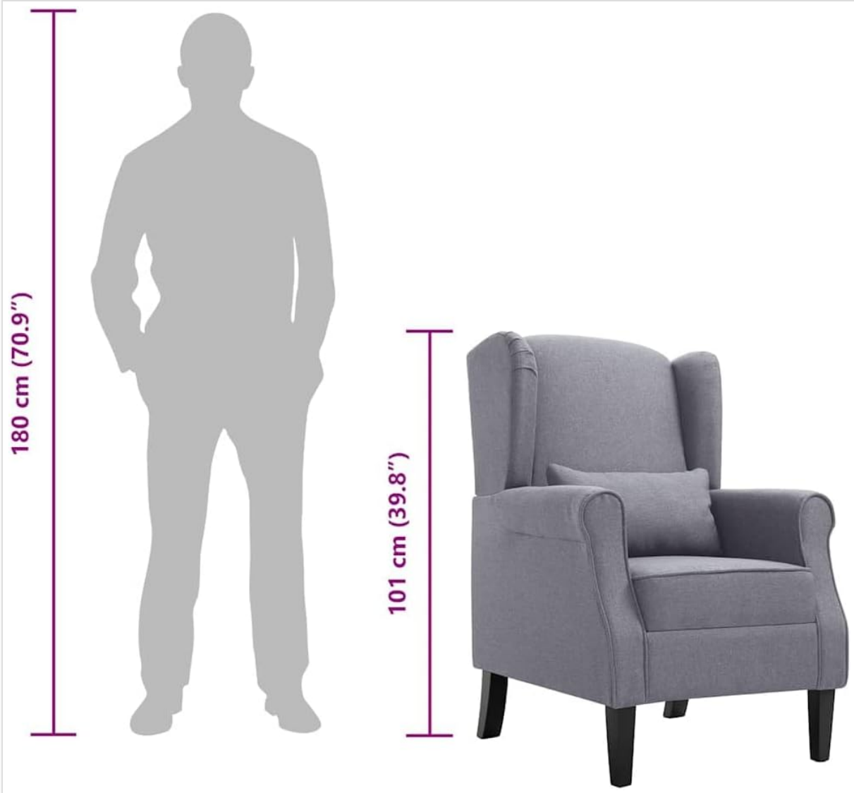
Figure 8.1: Scale comparison of the vidaXL Armchair with an average adult.