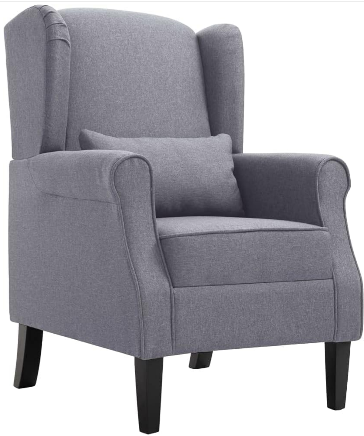
Figure 2.1: Front view of the vidaXL Armchair in Dark Grey Fabric.