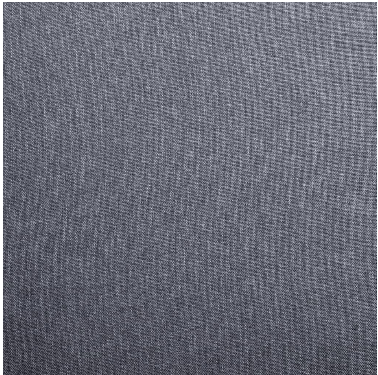
Figure 6.1: Close-up view of the dark grey fabric texture.