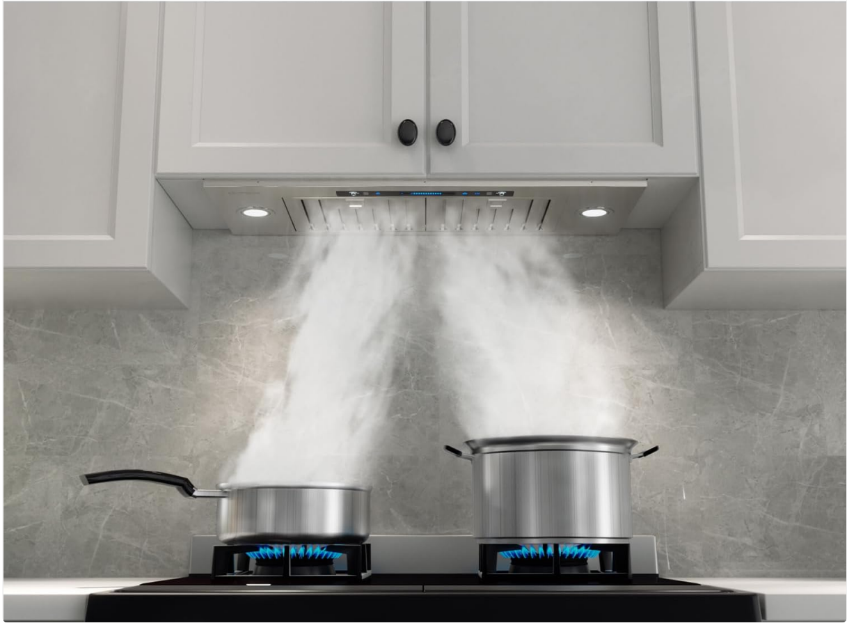
Figure 2: The range hood effectively extracts steam and smoke from cooking surfaces, showcasing its 900 CFM powerful suction.

4 levels of wind speed to meet your different cooking environments.