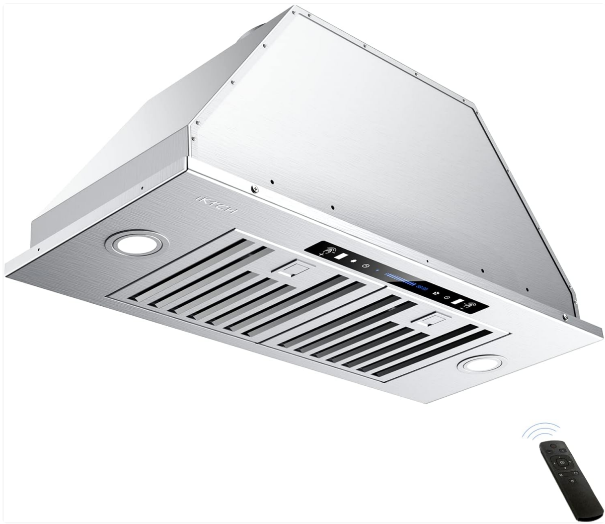
Figure 1: IKTCH 30-inch Built-in/Insert Range Hood with included remote control.