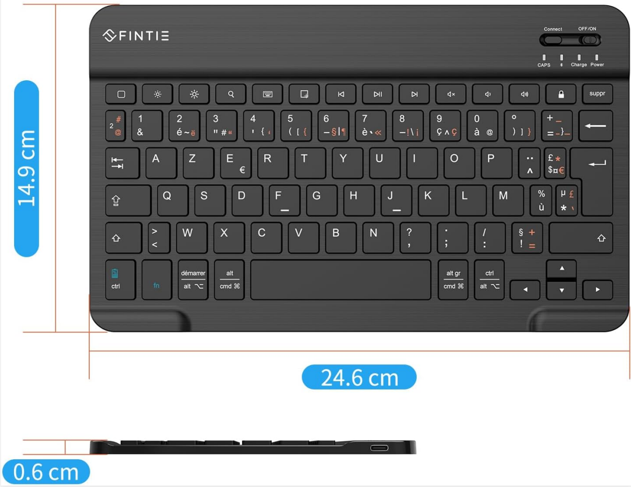
Image: Diagram illustrating the precise dimensions of the FINTIE Bluetooth keyboard.