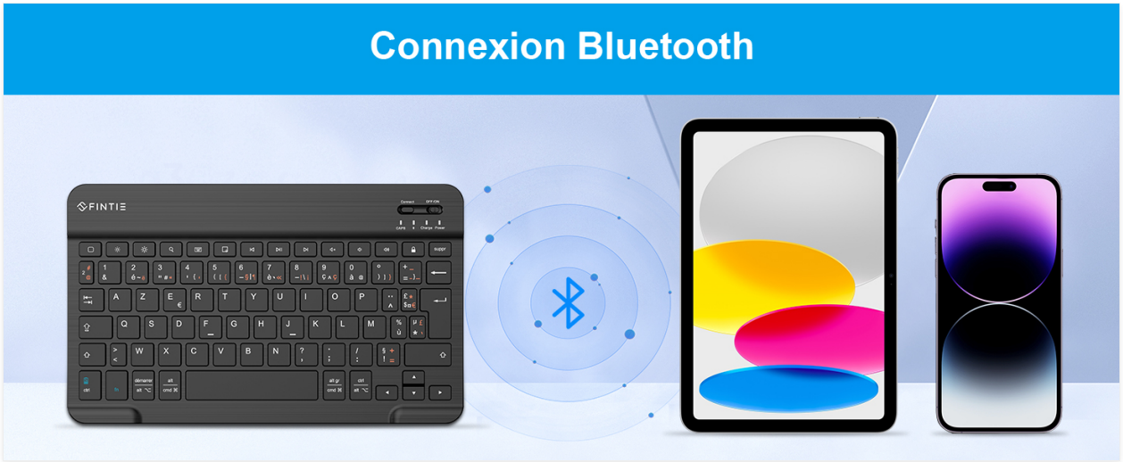
Image: Diagram illustrating the Bluetooth connection process between the FINTIE keyboard and a tablet and smartphone.