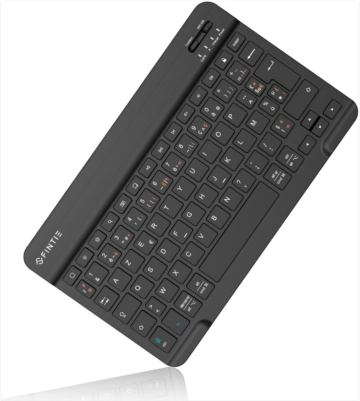
Image: The FINTIE 10-inch Bluetooth Wireless AZERTY Keyboard, showcasing its compact and sleek design.