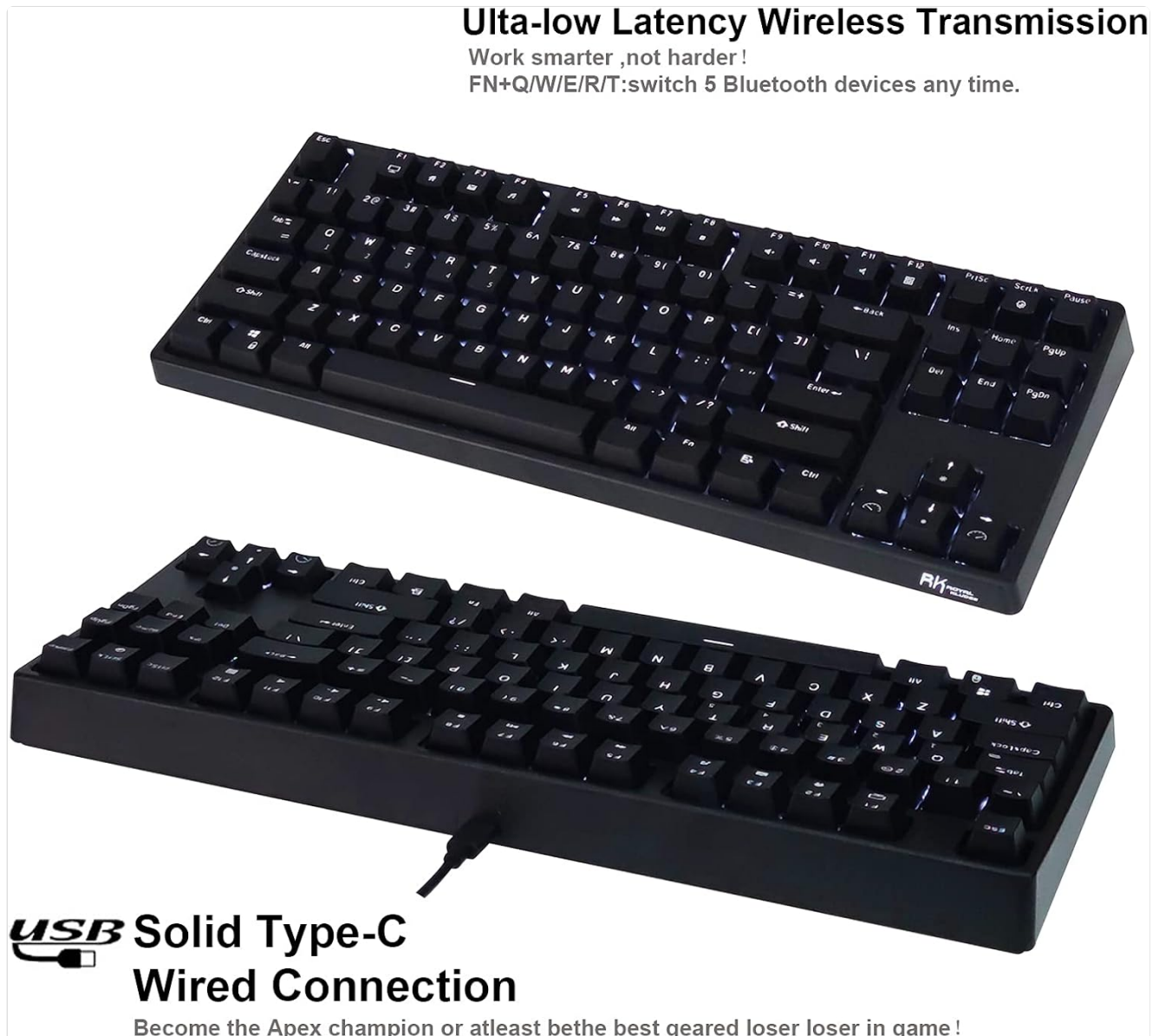
Figure 5.1: The keyboard supports both wired USB Type-C and wireless Bluetooth connections.

To use the keyboard in wired mode, connect the provided USB-C cable to the keyboard's USB-C port and the other end to an available USB port on your computer. The keyboard will automatically switch to wired mode and begin charging.