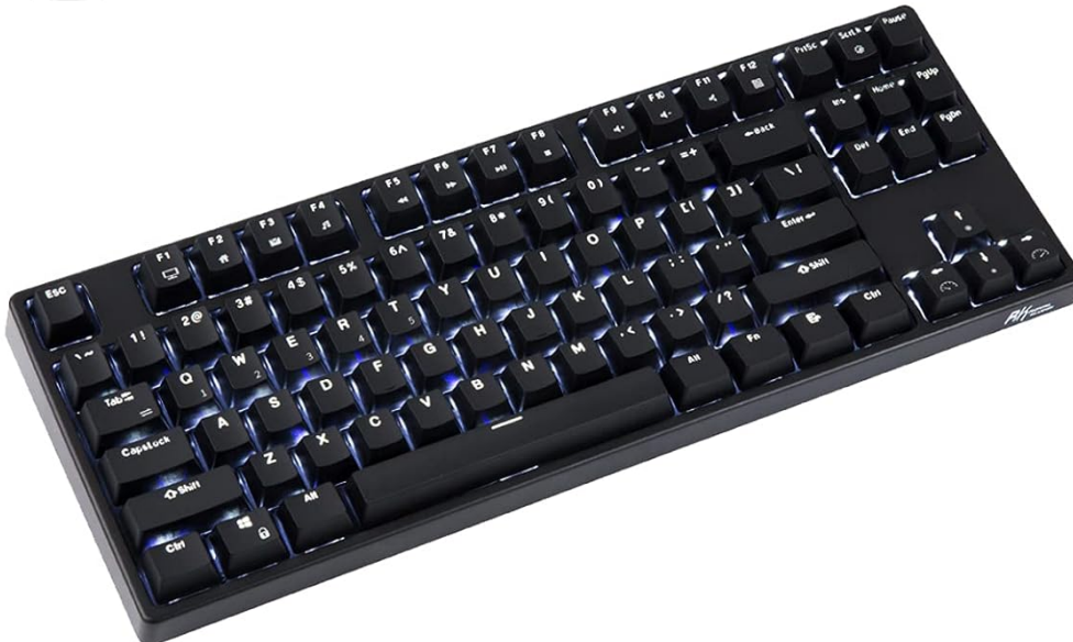
Figure 6.1: Overview of key functions and Fn combinations.