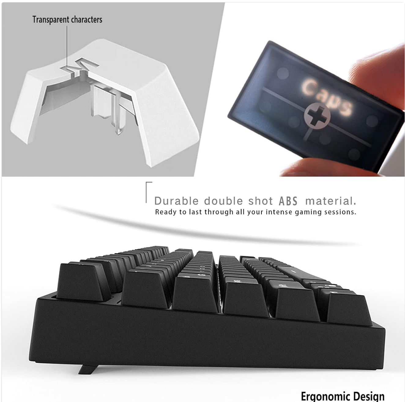
Figure 2.2: Durable double shot ABS keycaps and ergonomic design for comfort.