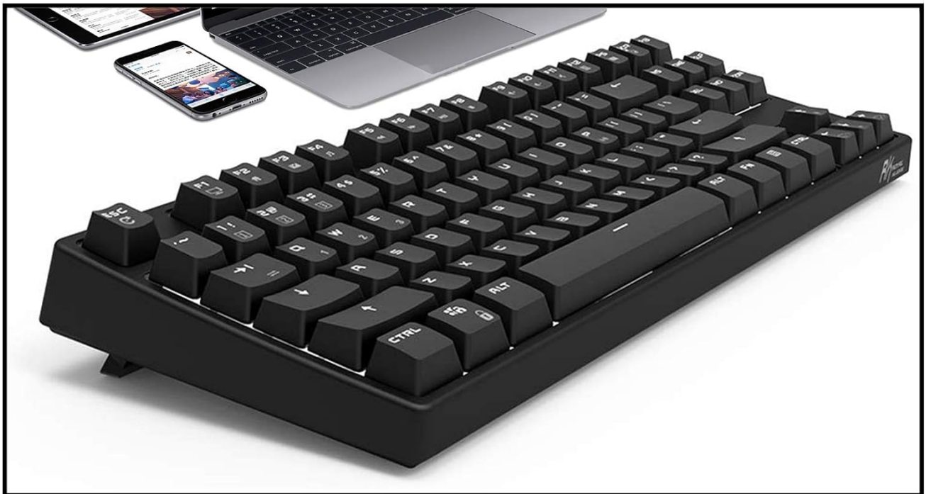
Figure 2.1: Keyboard features including 1850mAh battery and 19 backlight modes.