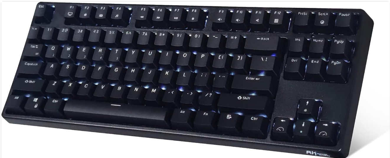
Figure 1.1: RK ROYAL KLUDGE RK987 Mechanical Keyboard

The RK ROYAL KLUDGE RK987 is an 87-key tenkeyless mechanical keyboard designed for both gaming and office use. It offers versatile connectivity options, including wired USB-C and wireless Bluetooth, making it compatible with a wide range of operating systems such as Windows, iOS, MacOS, Linux, and Android. This manual provides detailed instructions for setting up, operating, and maintaining your keyboard to ensure optimal performance.