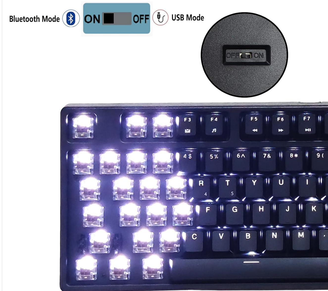
Figure 5.2: The switch on the keyboard's bottom for USB (OFF) and Bluetooth (ON) modes.

Video 5.1: Demonstrates the Bluetooth pairing process for the RK ROYAL KLUDGE Mechanical Keyboard.