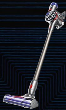
Dyson V8 Animal