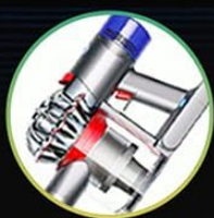
Dyson V8 Absolute Pro