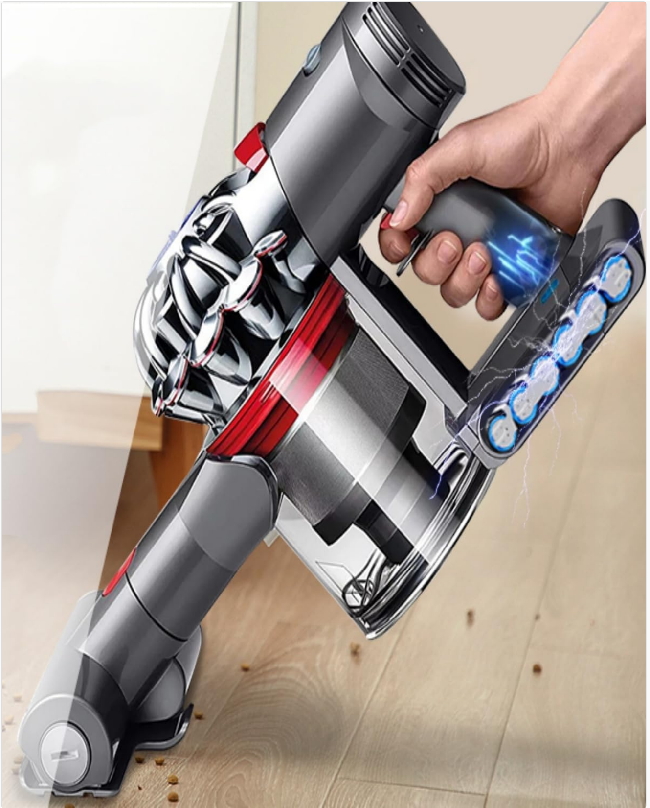
Image: A Dyson V6 vacuum cleaner in active use, demonstrating the battery's integration and function during operation.