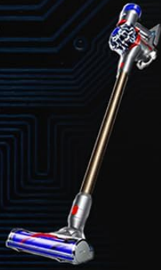
Dyson V8 Absolute