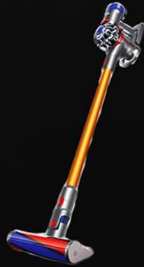
Dyson V8 Fully