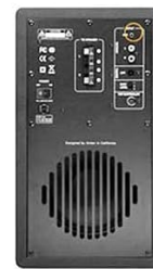
Old home speaker

Plug and upgraded non-Bluetooth devices to wireless