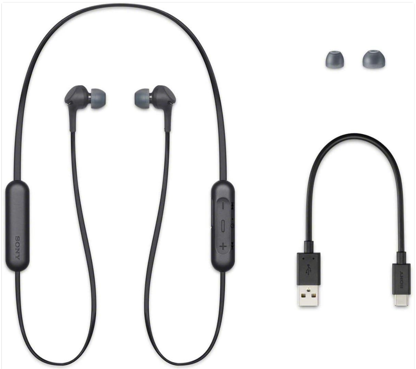
Figure 2: Included items: headphones, eartips, and USB Type-C cable.