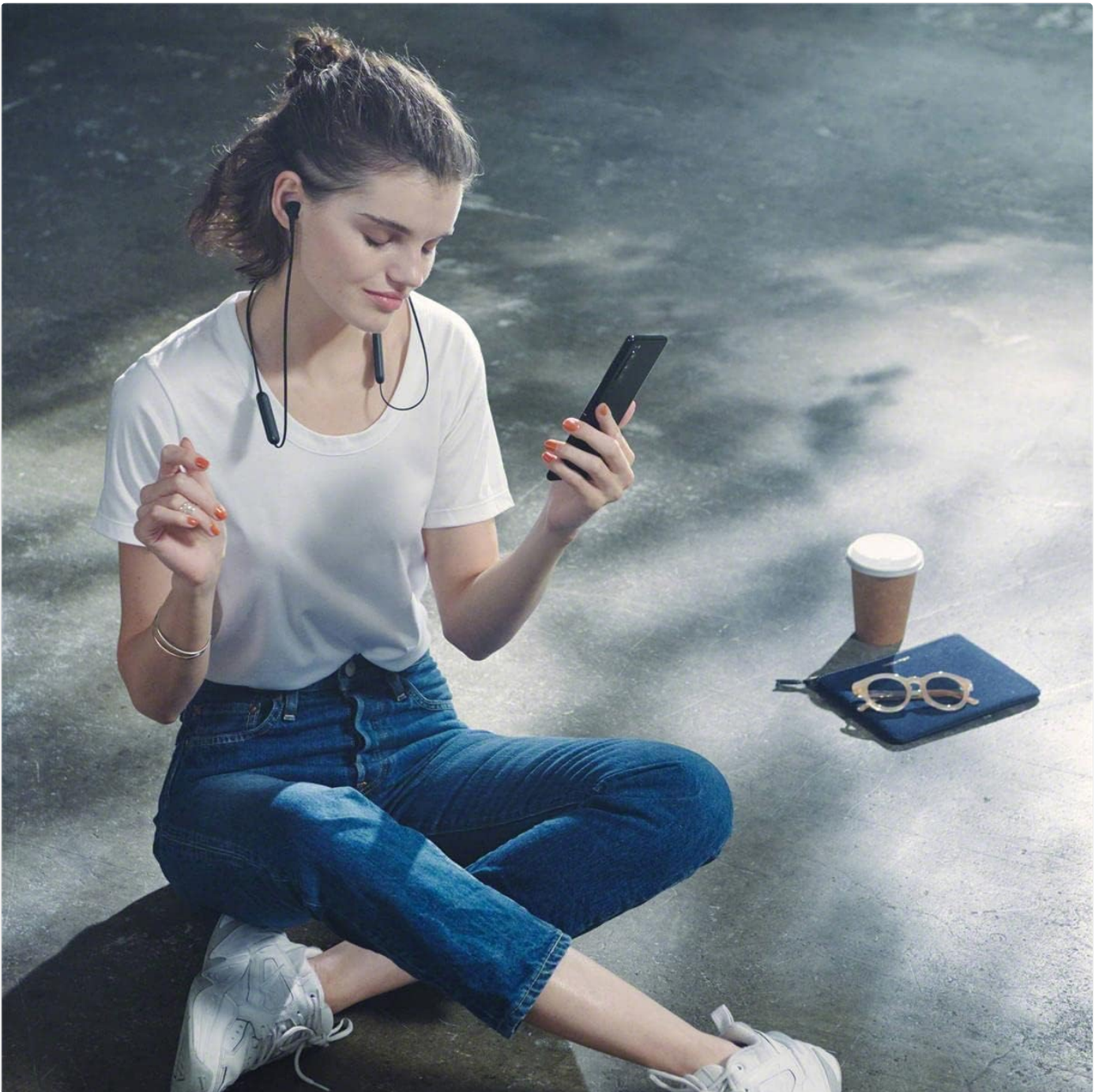
Figure 3: User enjoying music with the lightweight and flexible WI-XB400 headphones.