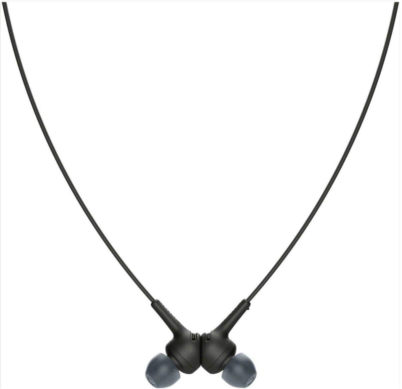
Figure 6: The magnetic earbuds snap together for secure and tangle-free storage around the neck.