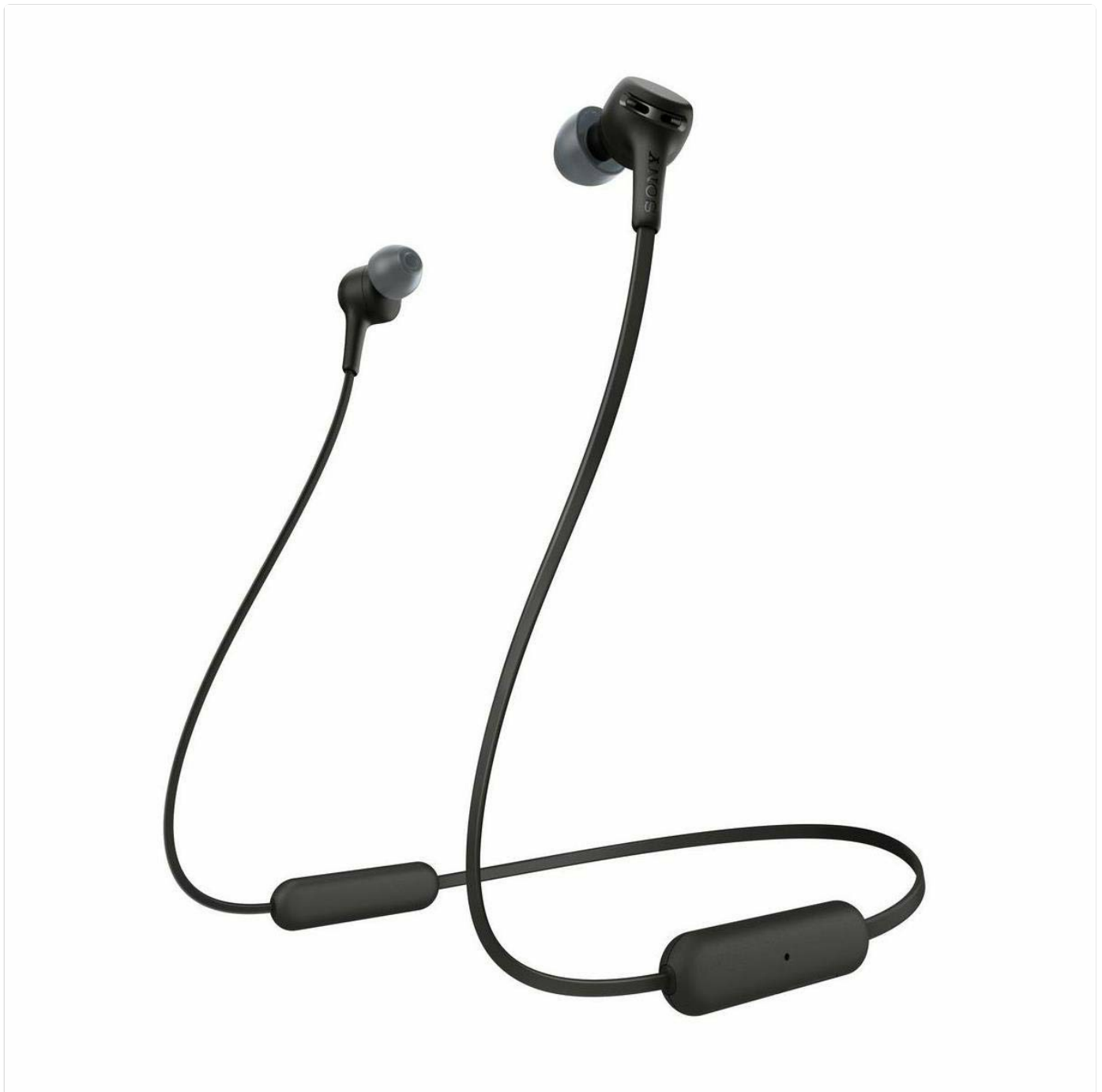
Figure 1: Sony WI-XB400 Wireless In-Ear Headphones, black color.