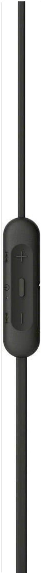
Figure 5: Close-up of the inline control panel with volume and multi-function buttons.