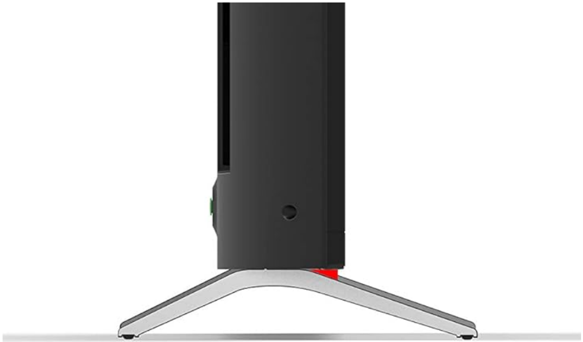
Image: Side view of the Sharp 50BL5EA TV, illustrating its depth and design.