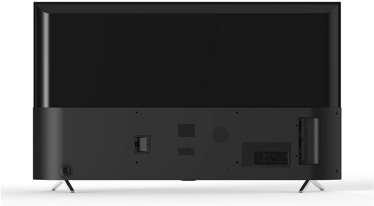
Image: Rear view of the Sharp 50BL5EA TV, displaying the arrangement of various input and output ports for external devices.