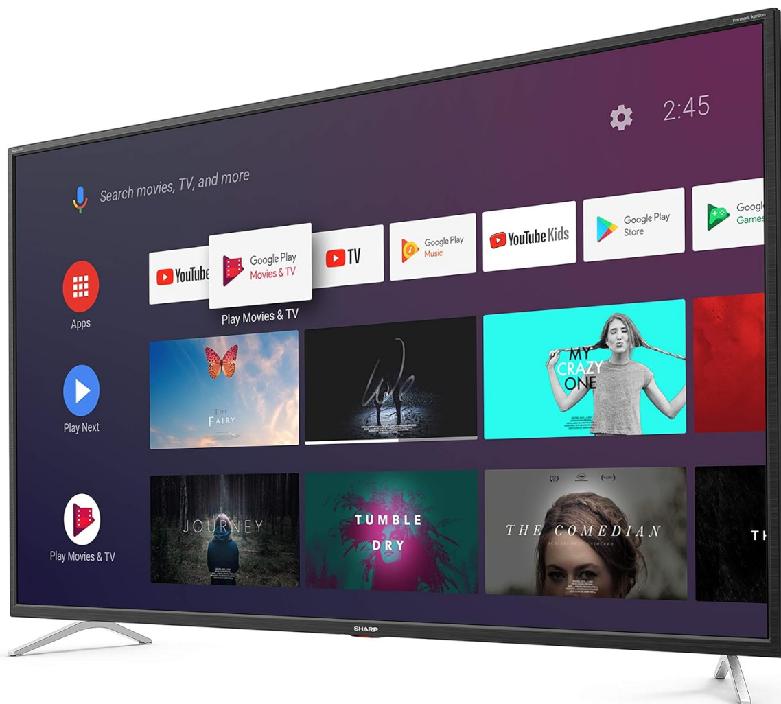
Image: Angled front view of the Sharp 50BL5EA TV, showcasing the Android TV interface from a different perspective.