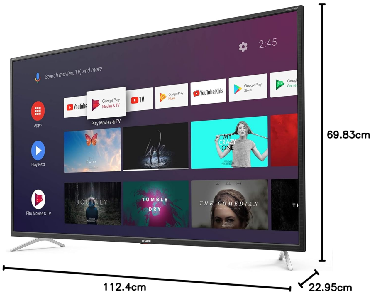
Image: Front view of the Sharp 50BL5EA TV, illustrating its physical dimensions: 112.4 cm width, 69.83 cm height, and 22.95 cm depth (with stand).