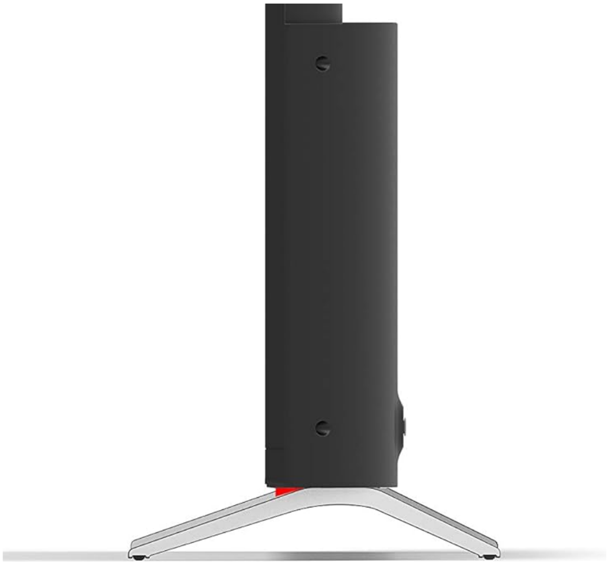
Image: Another side view of the Sharp 50BL5EA TV, showing the overall slimness.