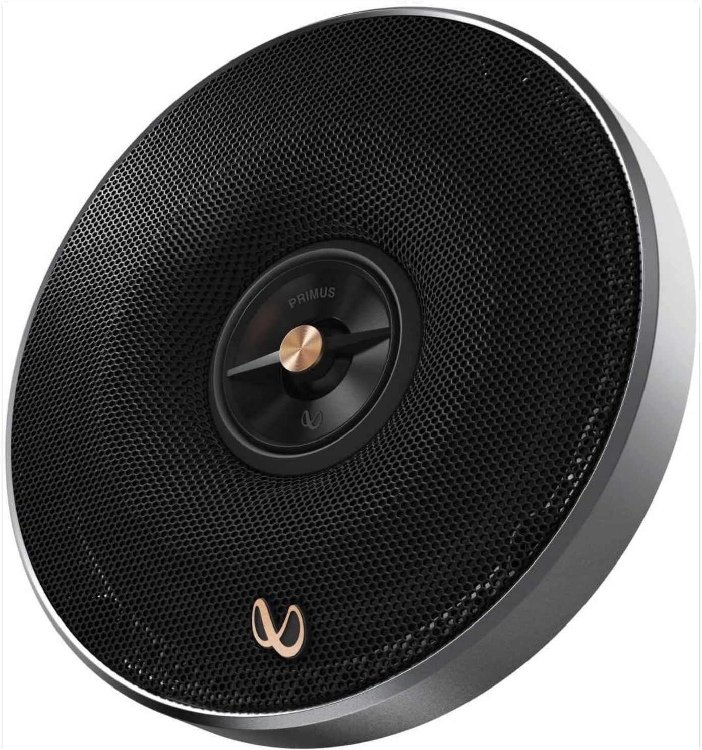
Figure 3: Front view of the speaker with the grille in place, ready for use.