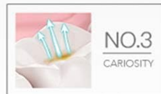
Image: An illustration demonstrating how pulsing water flows clean teeth. It highlights three key areas of cleaning: subgingival (below the gumline), interdental (between teeth), and cariosity (cavity-prone areas), showing the effectiveness of the water flosser in reaching these regions.