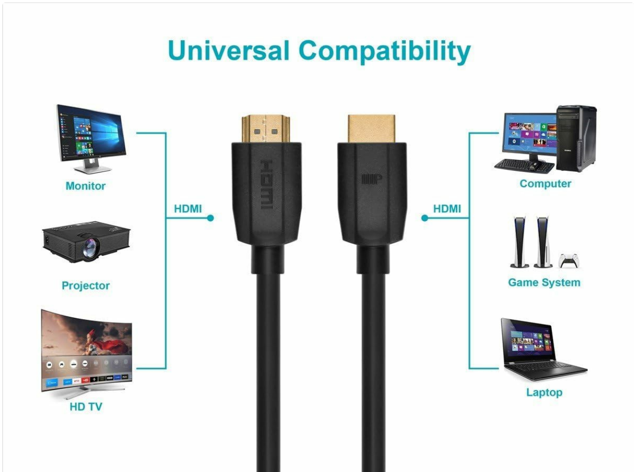
Figure 1: Connection example showing a laptop connected to a display screen using the HDMI cable.