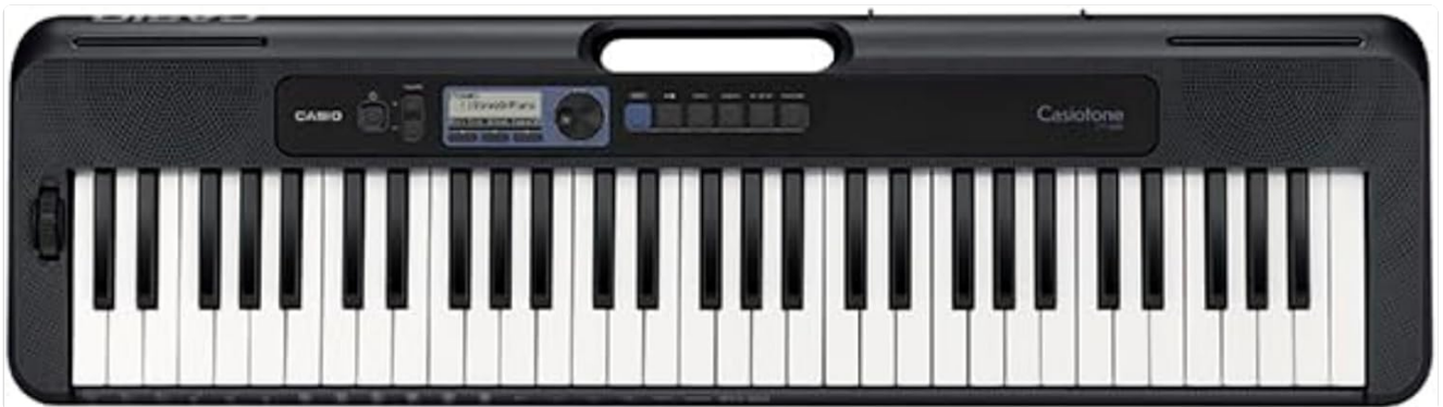
Figure 1: Top-down view of the Casio Casiotone CT-S300 Portable Keyboard.

The Casio Casiotone CT-S300 is a portable electronic keyboard designed for musicians of all levels. It features 61 touch-sensitive keys, a wide array of tones and rhythms, and versatile connectivity options, making it suitable for practice, performance, and music creation anywhere.