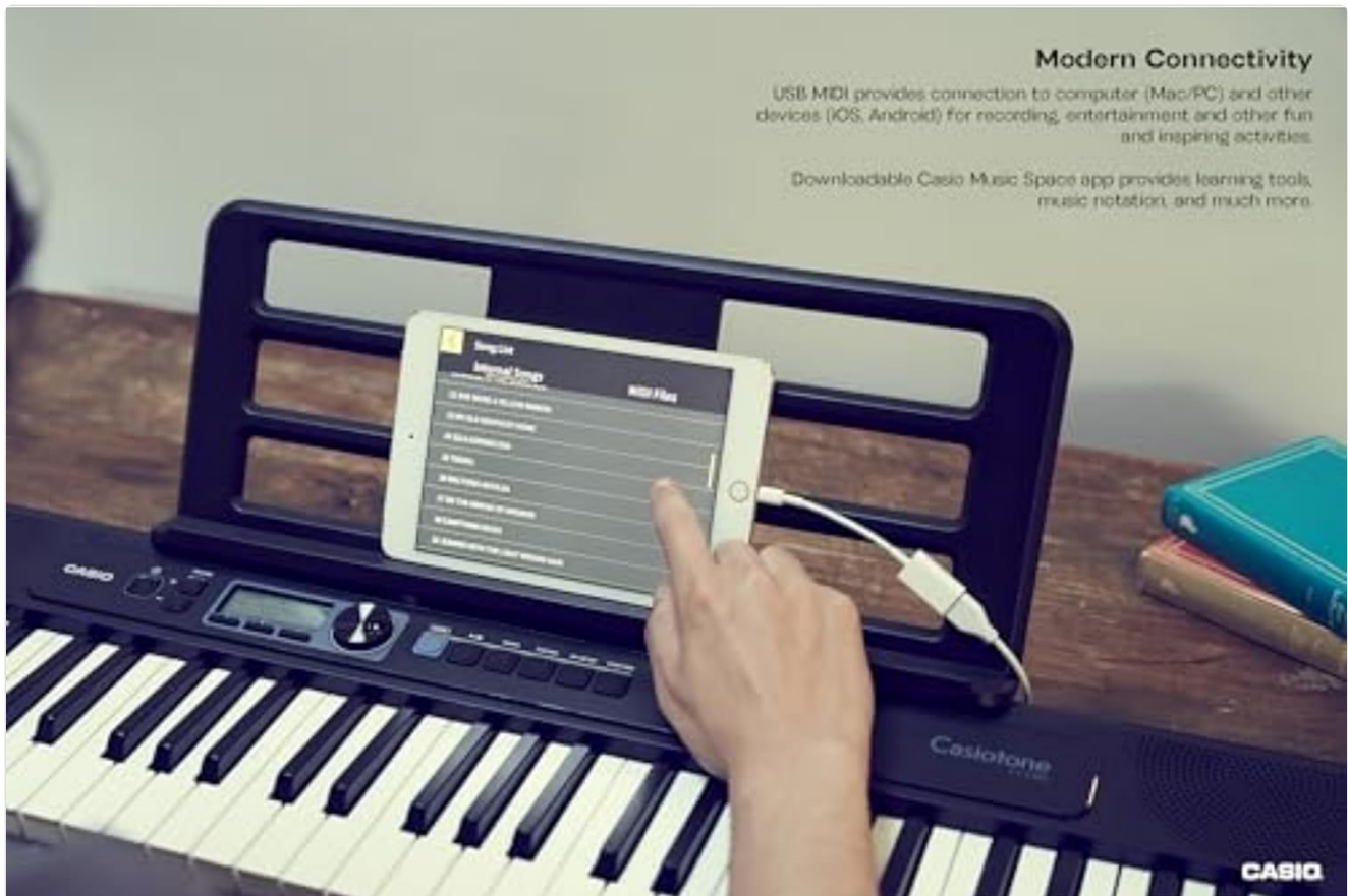
Figure 2: Detail of the control panel and connectivity options on the Casio Casiotone CT-S300.