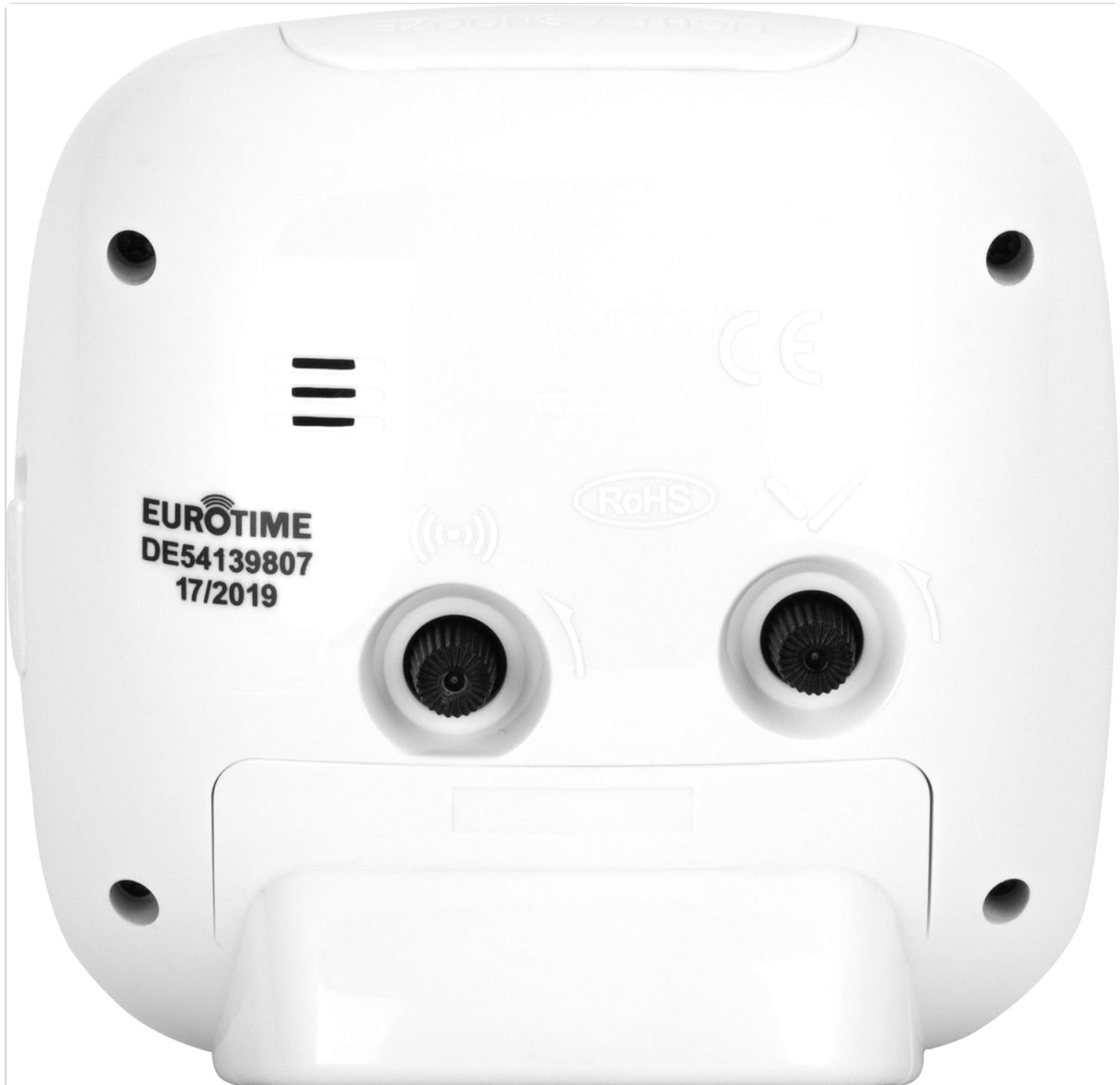
Figure 2: Back view of the alarm clock. This image highlights the battery compartment, the time setting knob, and the alarm setting knob, essential for initial setup.