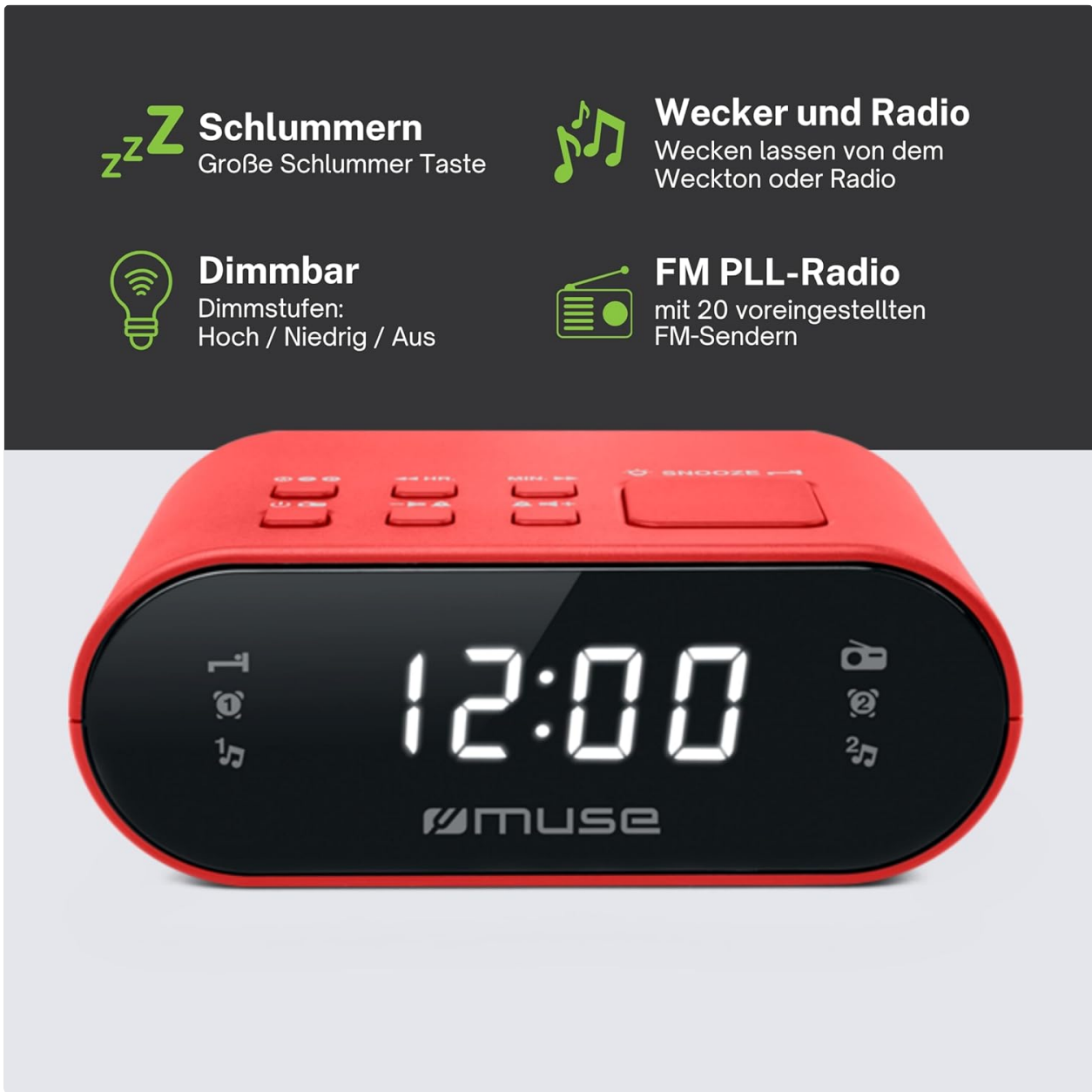
Figure 3: Key features of the MUSE M-10 Red Radio Alarm Clock, including snooze, radio or buzzer alarm, dimmable display, and FM PLL radio with 20 presets.