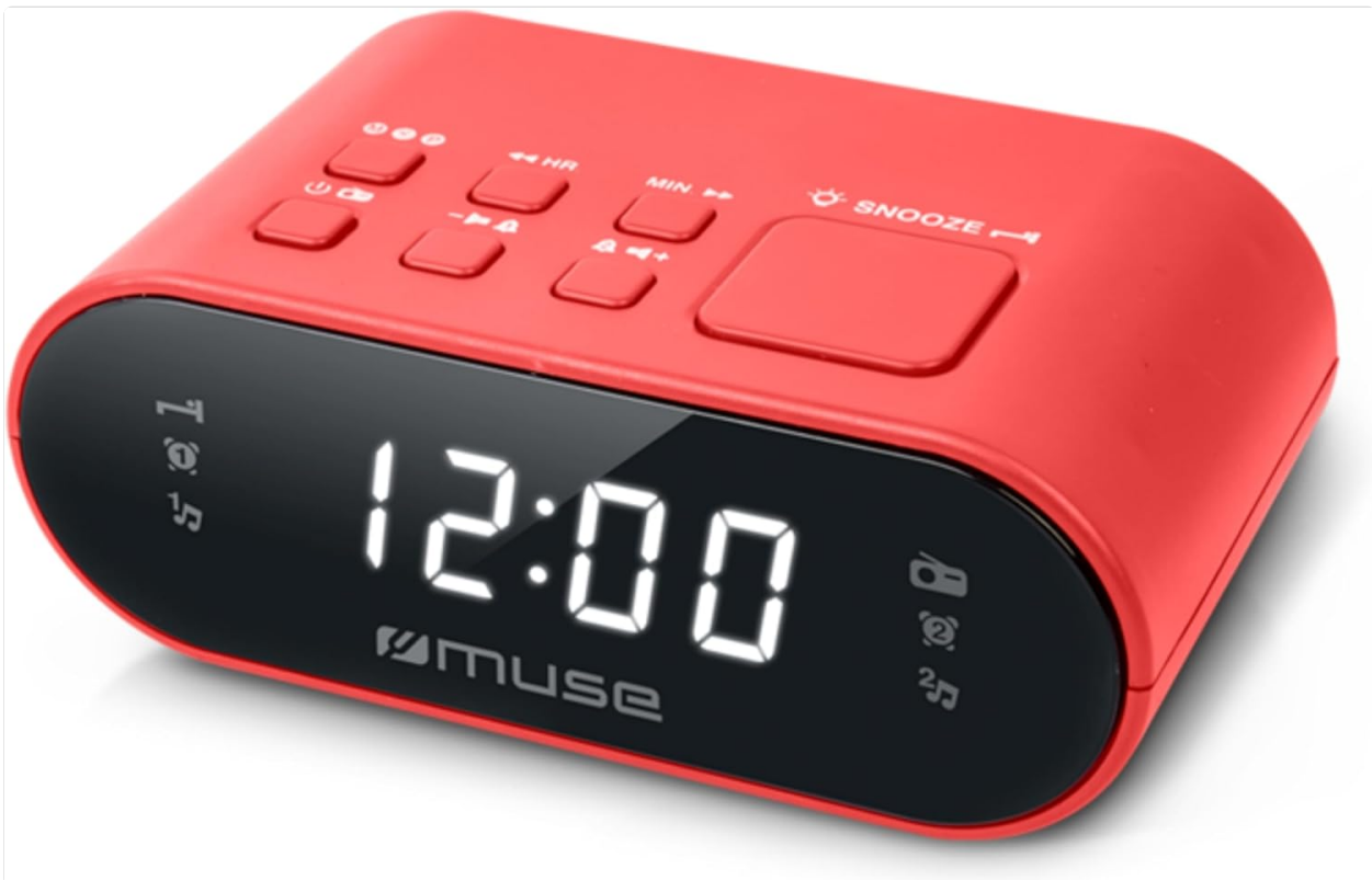
Figure 1: MUSE M-10 Red Radio Alarm Clock. This image shows the front view of the red alarm clock with its digital LED display showing '12:00' and various control buttons on the top panel.

Thank you for purchasing the MUSE M-10 Red Radio Alarm Clock. This manual provides essential information for the safe and efficient operation of your device. Please read these instructions carefully before use and retain them for future reference.