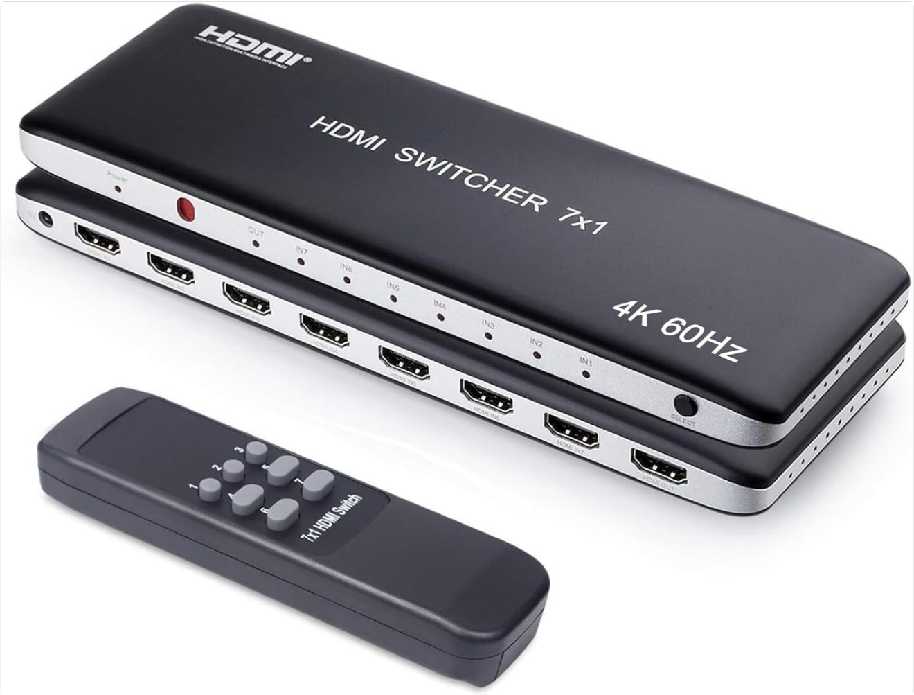
Figure 5: The Univivi 7 Port HDMI Switch and its remote control. The remote allows for convenient selection of any of the seven HDMI inputs.