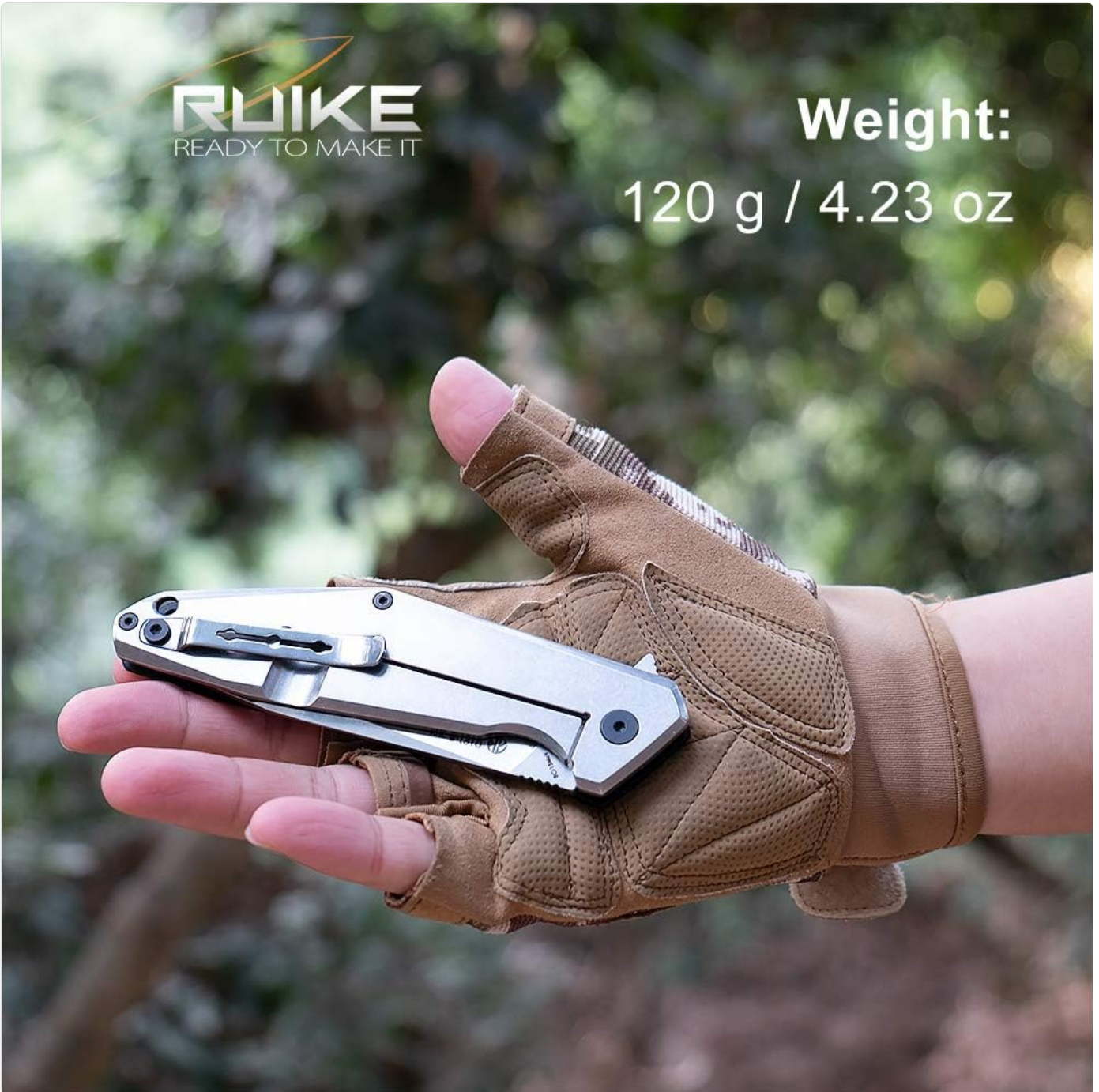
Figure 3: The Ruike D191 knife showing its weight of 120 grams (4.23 ounces).