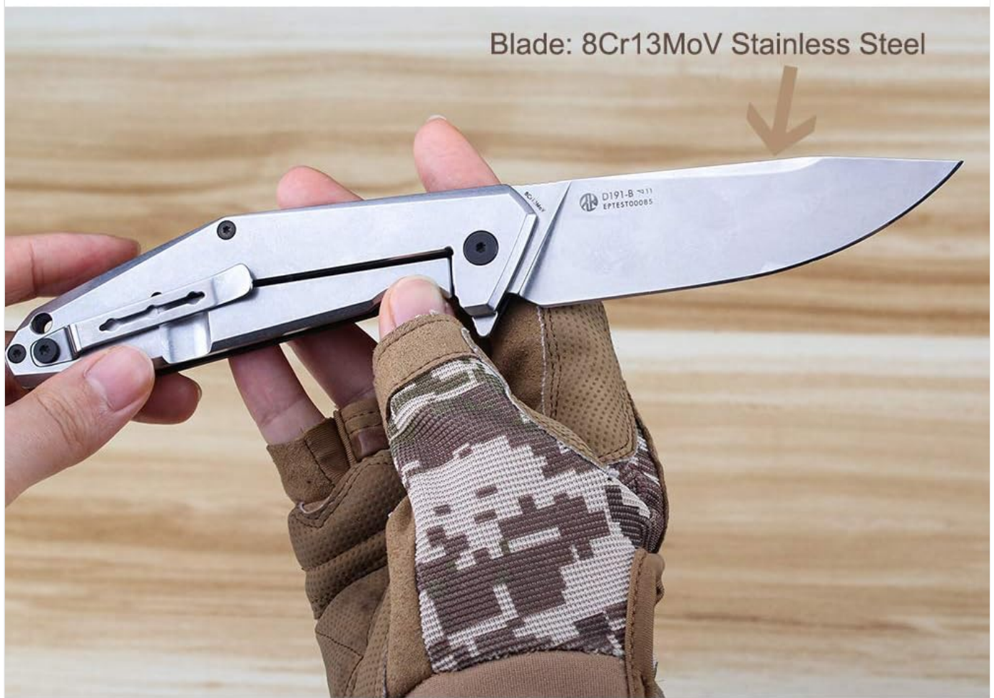
Figure 7: The durable 8Cr13MoV Stainless Steel blade of the Ruike D191.