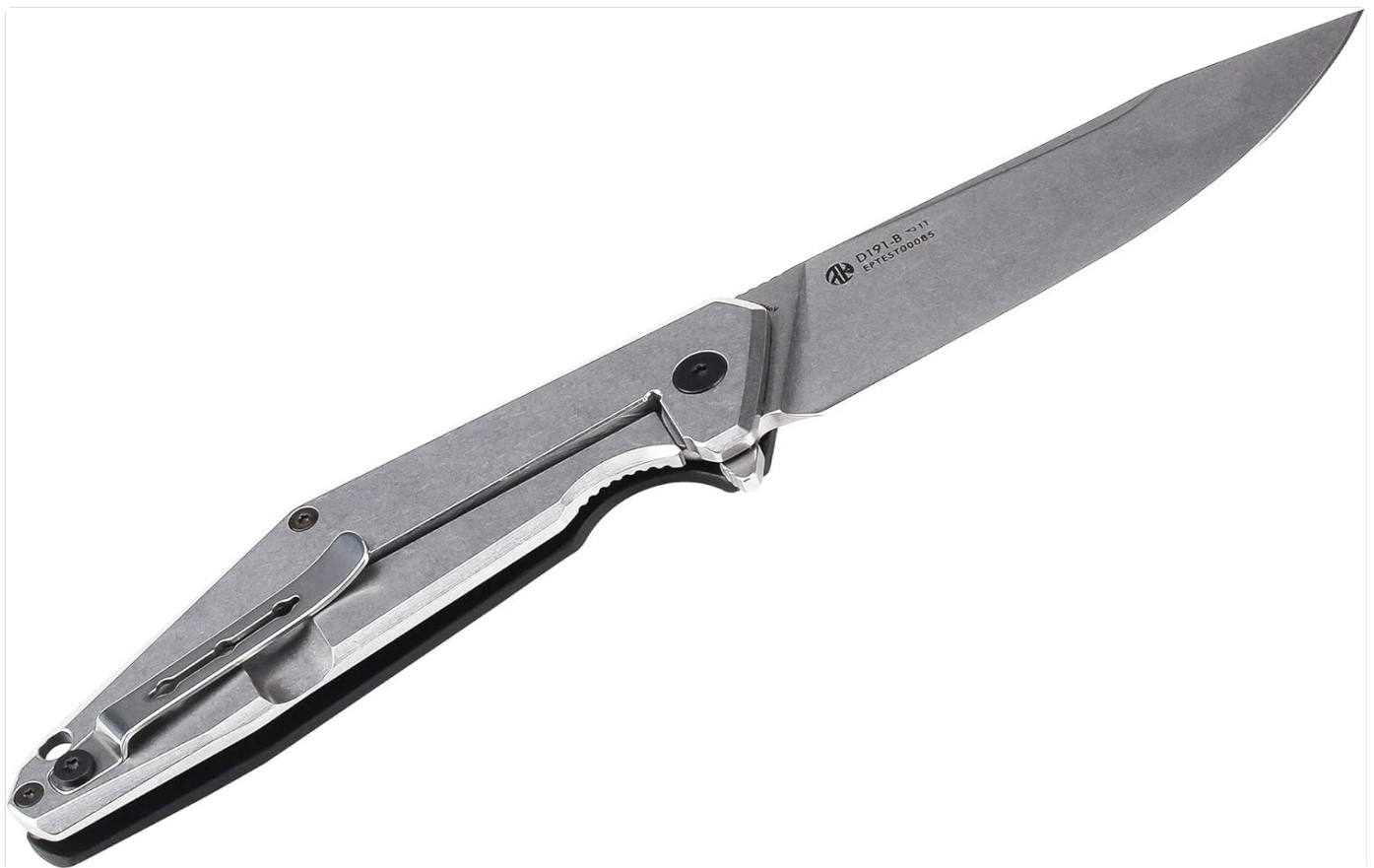
Figure 1: Ruike D191 Folding Pocket Knife, showing the open blade and handle design.