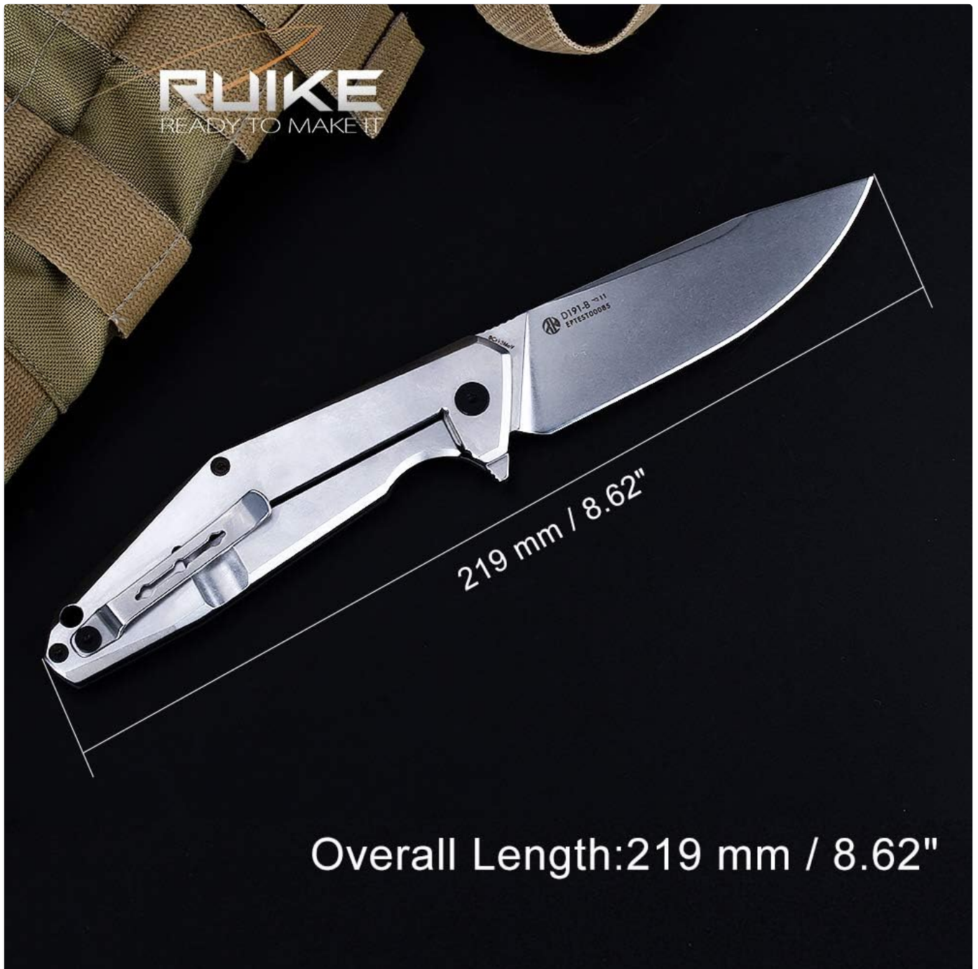
Figure 2: Overall length of the Ruike D191 knife, measuring 219 mm (8.62 inches).