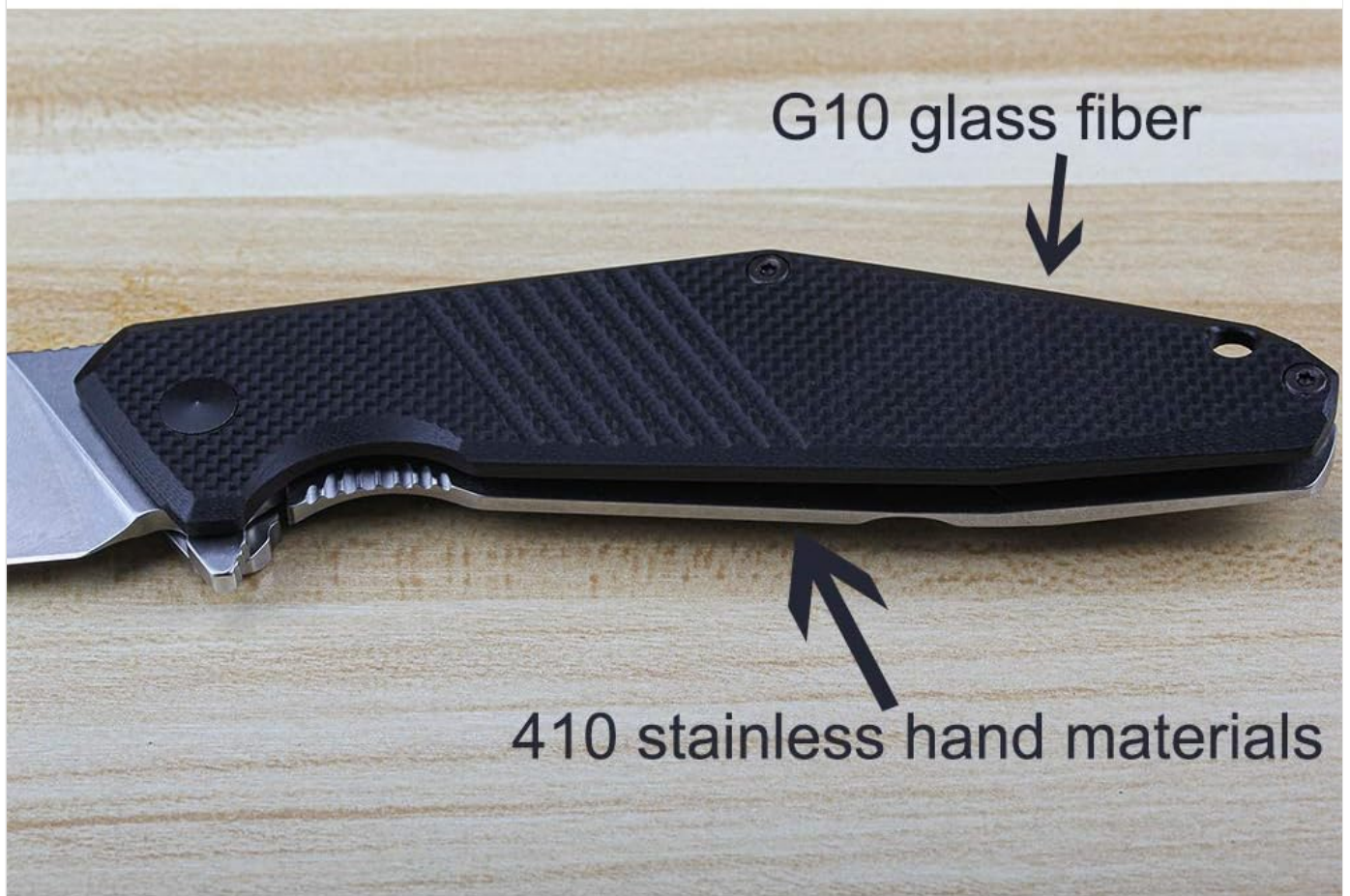
Figure 4: Close-up of the Ruike D191 handle, highlighting the G10 glass fiber and 410 stainless steel hand materials.