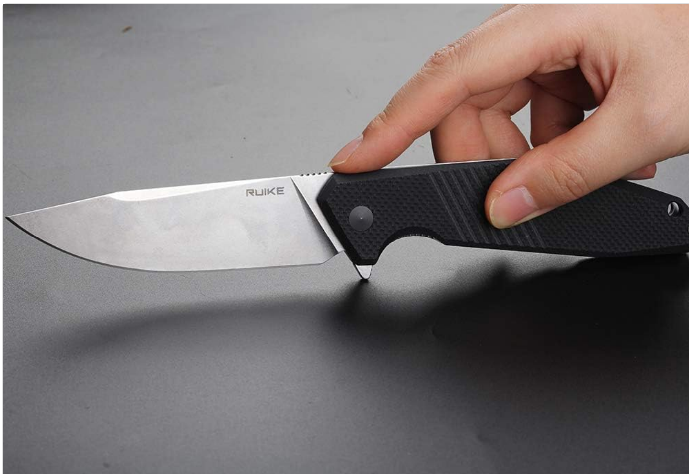
Figure 8: The Ruike D191 knife held comfortably in hand, demonstrating its ergonomic design.