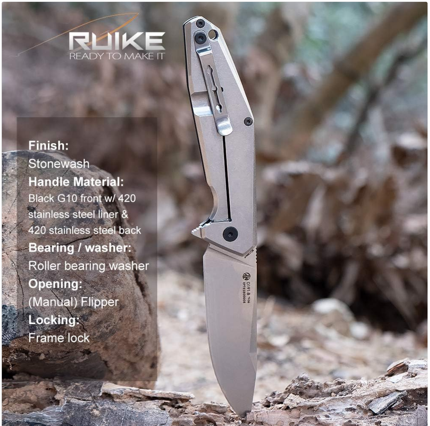
Figure 6: Detailed specifications of the Ruike D191 knife, including stonewash finish, handle material (Black G10 front w/ 420 stainless steel liner & 420 stainless steel back), roller bearing washer, manual flipper opening, and frame lock.