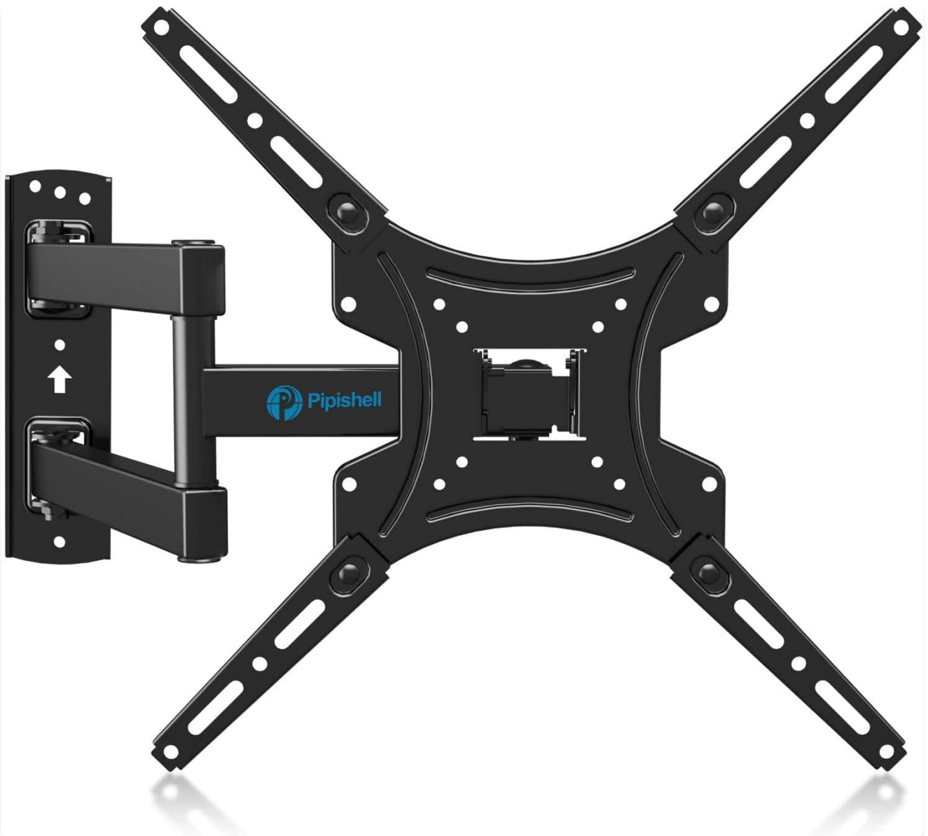
Figure 1: Pipishell Full Motion TV Wall Mount (PIMF2)