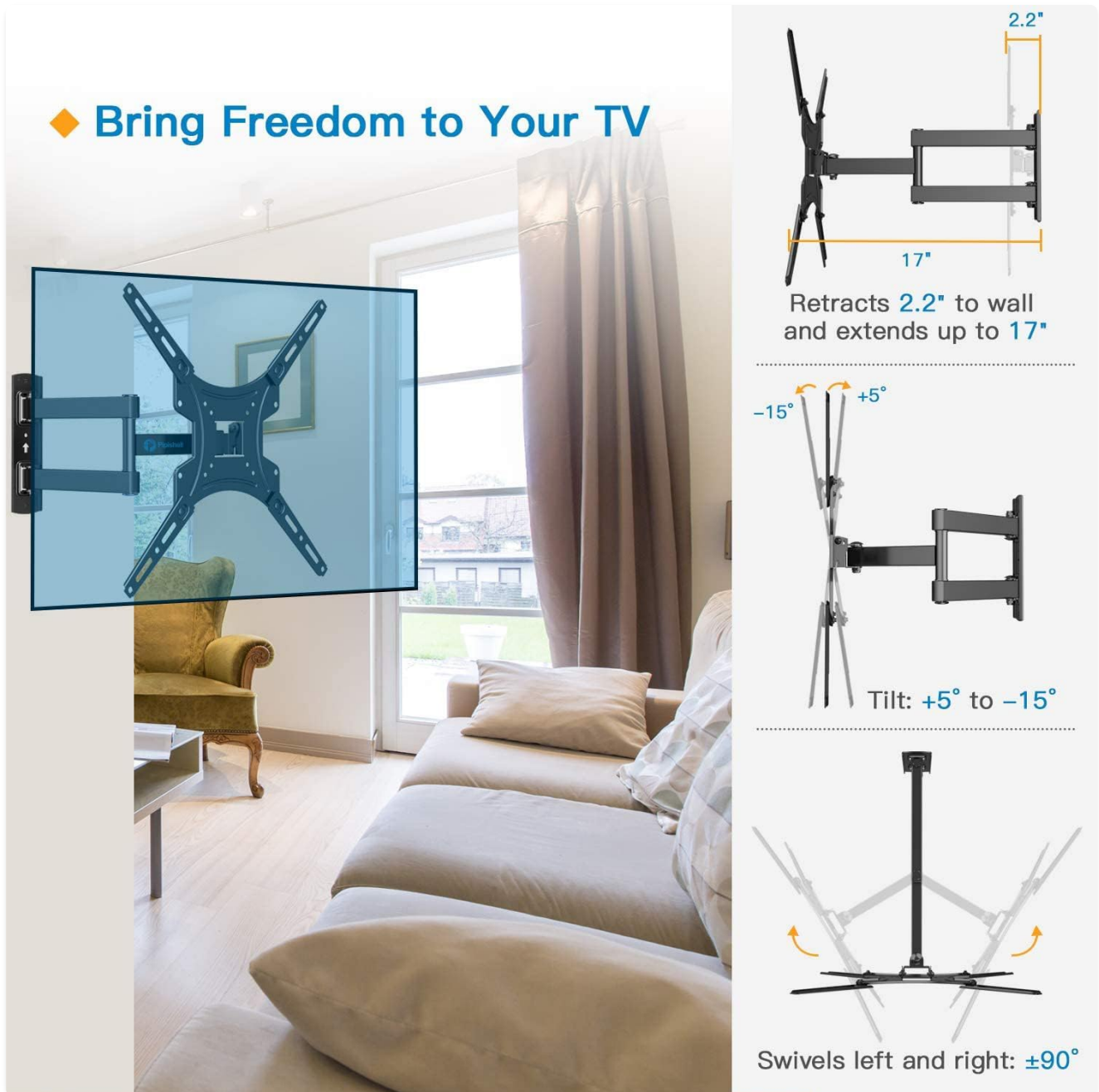
Figure 5: Visual representation of the mount's tilt, swivel, and extension capabilities.

Always adjust the TV gently and ensure all connections are secure after repositioning.