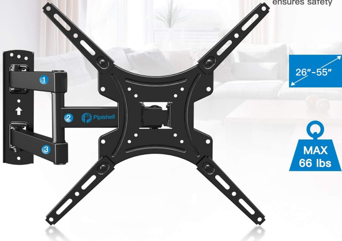
Figure 4: Close-up of the mount showing single stud installation design and heavy-duty steel construction.

Heavy duty steel construction ensures safety