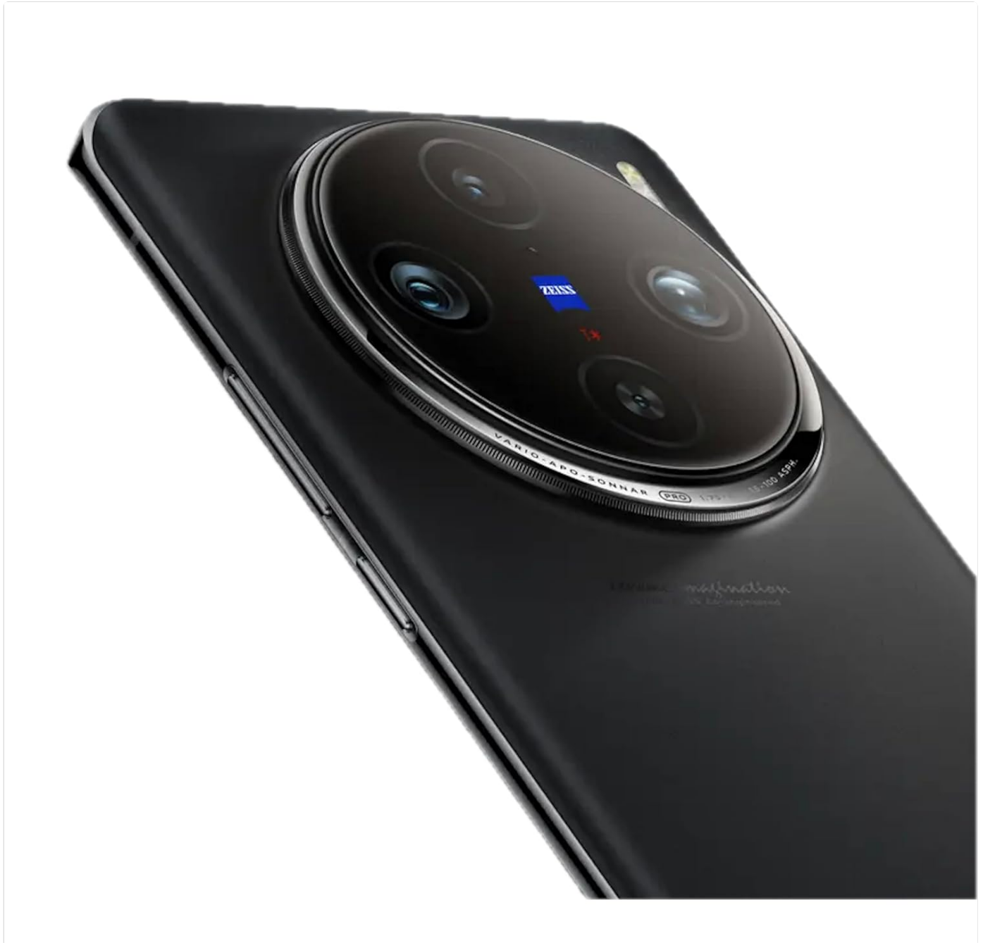
Image: Rear view of the VIVO X100 Pro 5G Smartphone highlighting its prominent circular camera module with ZEISS branding.

To access the camera, tap the Camera icon on your home screen or lock screen. Explore various modes such as Portrait, Night, Pro, and Panorama for diverse photographic experiences.