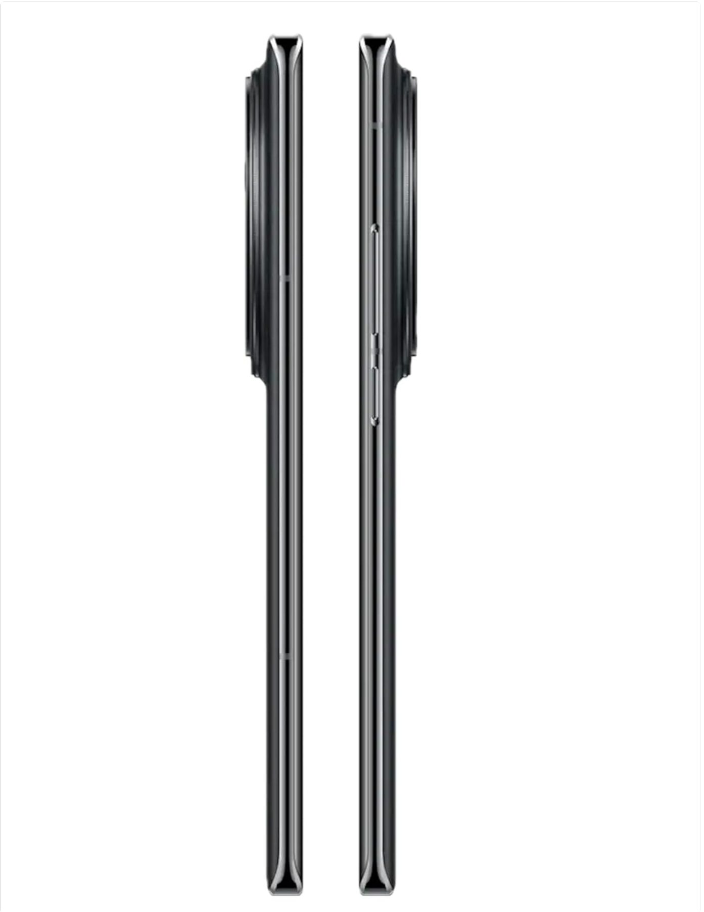
Image: Top and bottom views of the VIVO X100 Pro 5G Smartphone, showing the USB-C port and speaker grille.