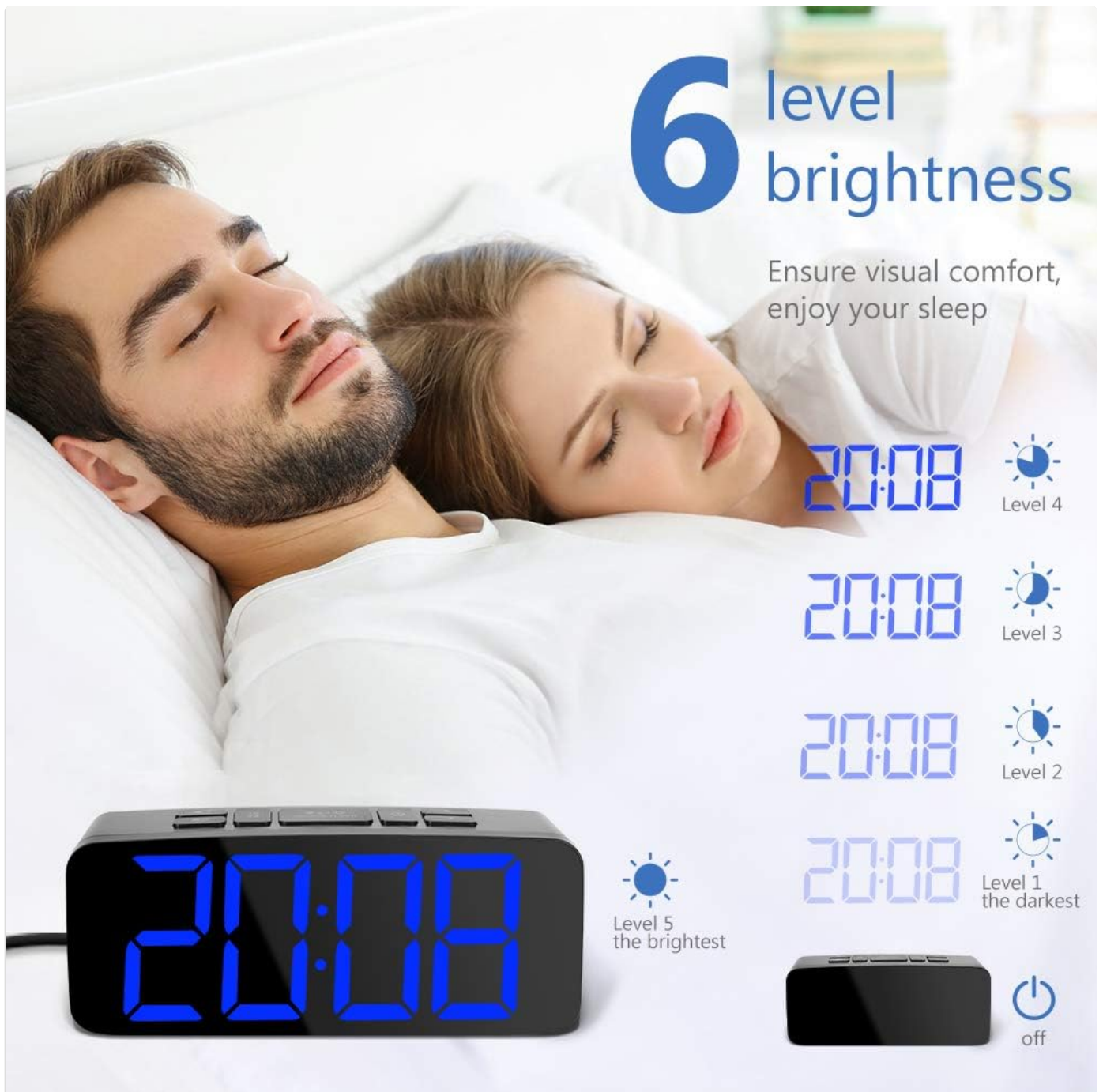
Image: YISSVIC Digital Alarm Clock demonstrating 6 levels of brightness, from Level 1 (darkest) to Level 5 (brightest), and an off state, ensuring visual comfort.