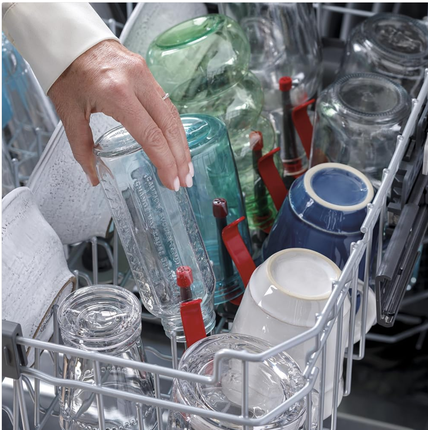
Figure 6: Utilizing the dedicated Bottle Jets feature for thorough cleaning of tall items like bottles and vases.