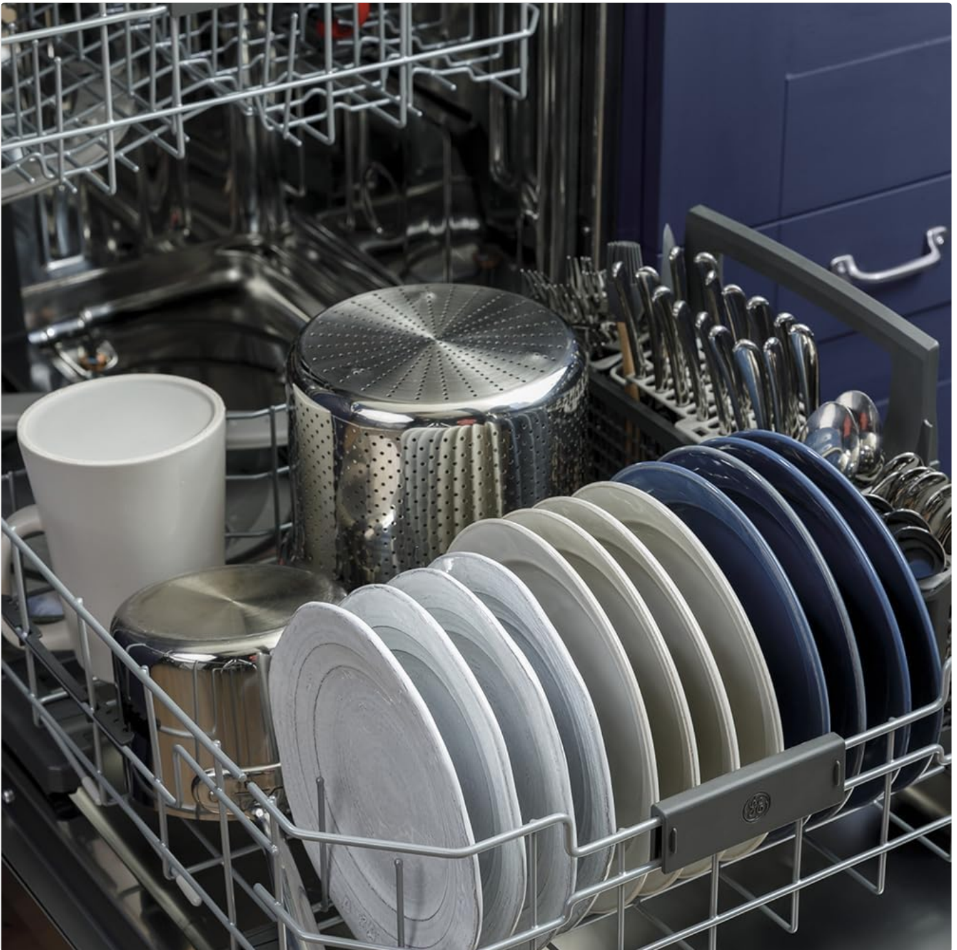
Figure 4: A full view of the dishwasher's interior, showing the lower rack with plates and pots, and the upper rack with glasses and cutlery.