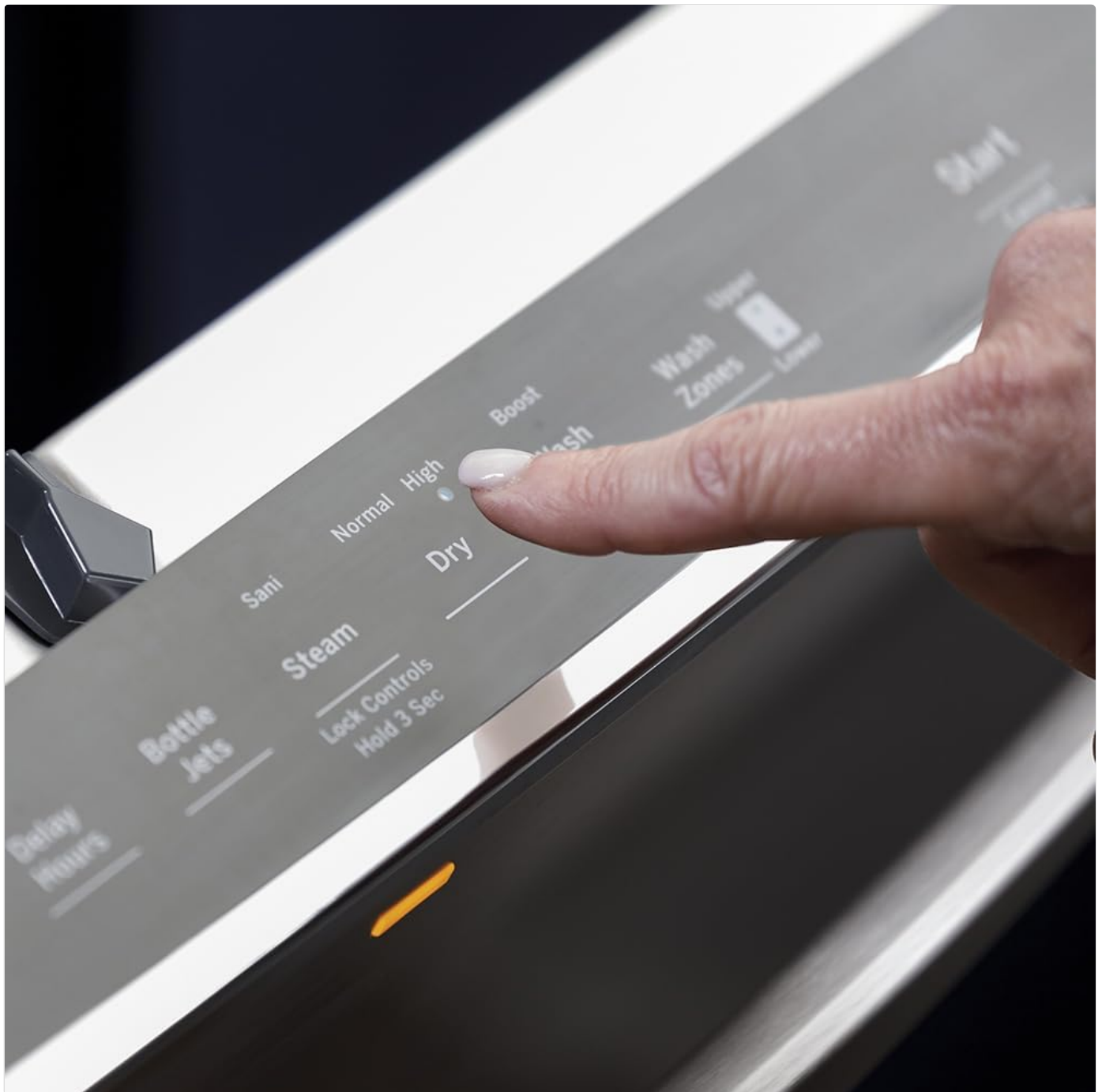
Figure 3: Interacting with the control panel, demonstrating the ease of selecting wash options.