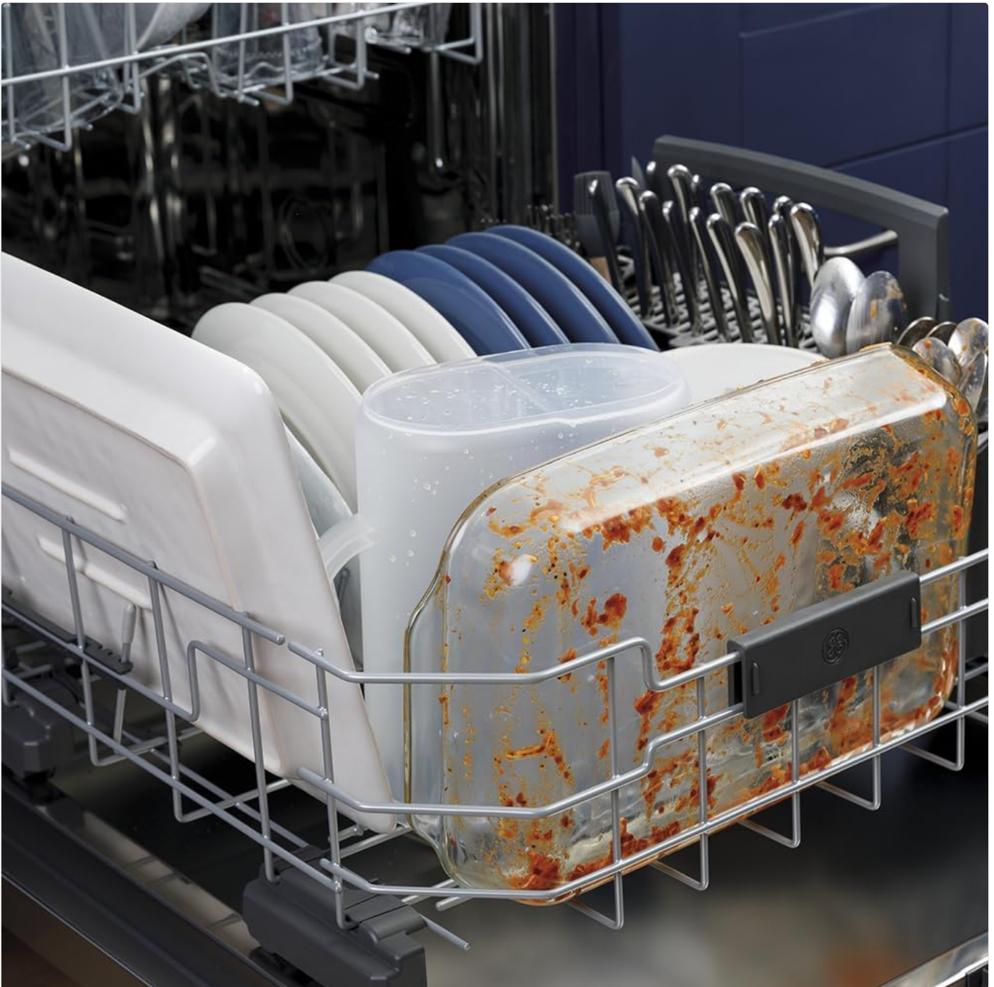
Figure 7: The lower rack loaded with heavily soiled dishes, illustrating the dishwasher's capacity for tough cleaning tasks.