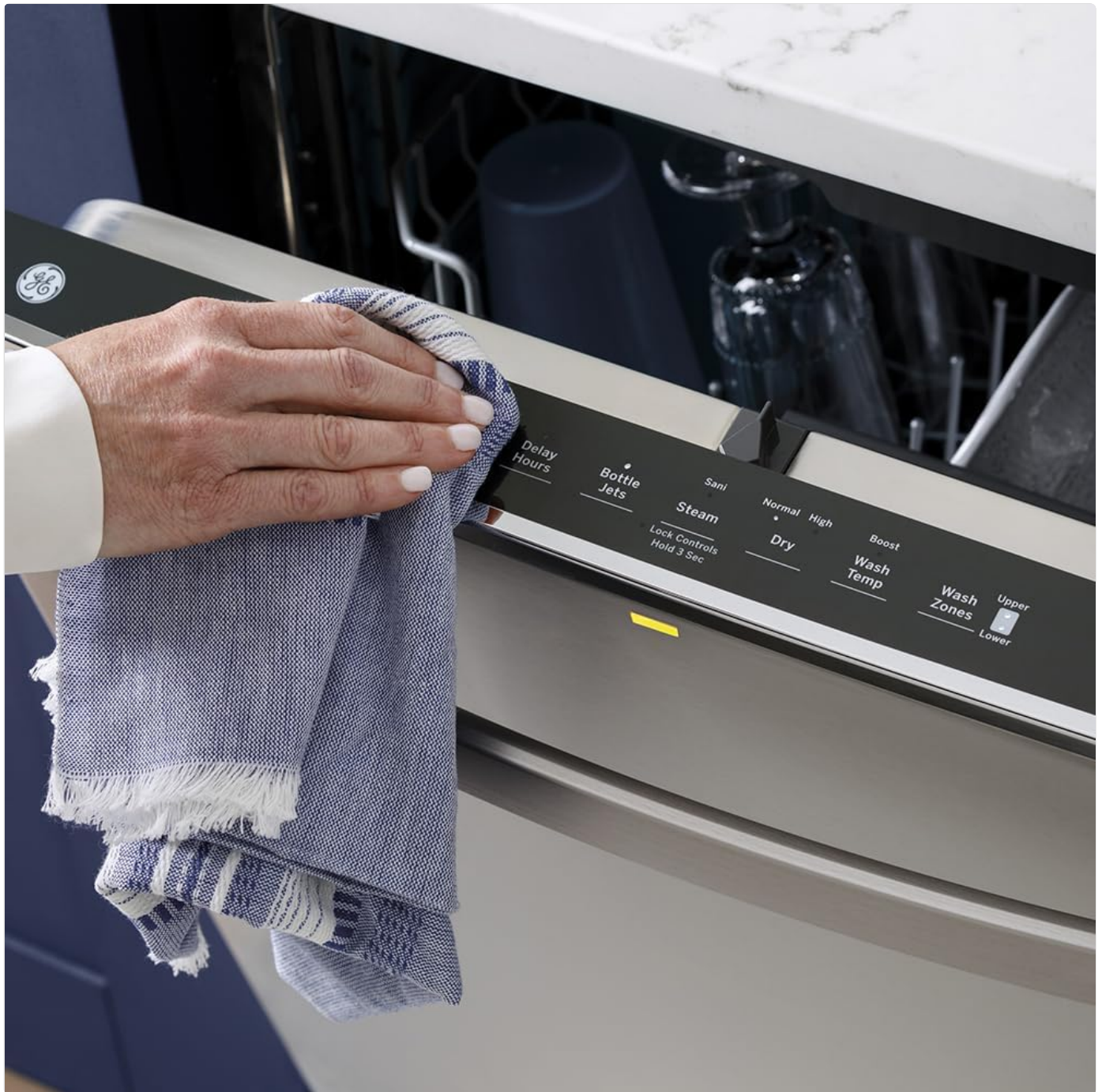
Figure 8: Cleaning the exterior of the dishwasher, highlighting its fingerprint-resistant stainless steel finish.