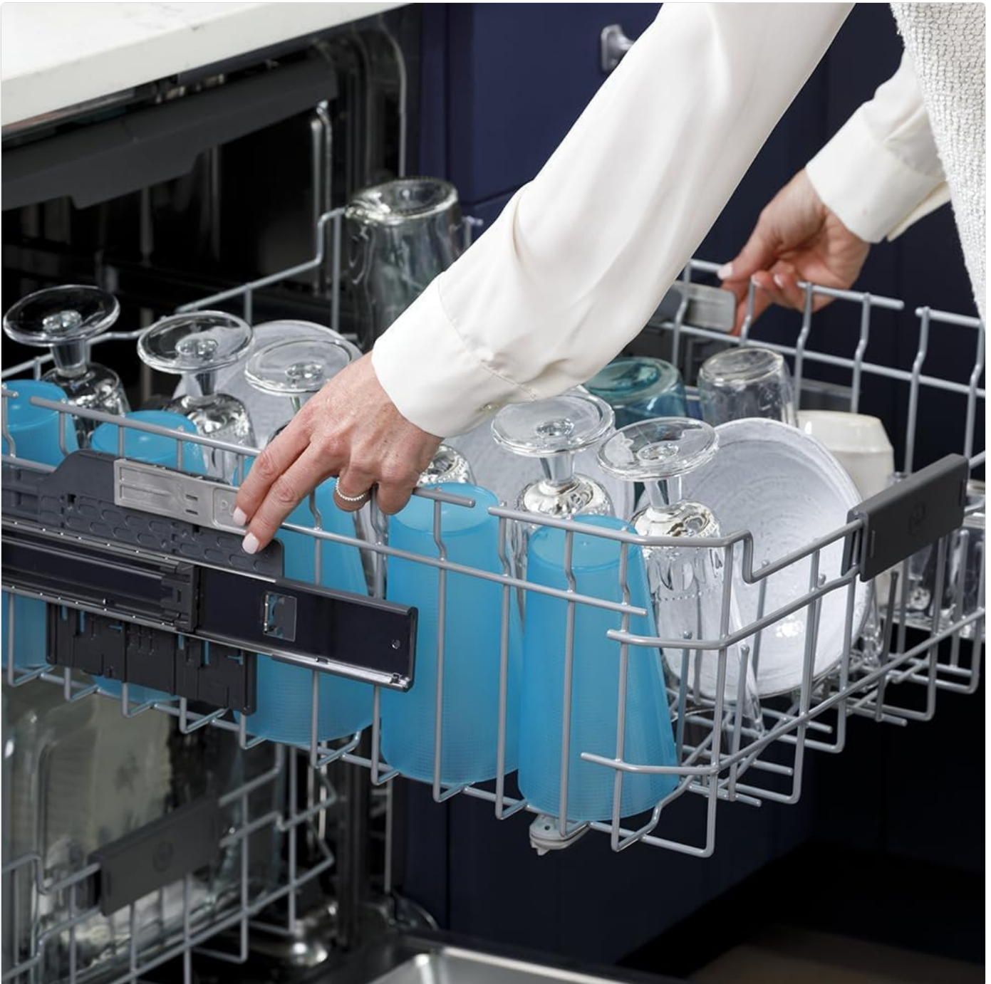
Figure 5: Loading the upper rack, demonstrating the flexible space for various dish sizes.