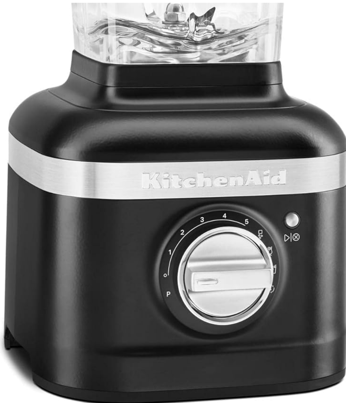
Front view of the KitchenAid K400 Variable Speed Blender, featuring the motor base, 56 oz BPA-free blender jar, and lid. The control dial is visible on the front of the base.