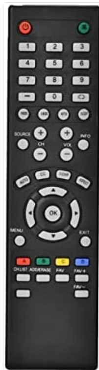
Image 3.1: Front view of the remote control, highlighting button layout.