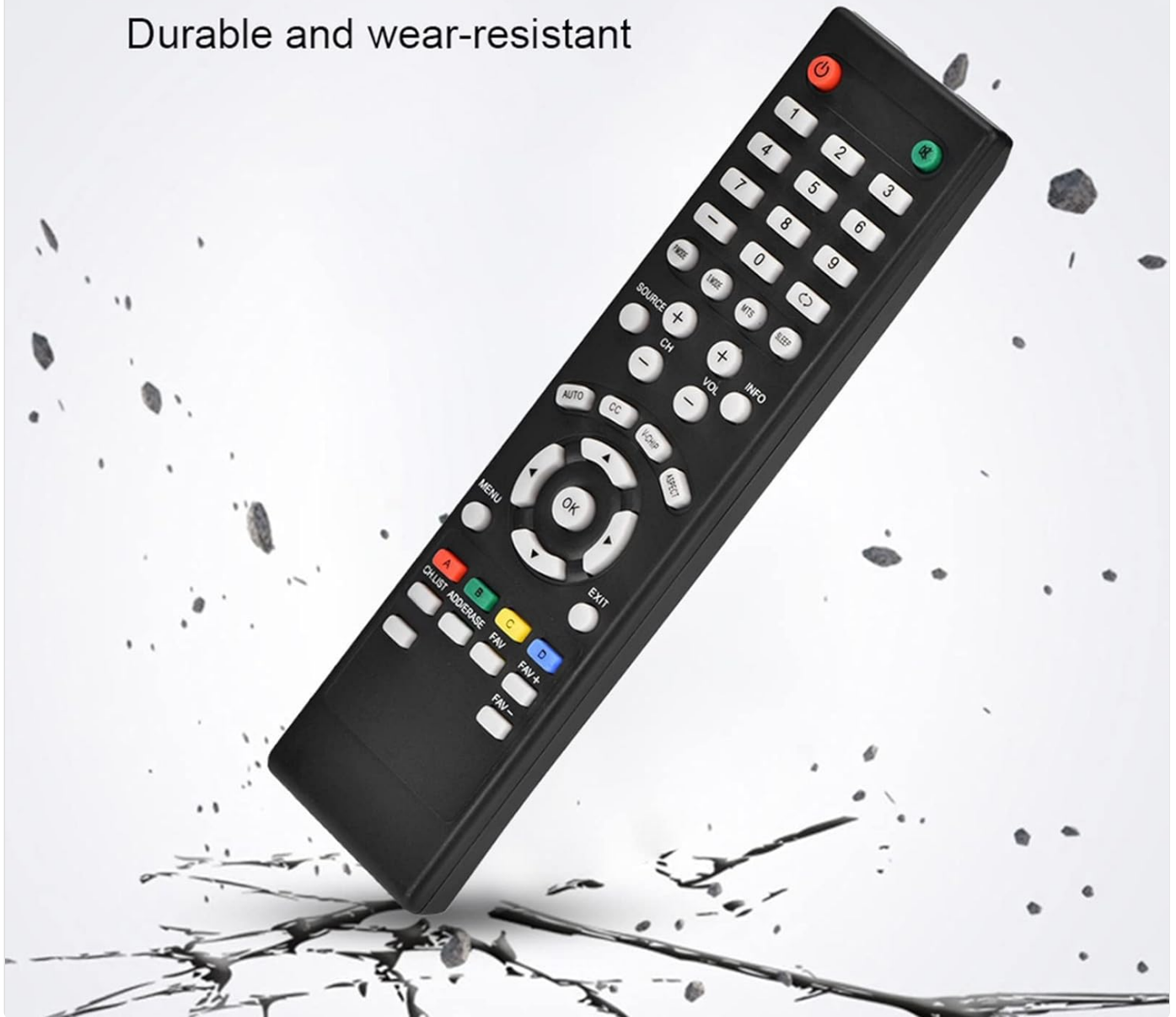
Image 4.1: The remote control, showcasing its durable construction material.