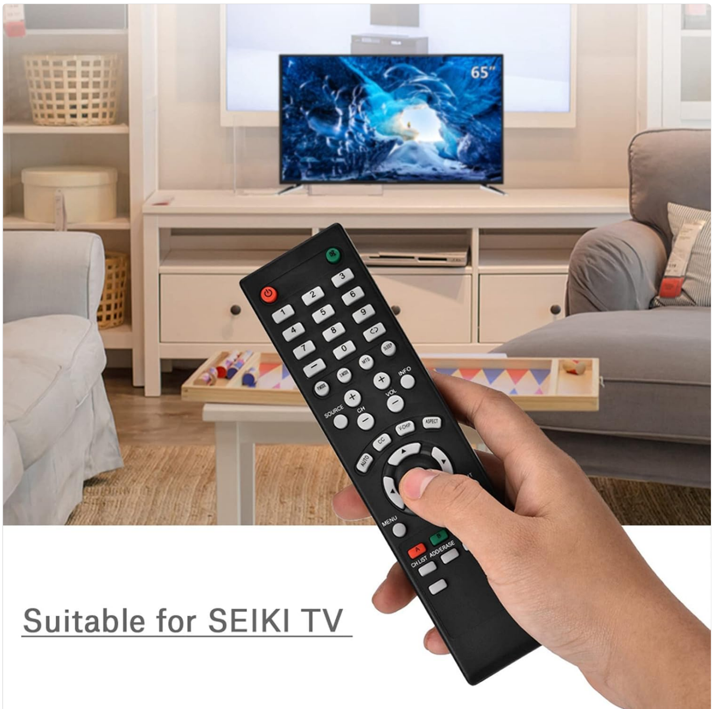
Image 1.1: The Zerone Replacement Remote Control in use, demonstrating its compatibility with televisions.